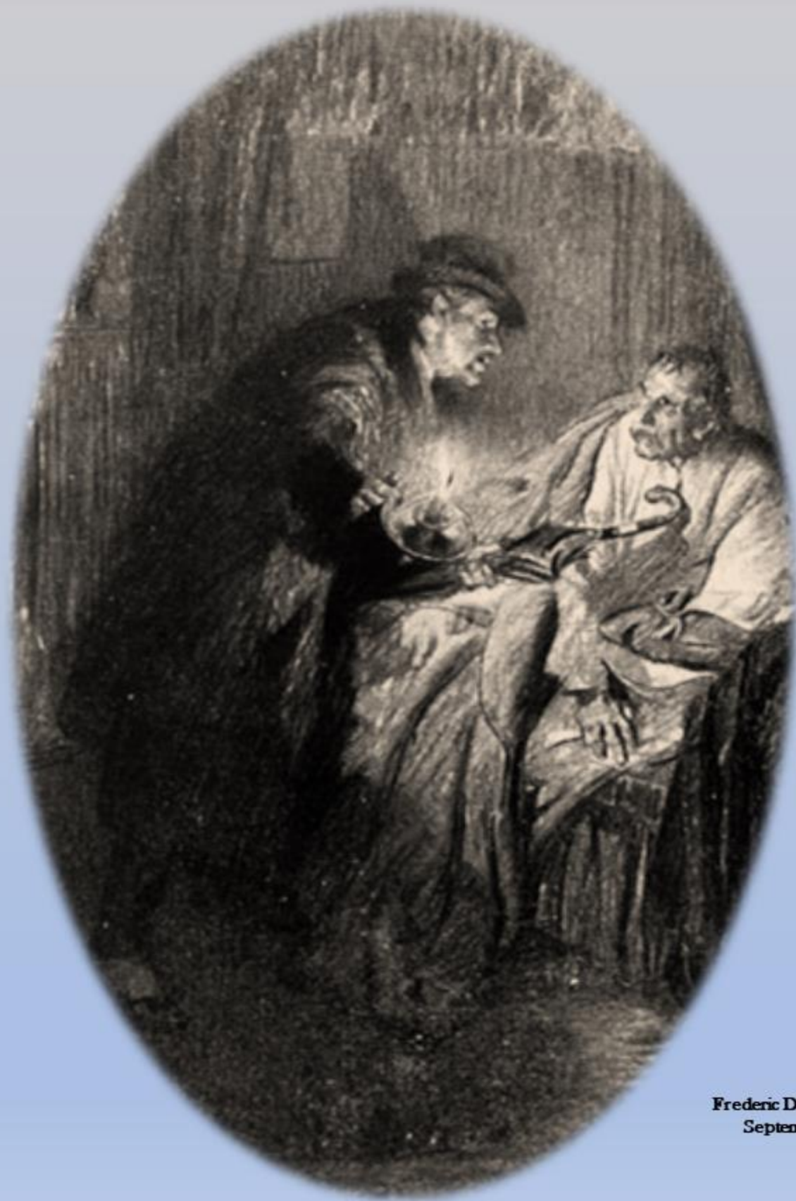
Frederic Dorr Steele, September, 1917