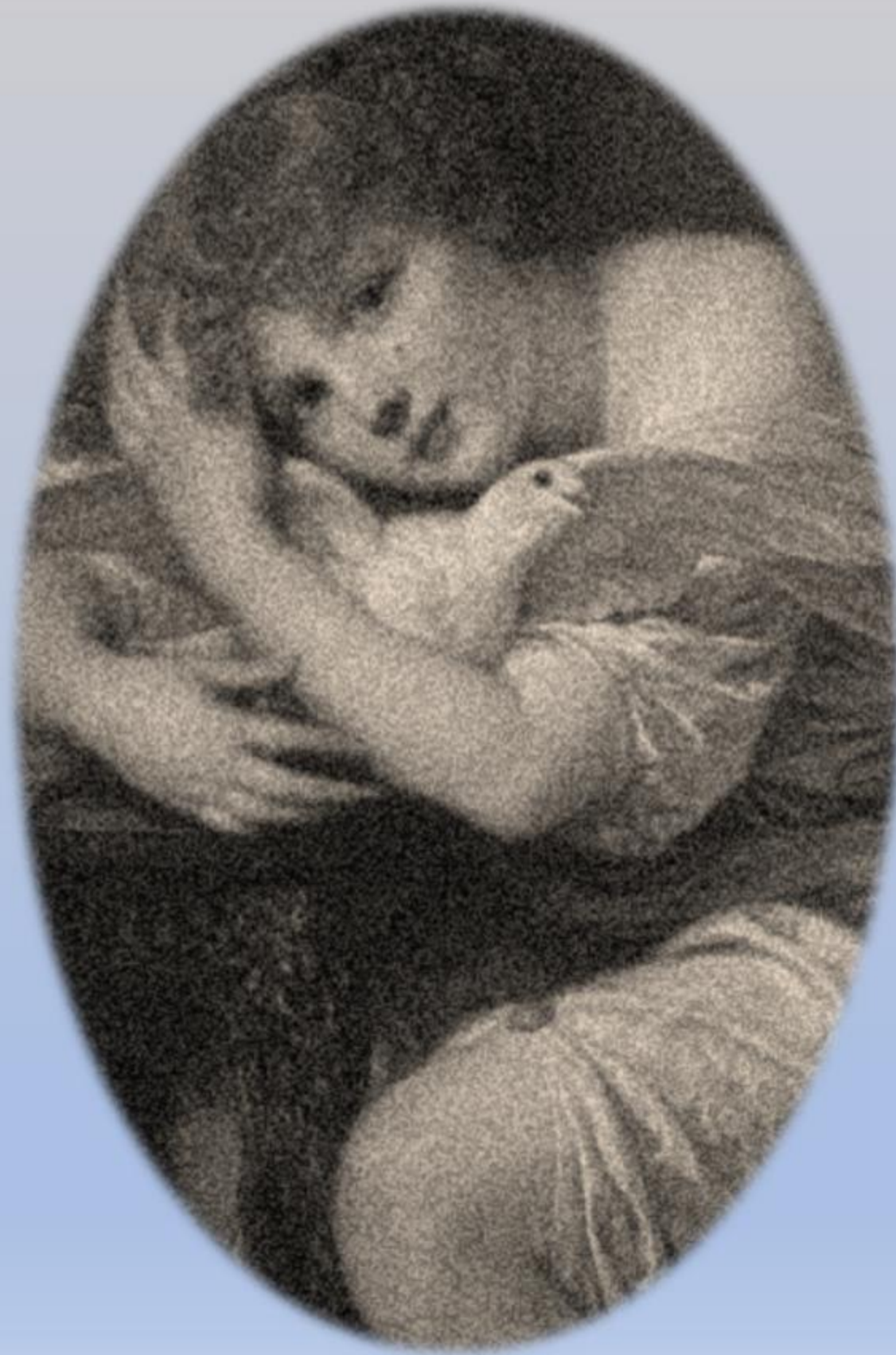
La Jeune Fille A'legneau