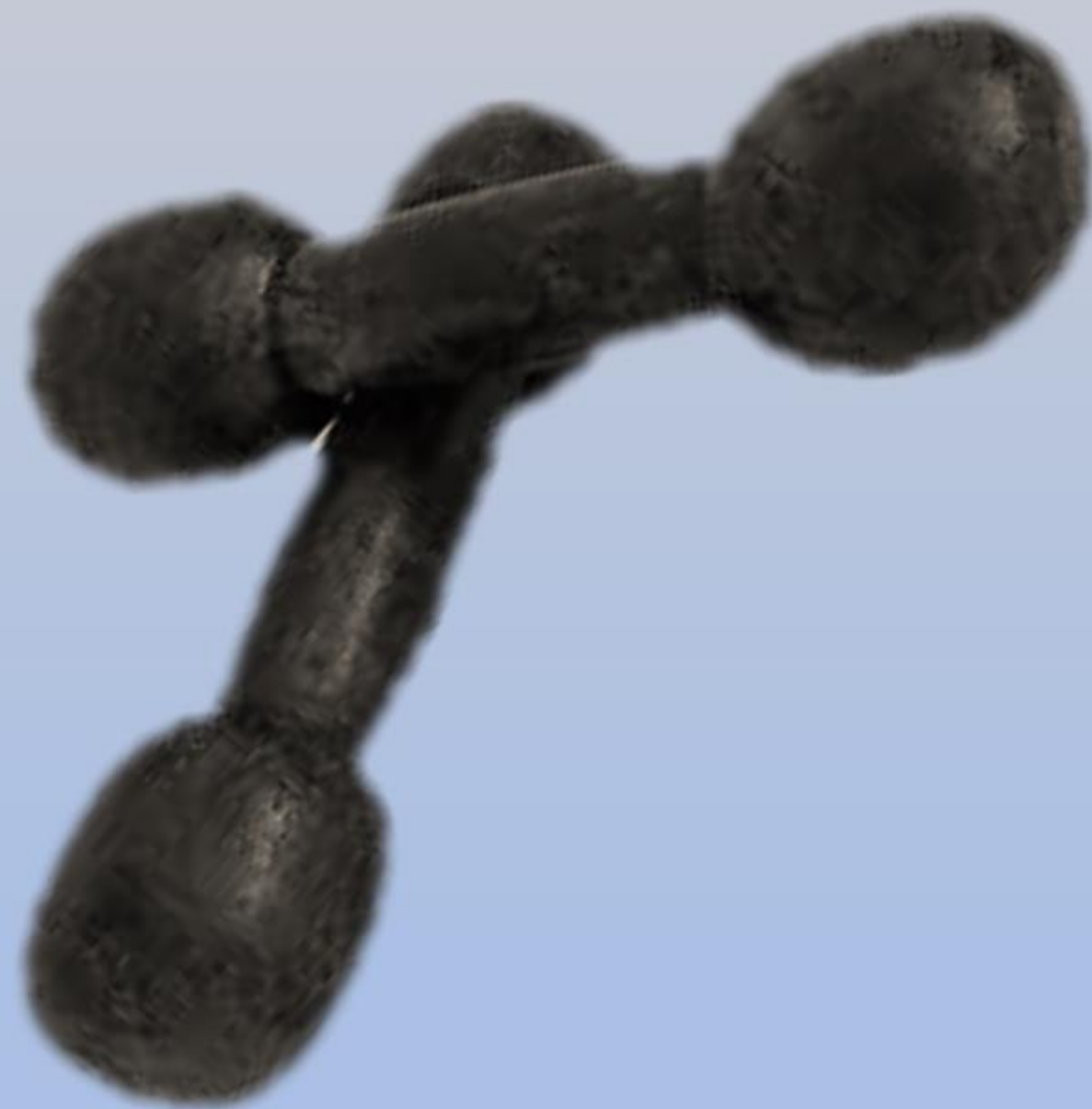
The Dumb Bell