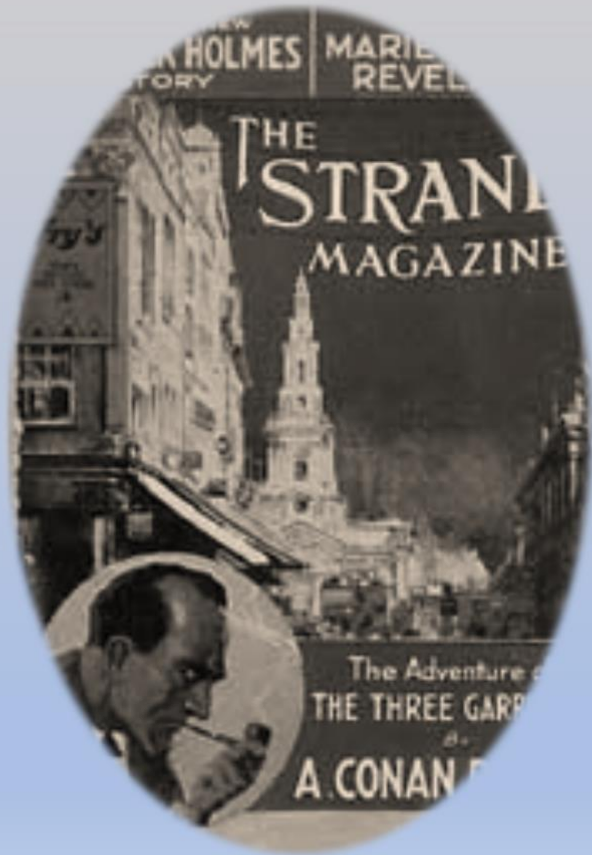
The Adventure of the Three Garridebs