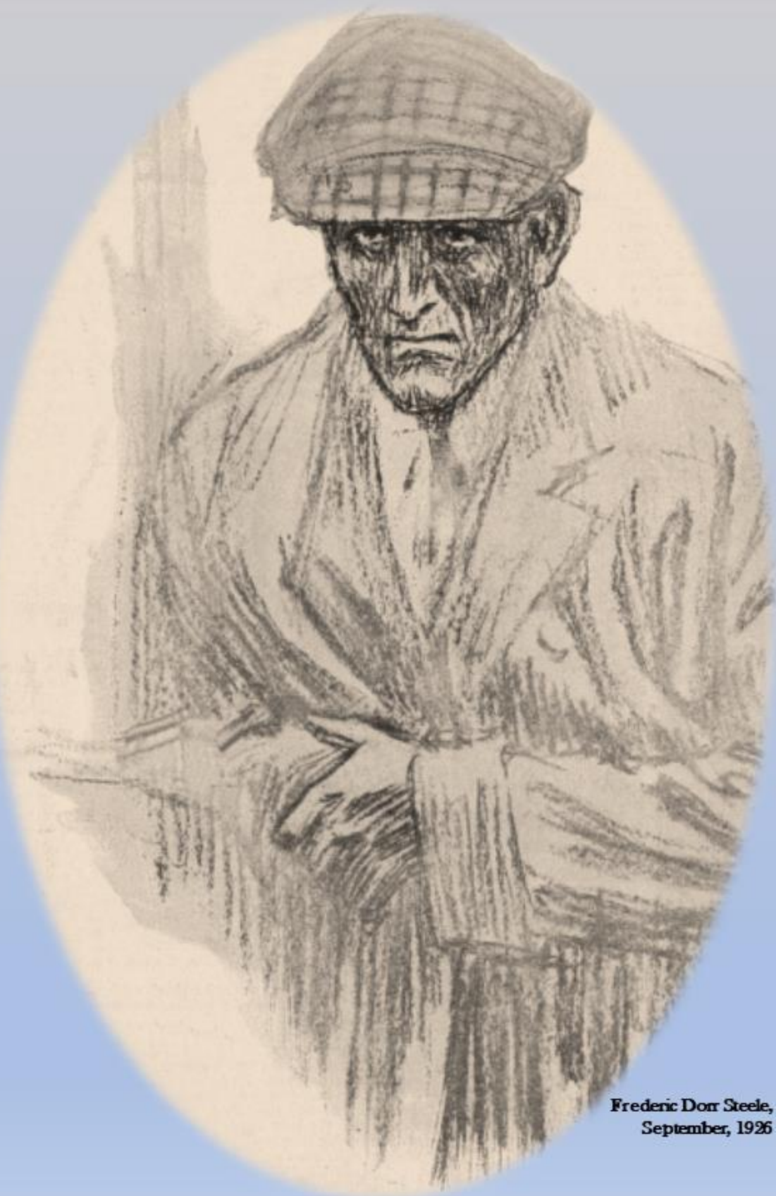
Frederic Dorr Steele, September, 1926