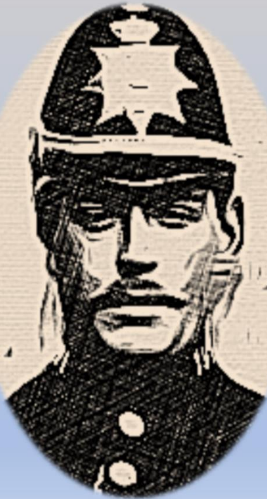
Scotland Yard Inspector