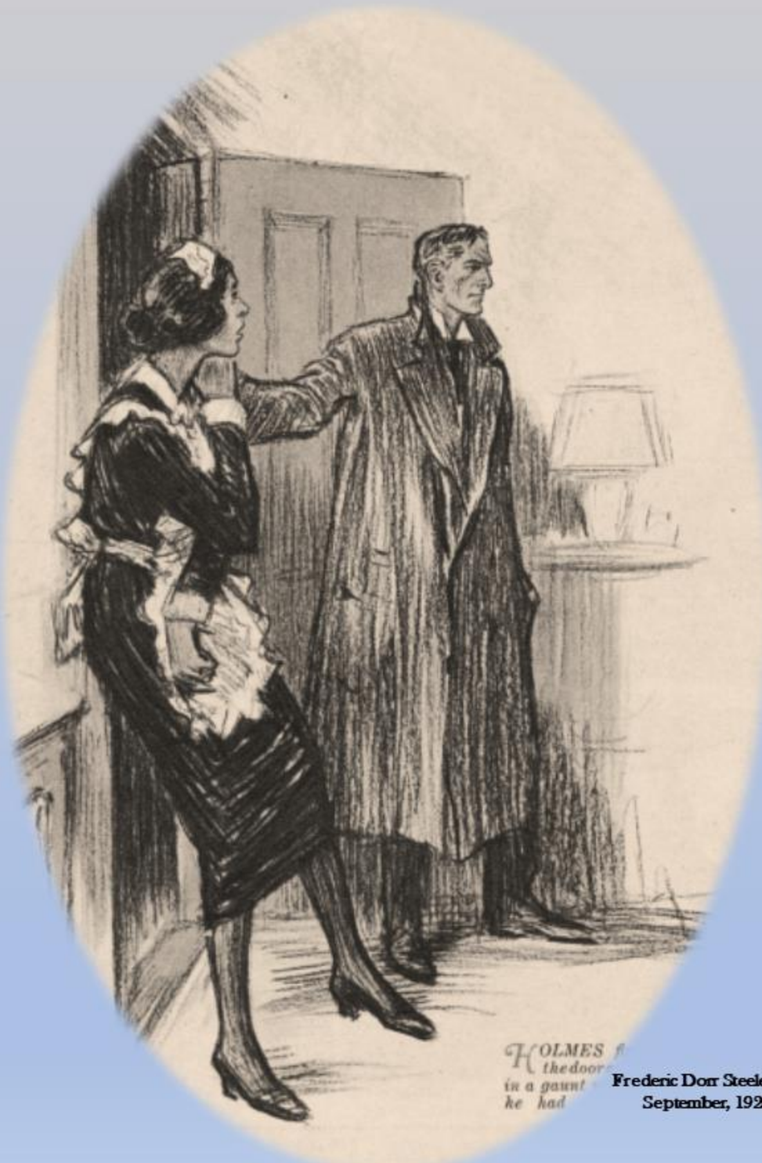
HOLMES the door in a gaunt he had Frederic Dorr Steele, September, 1926