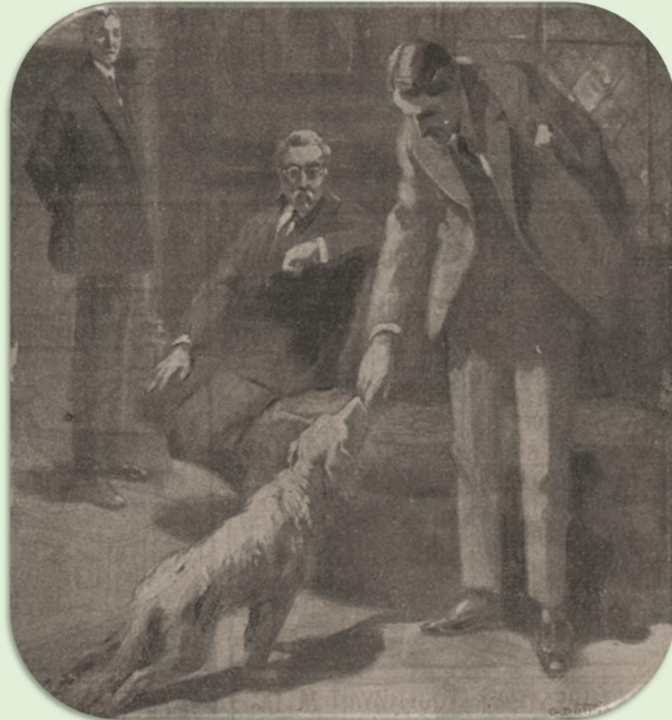
The Sussex Vampire