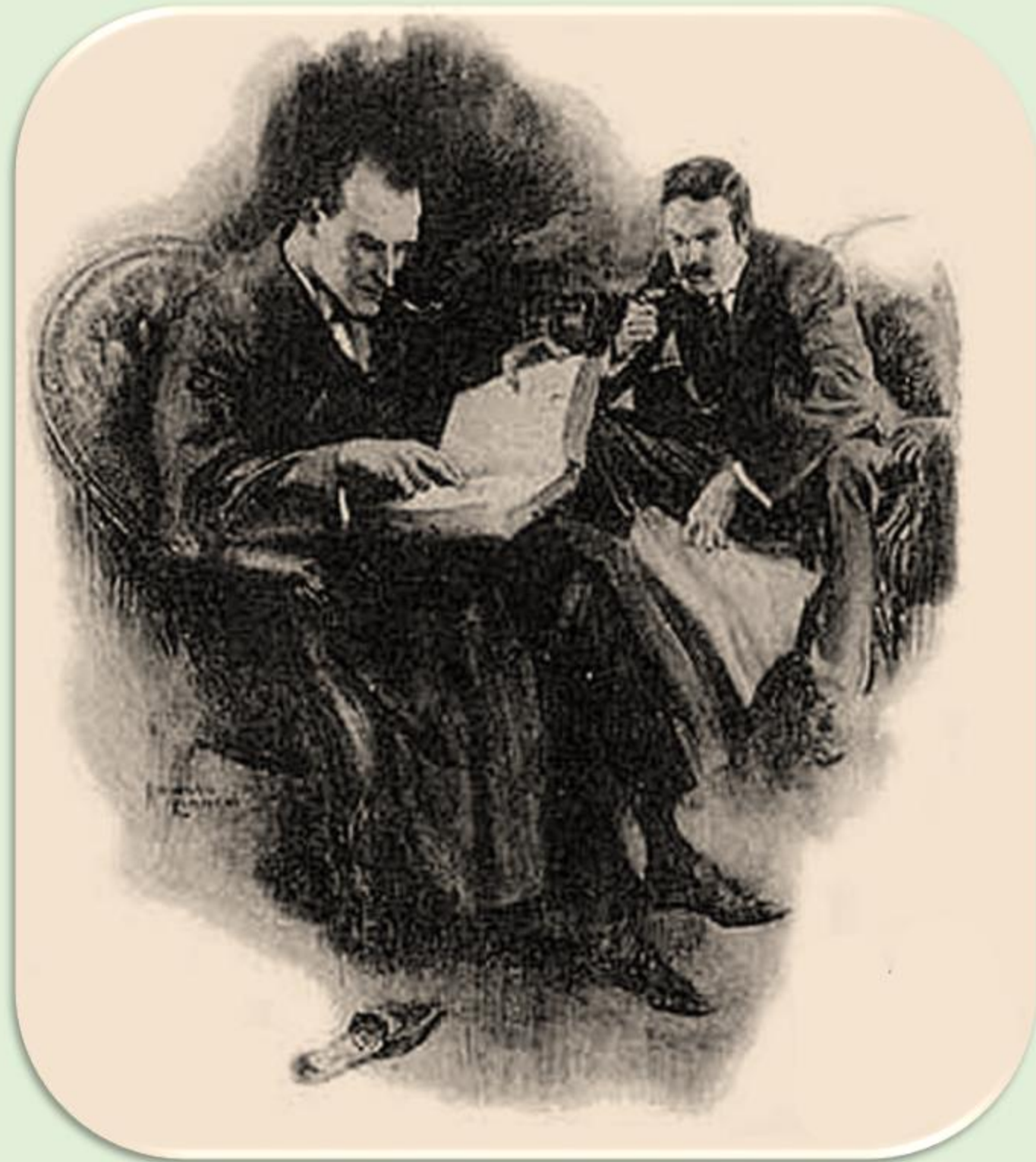
The Sussex Vampire