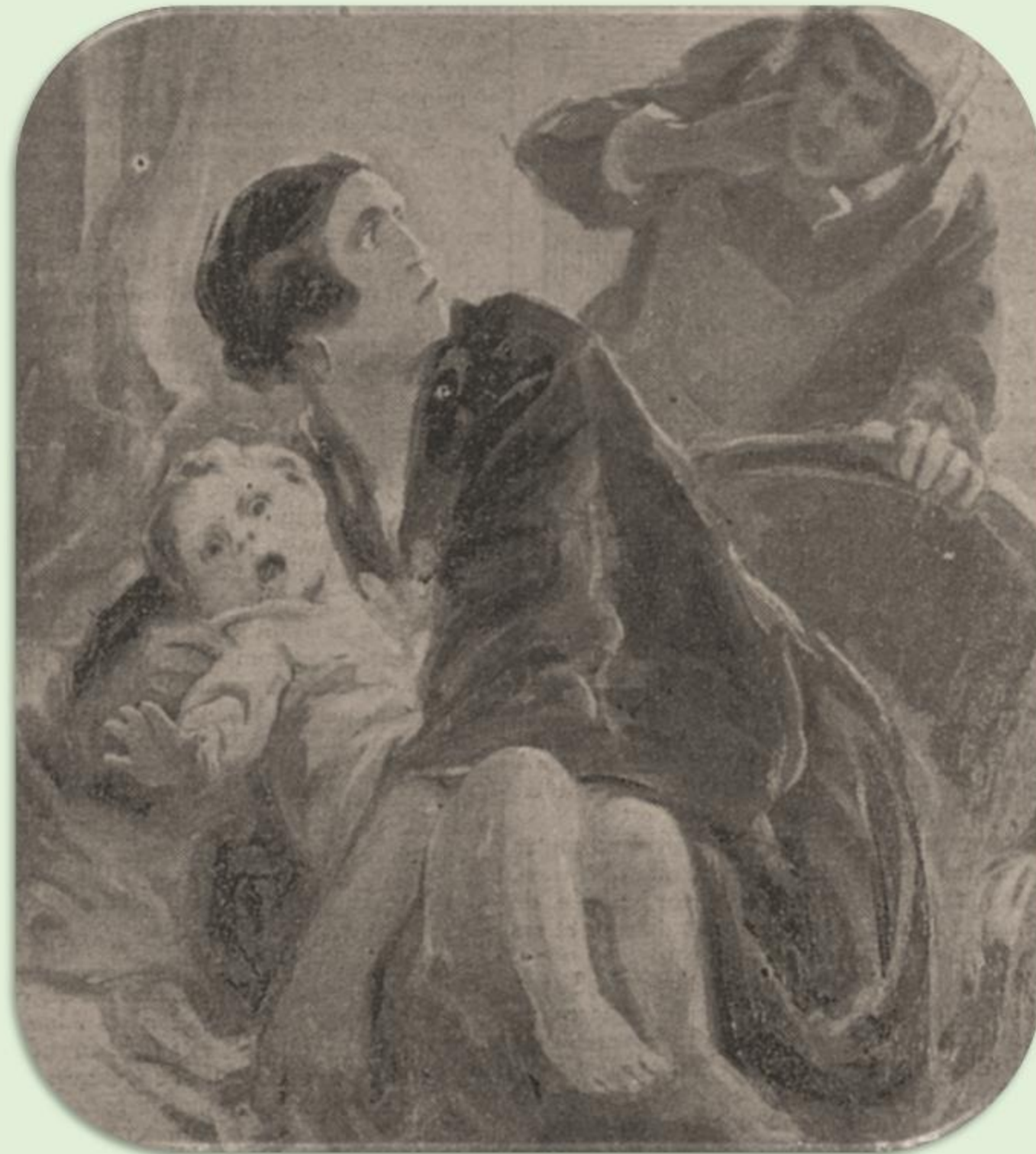
The Sussex Vampire