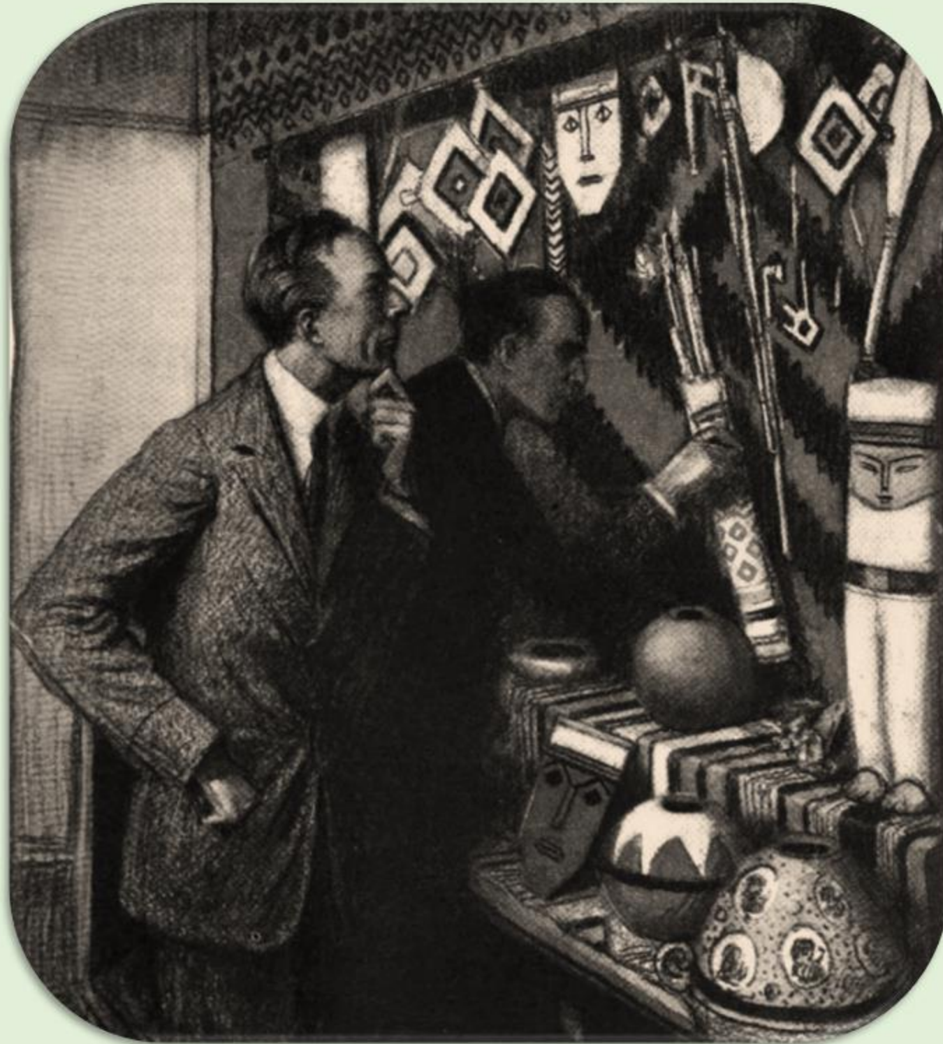
The Sussex Vampire