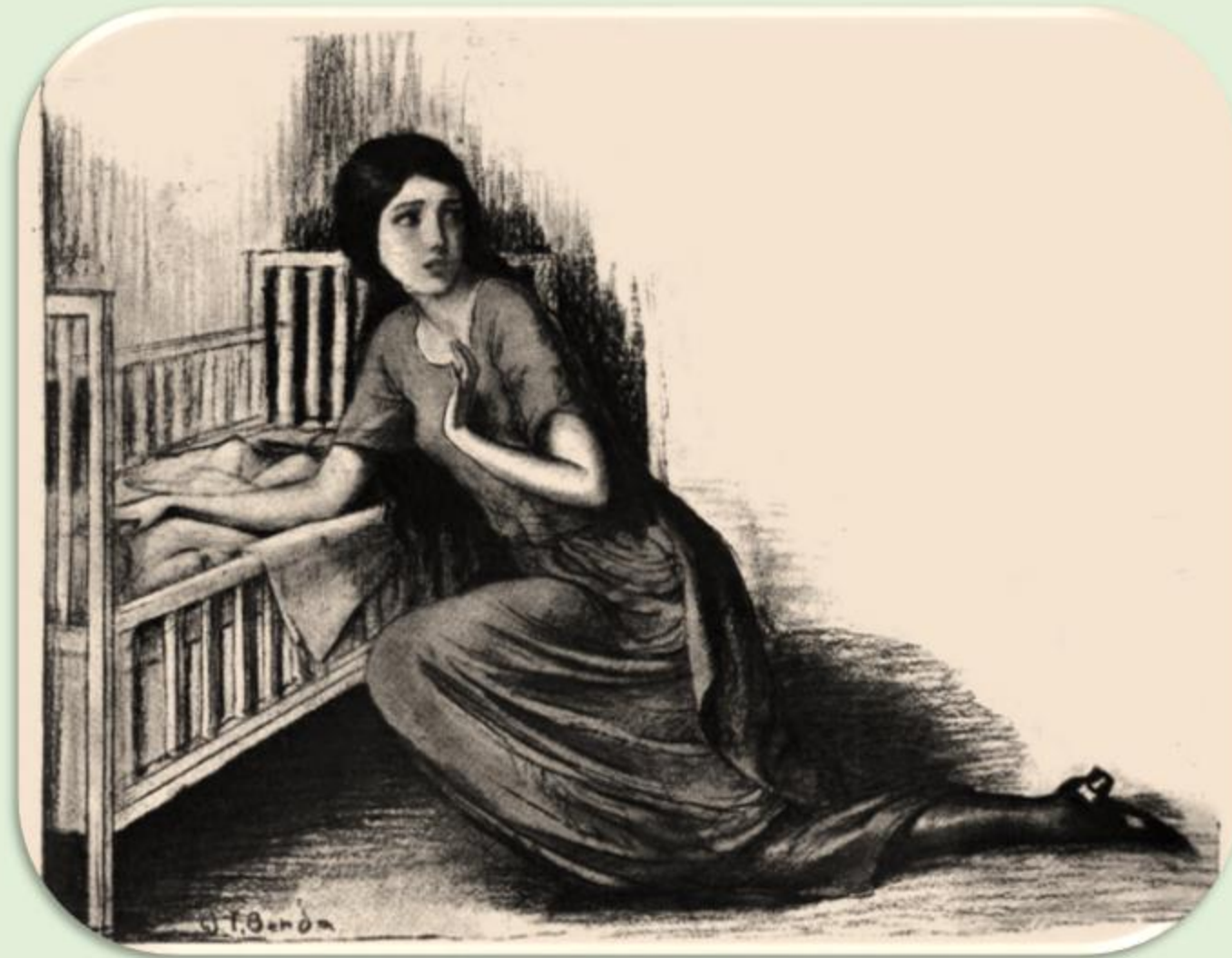
The Sussex Vampire