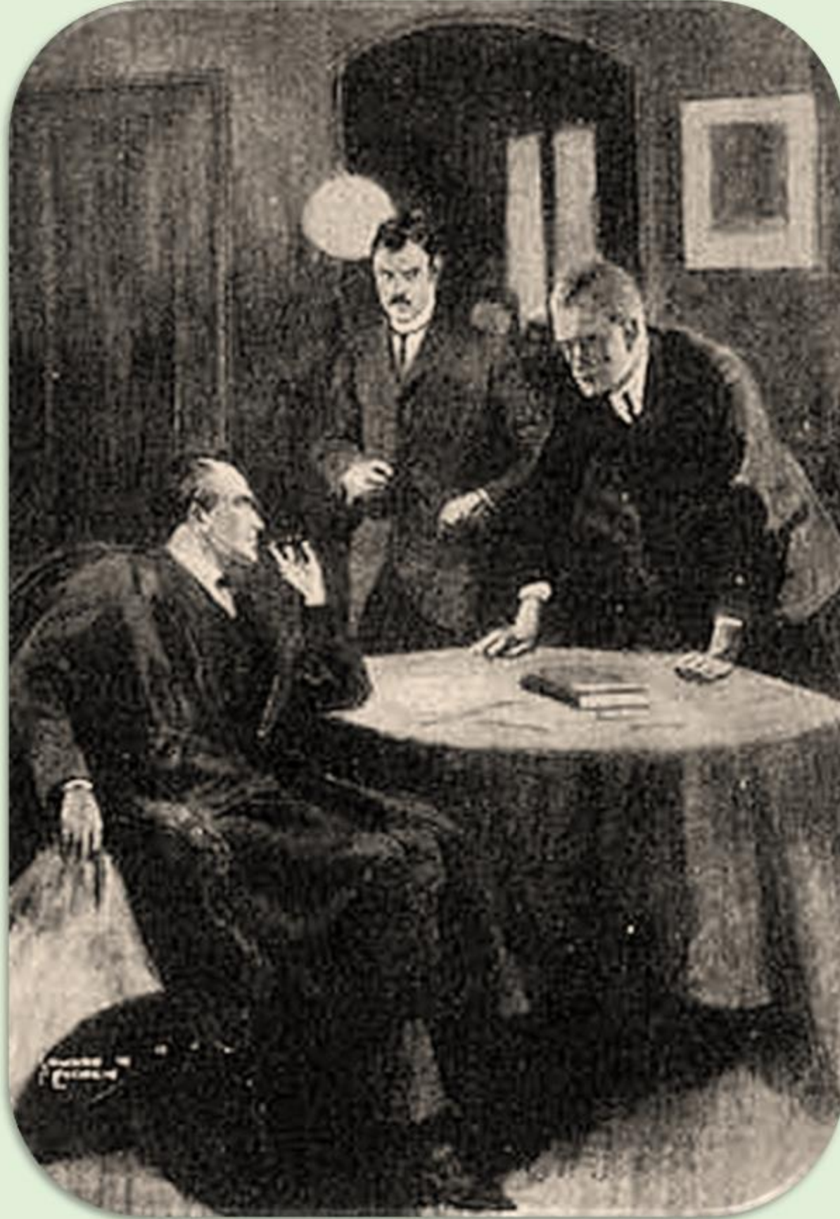
The Sussex Vampire