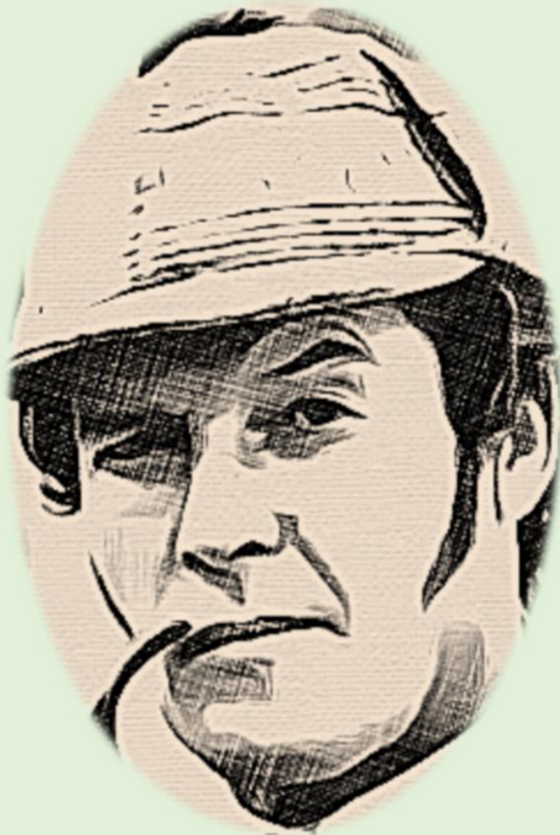
The Sussex Vampire