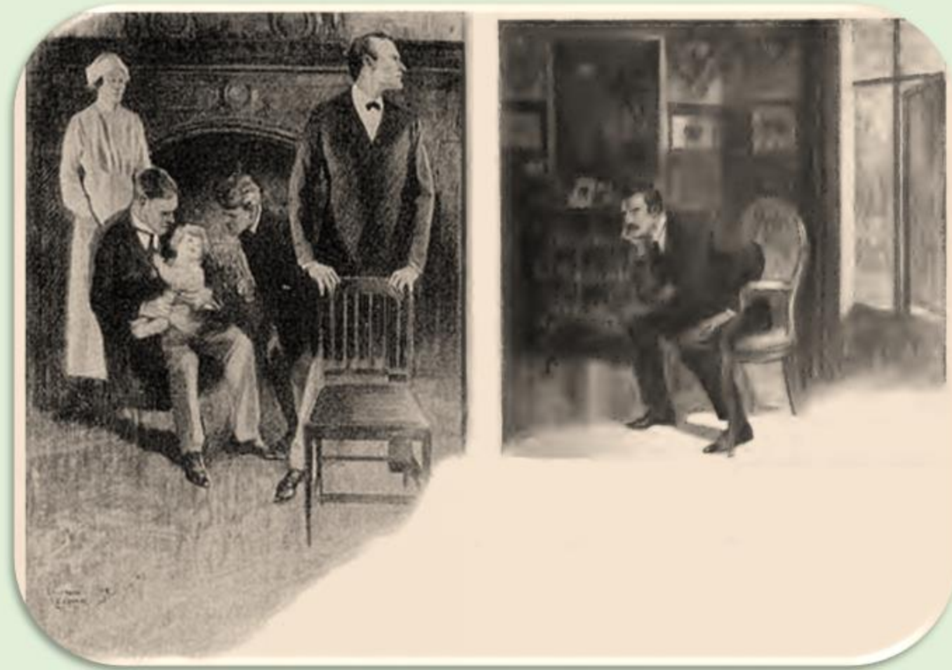
The Sussex Vampire