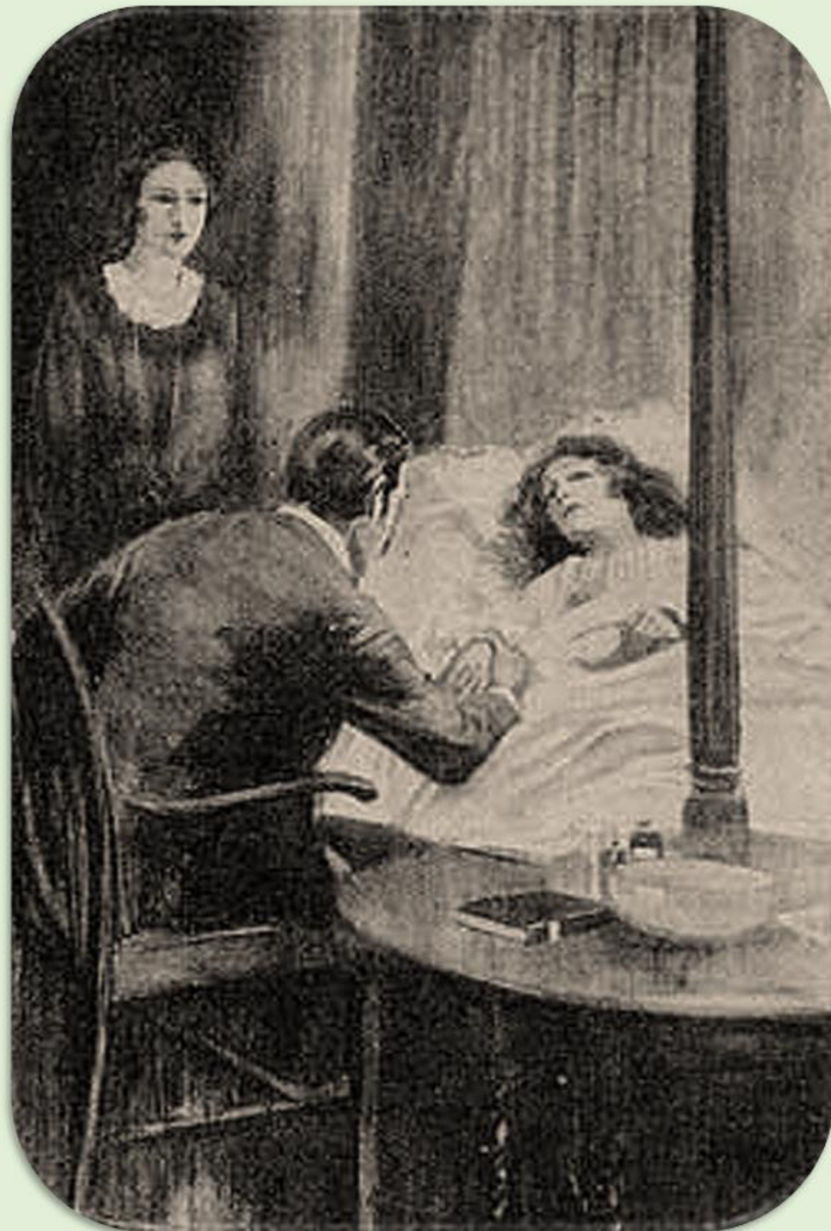
The Sussex Vampire