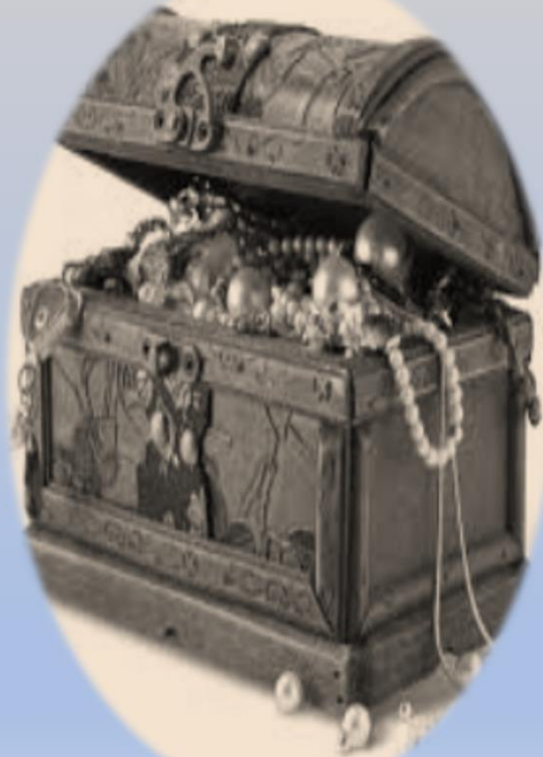
The Agra Treasure