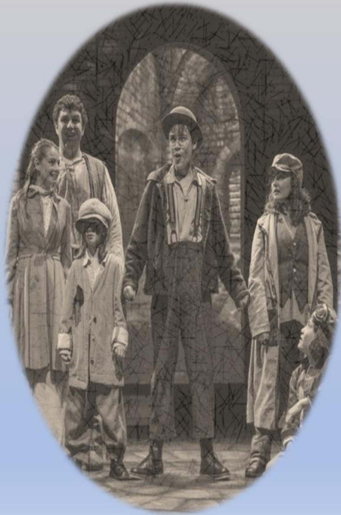
Baker Street Irregulars