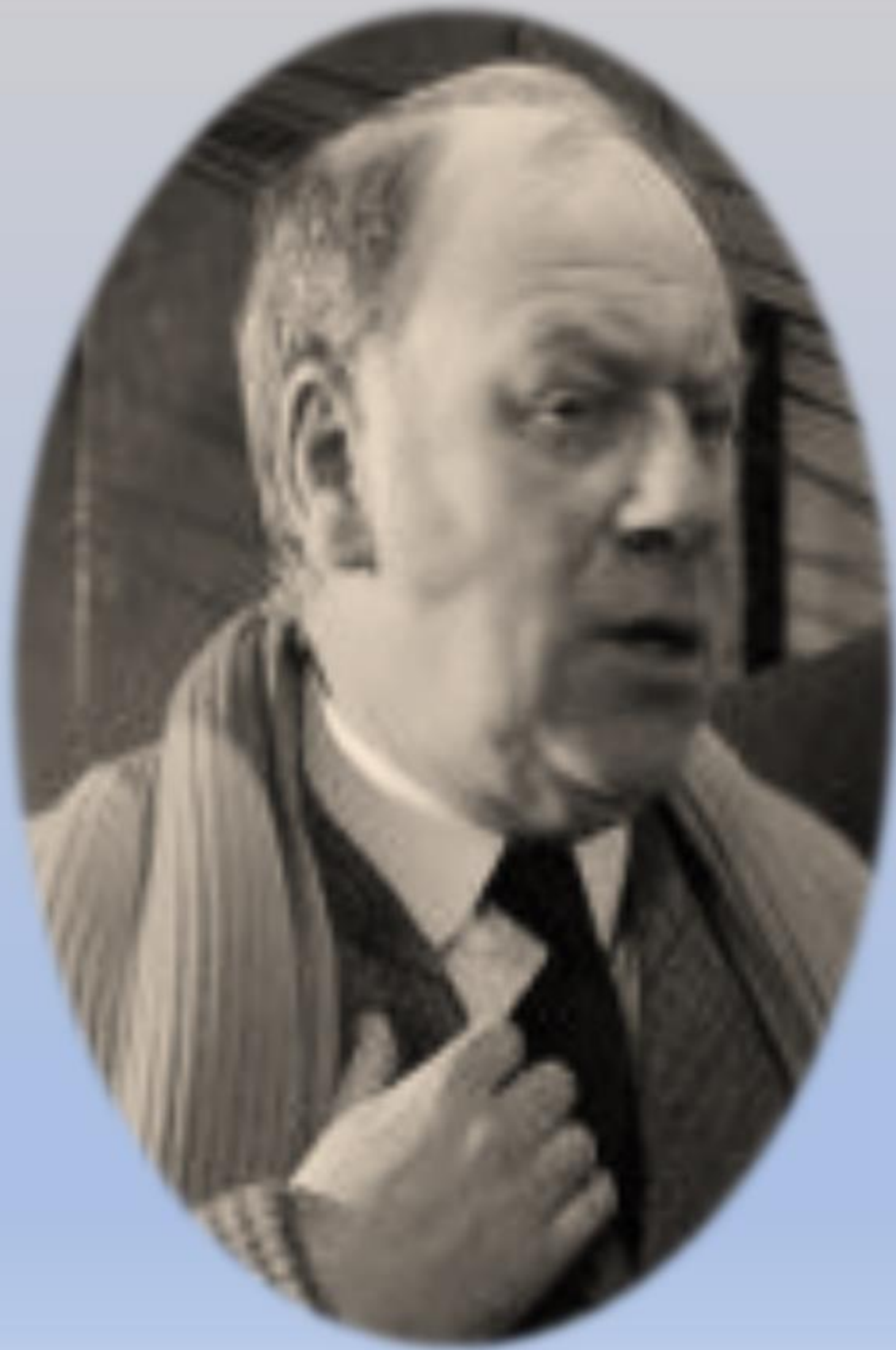
Captain Arthur Morstan