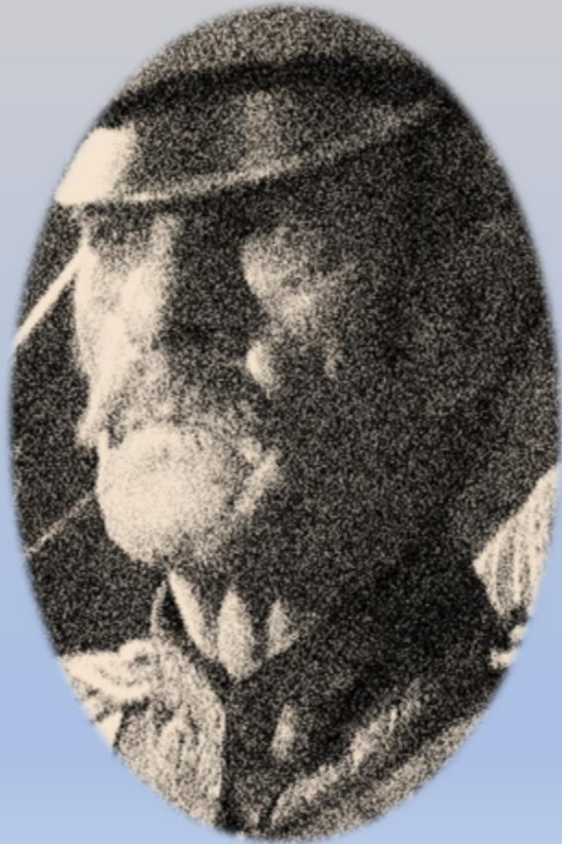
Major John Sholto