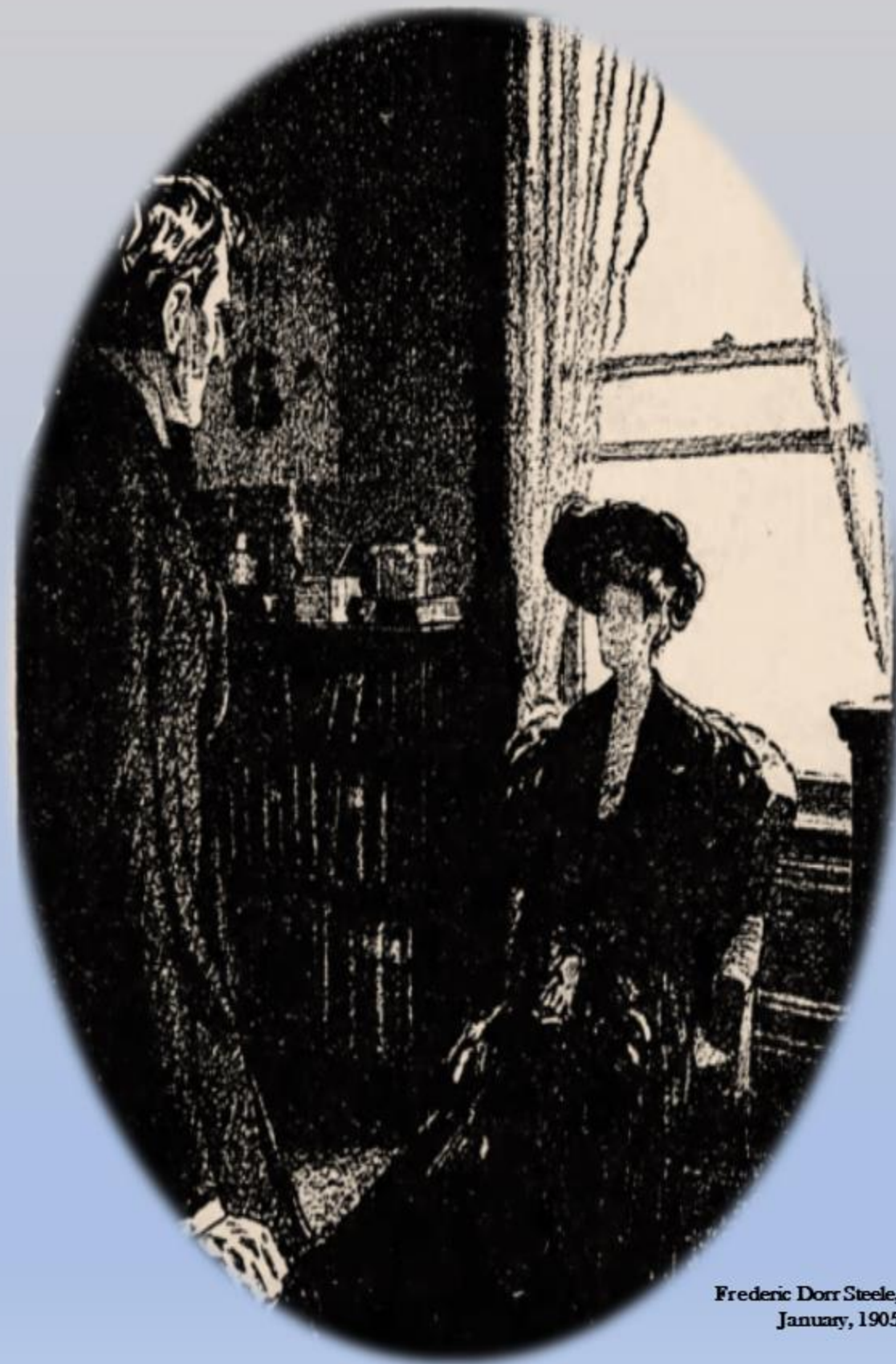
Frederic Dorr Steele, January, 1905