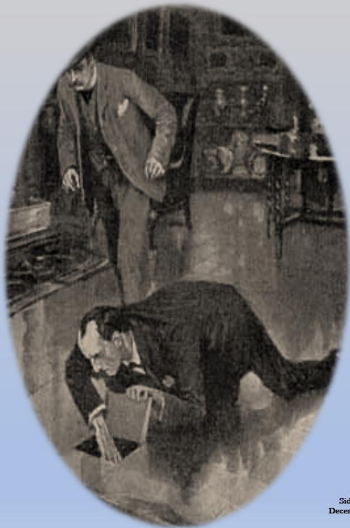
Sidney Paget, December, 1904