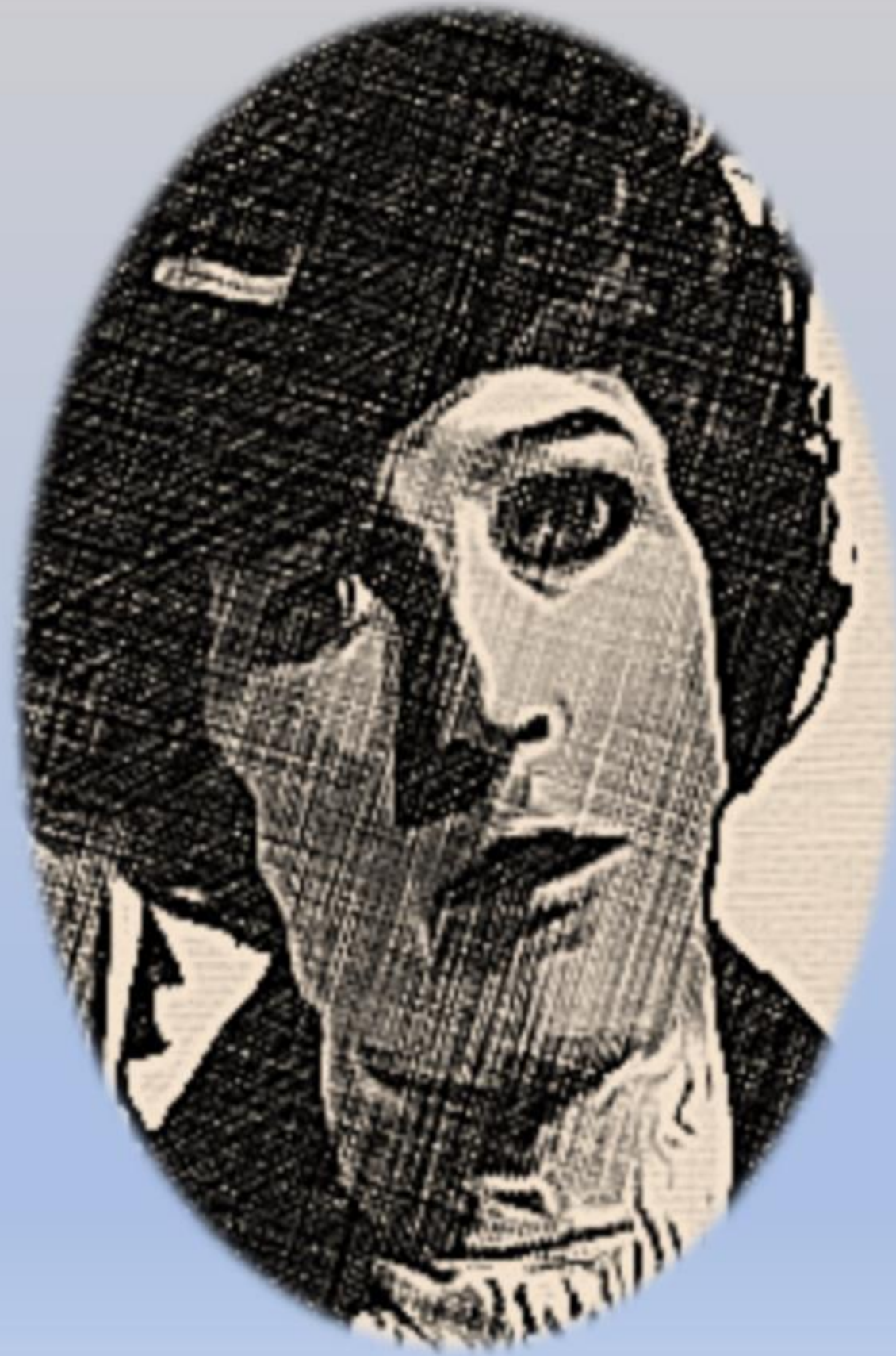
Lady Hilda Trelawney Hope