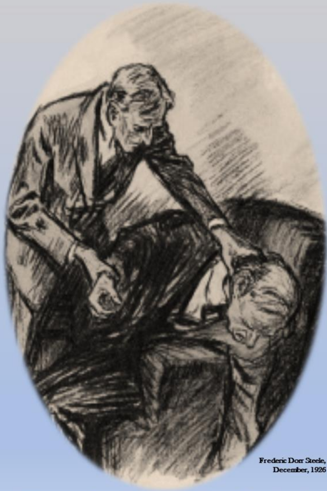
Frederic Dorr Steele, December, 1926