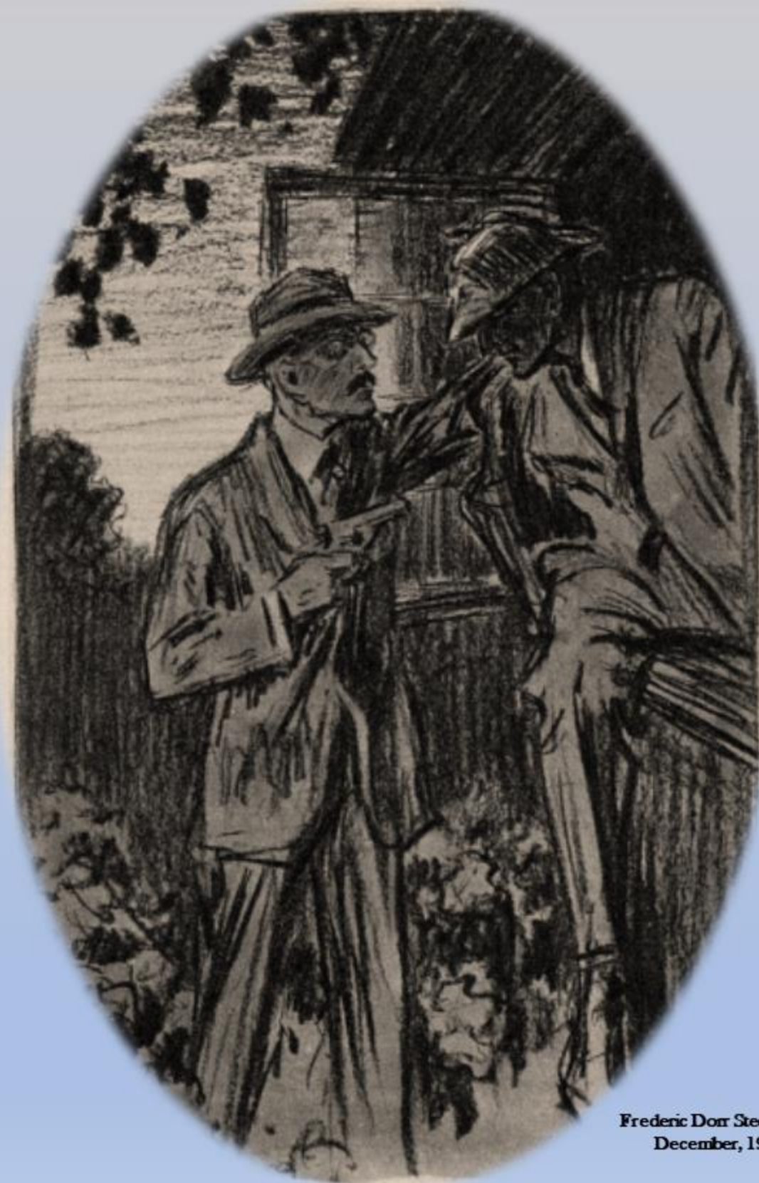
Frederic Dorr Steele, December, 1926