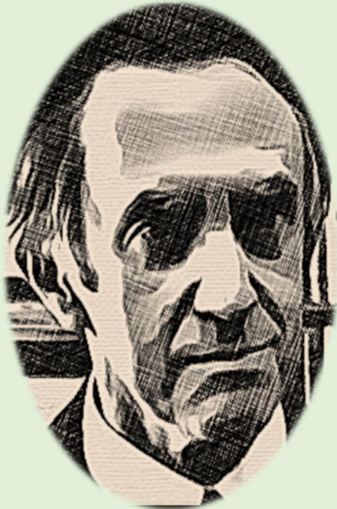
The Retired Colourman