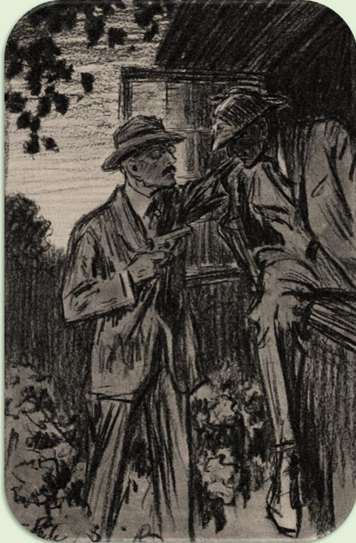
The Retired Colourman