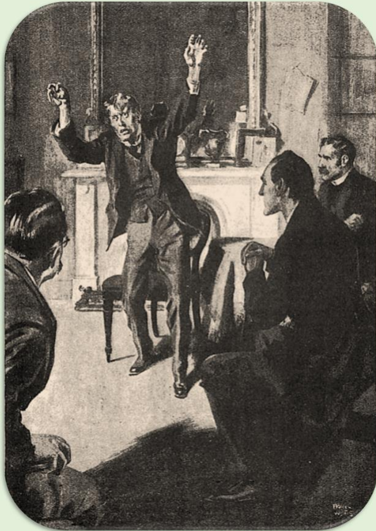
The Retired Colourman