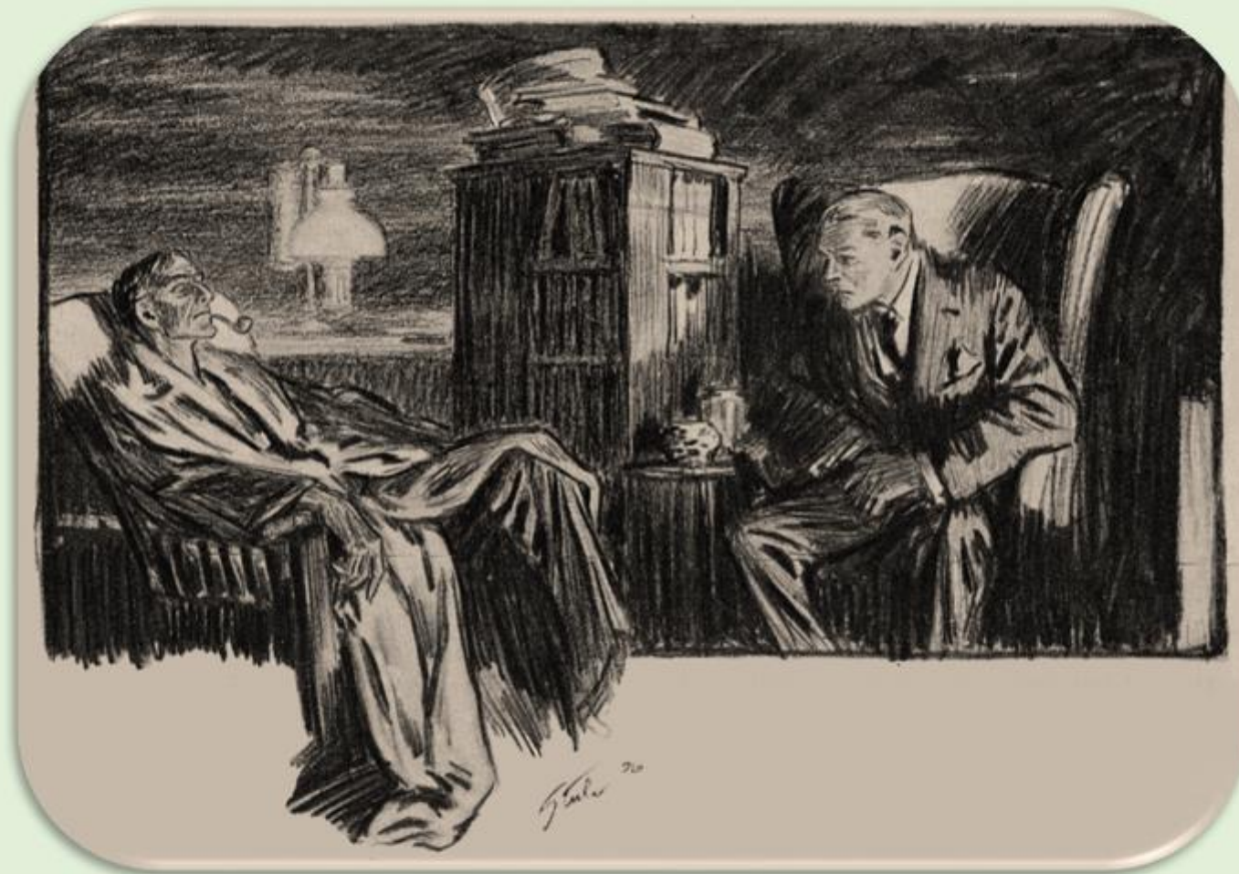
The Retired Colourman