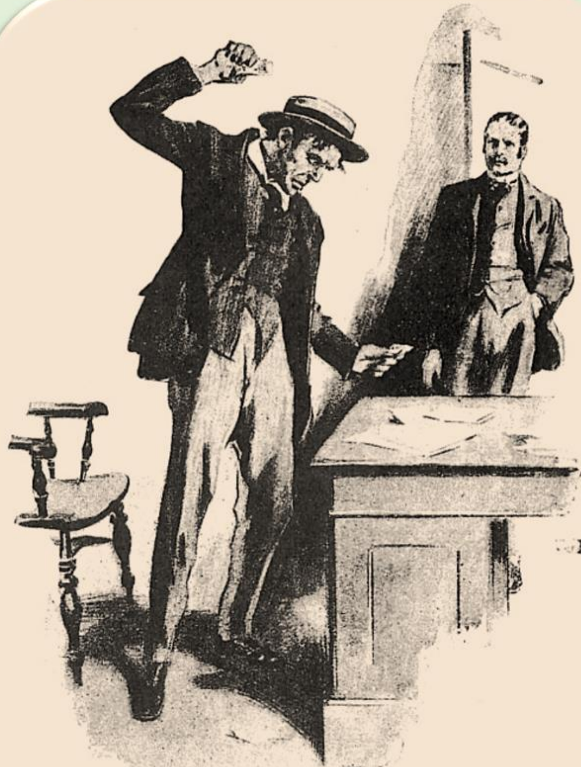
The Retired Colourman