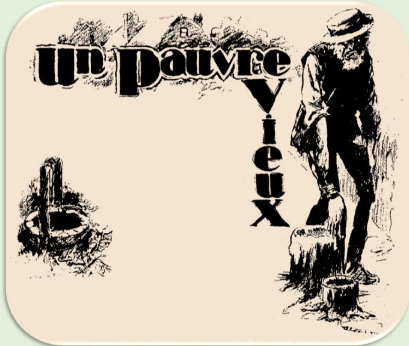
The Retired Colourman