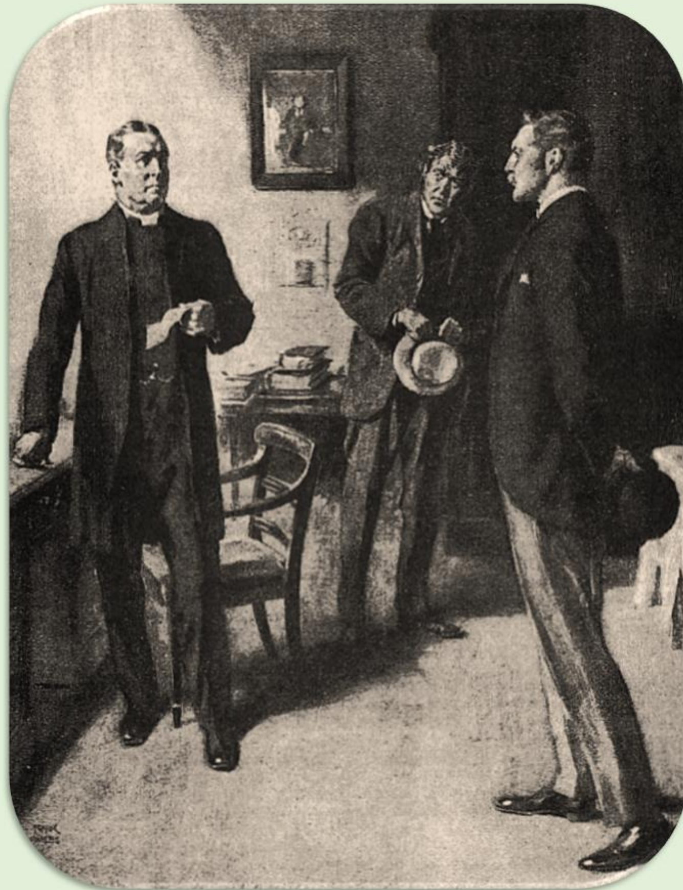
The Retired Colourman