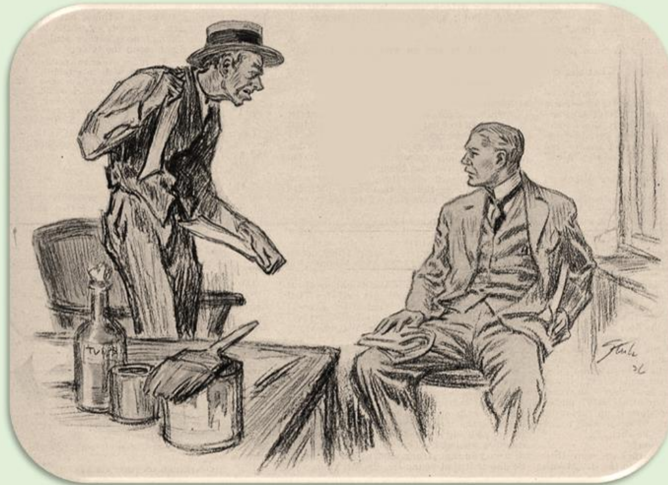
The Retired Colourman