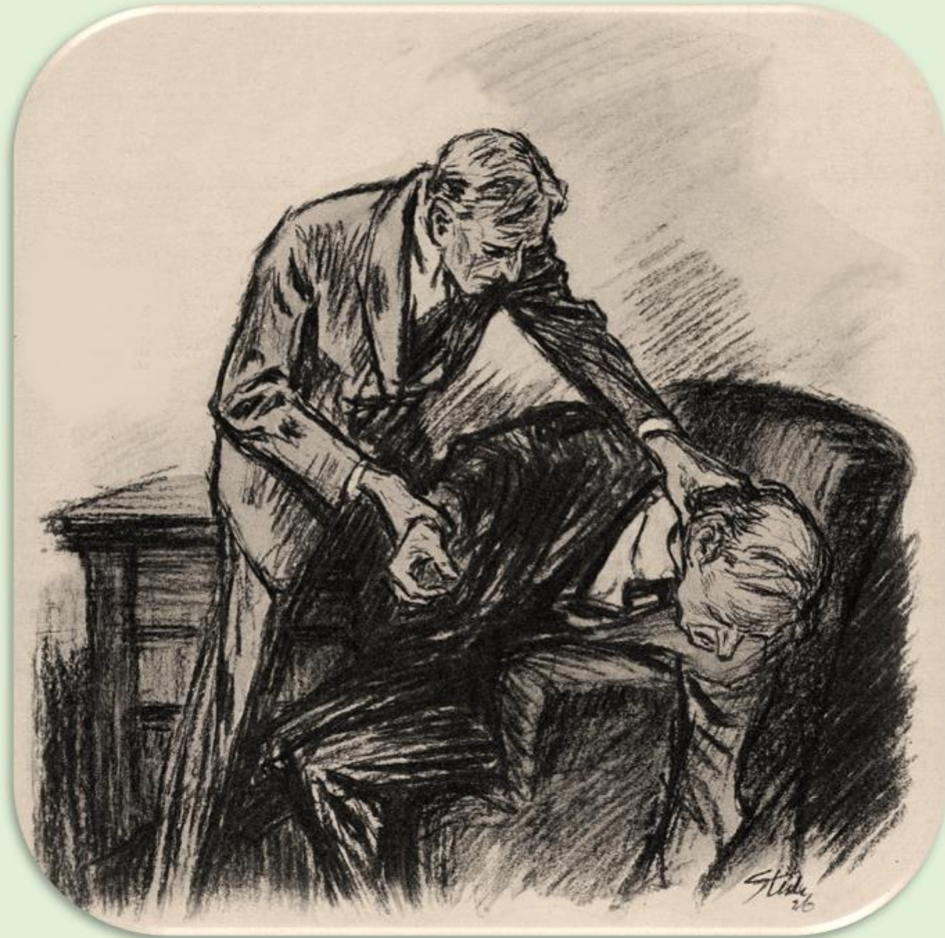
The Retired Colourman