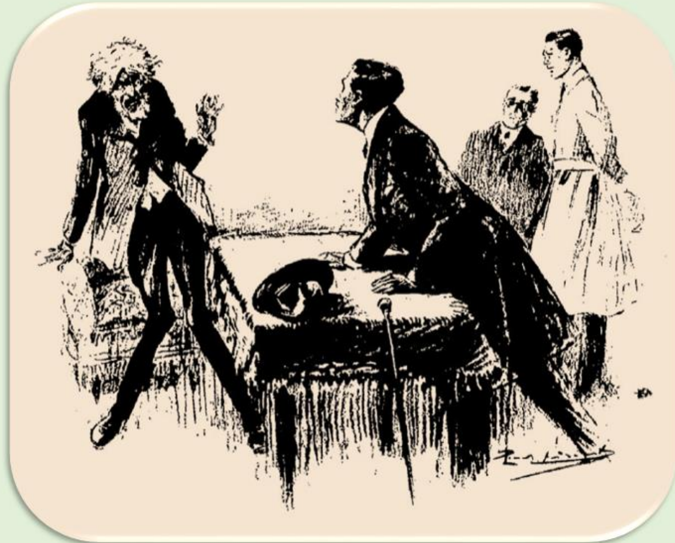
The Retired Colourman