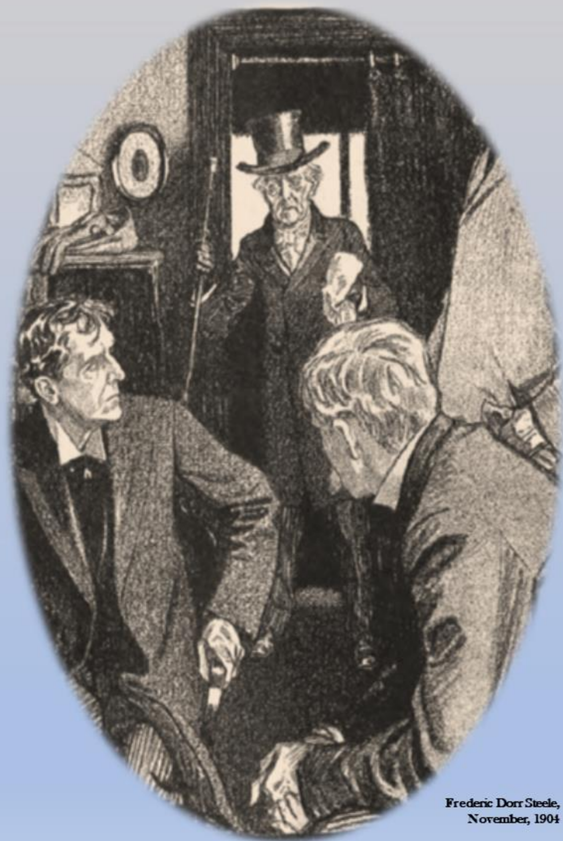
Frederic Dorr Steele, November, 1904