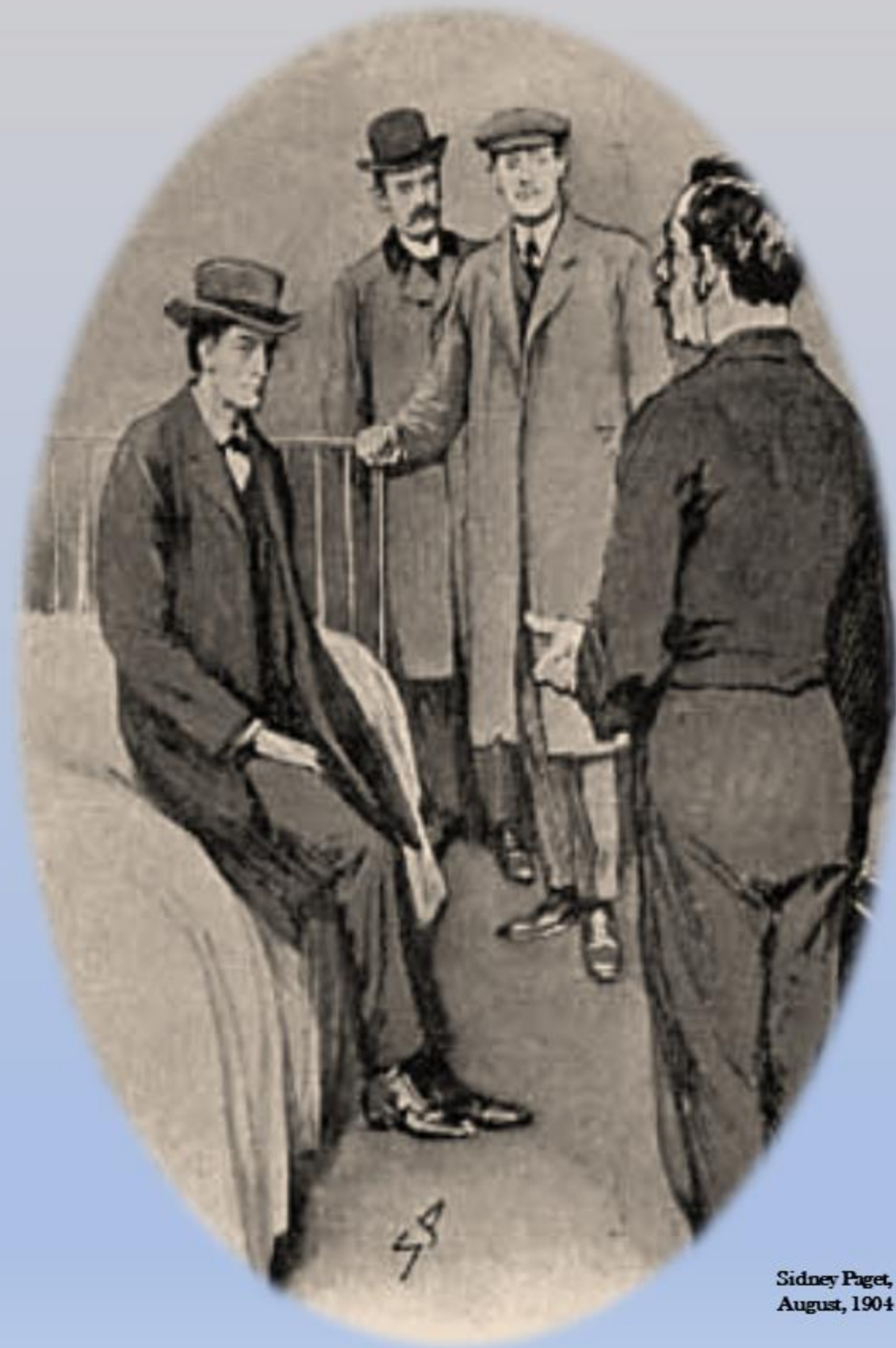
Sidney Paget, August, 1904