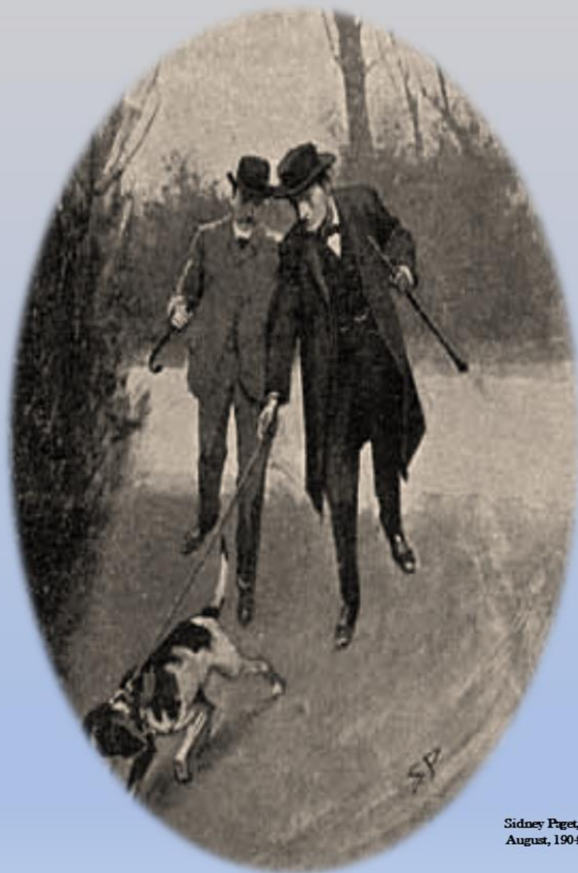
Sidney Paget, August, 1904