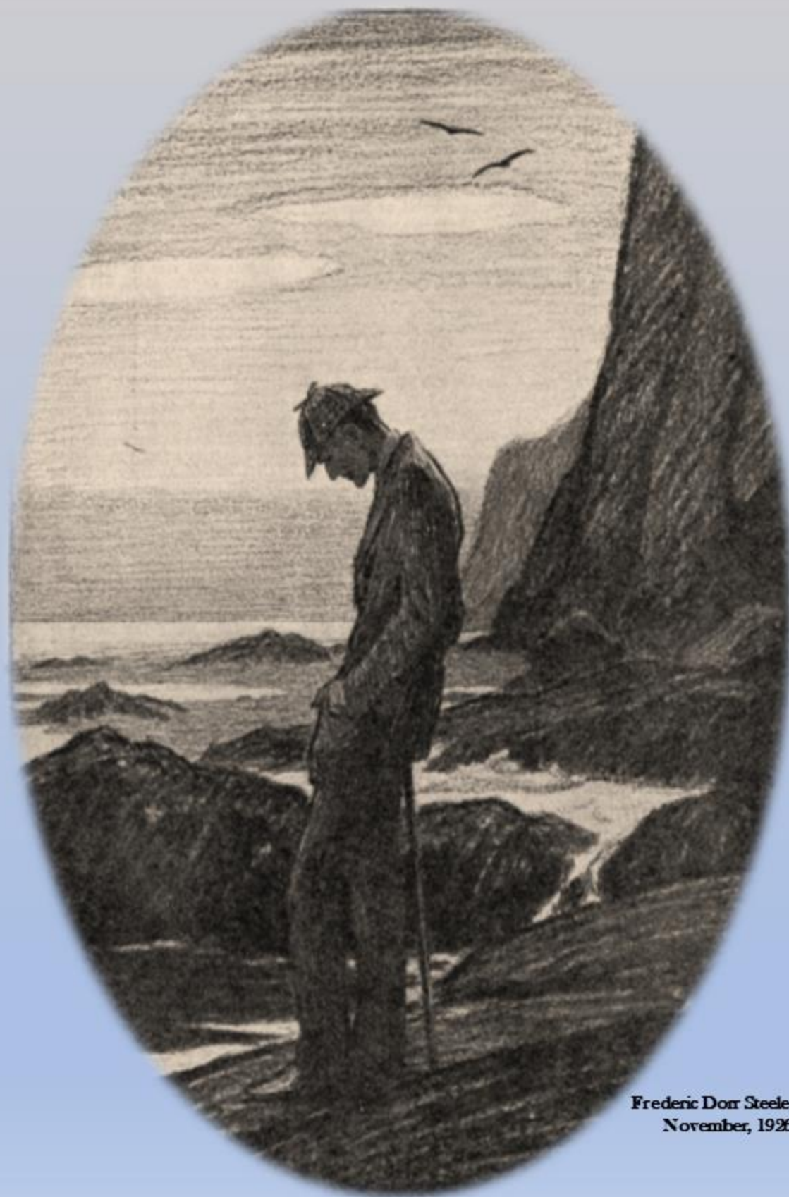
Frederic Dorr Steele, November, 1926