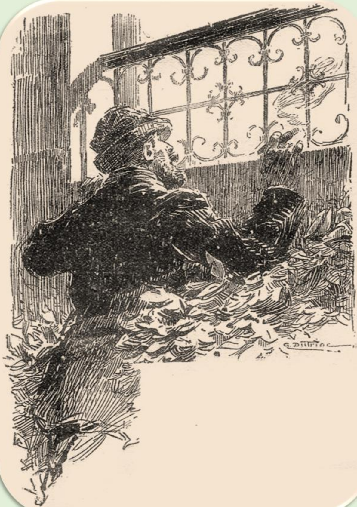
The Devil's Foot