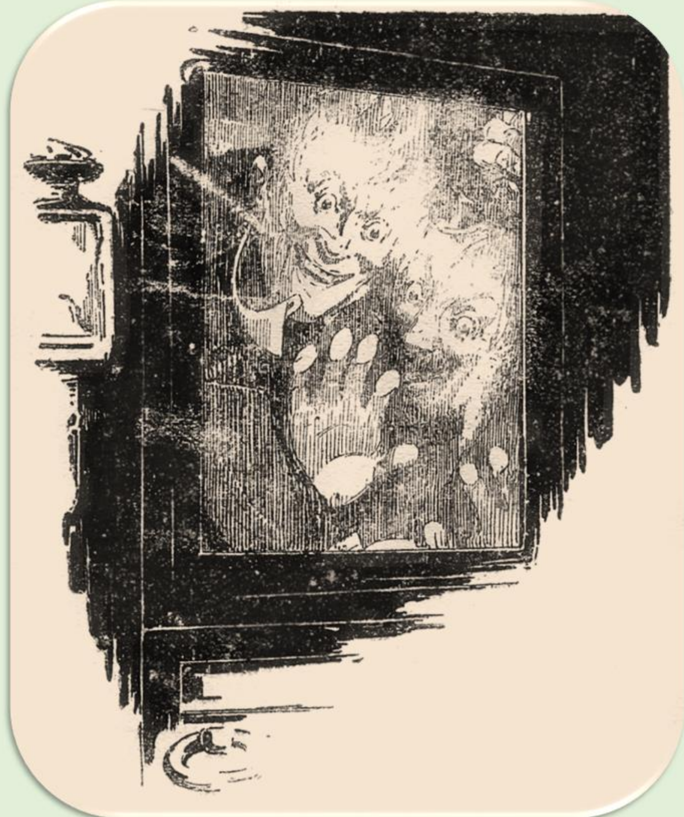
The Devil's Foot