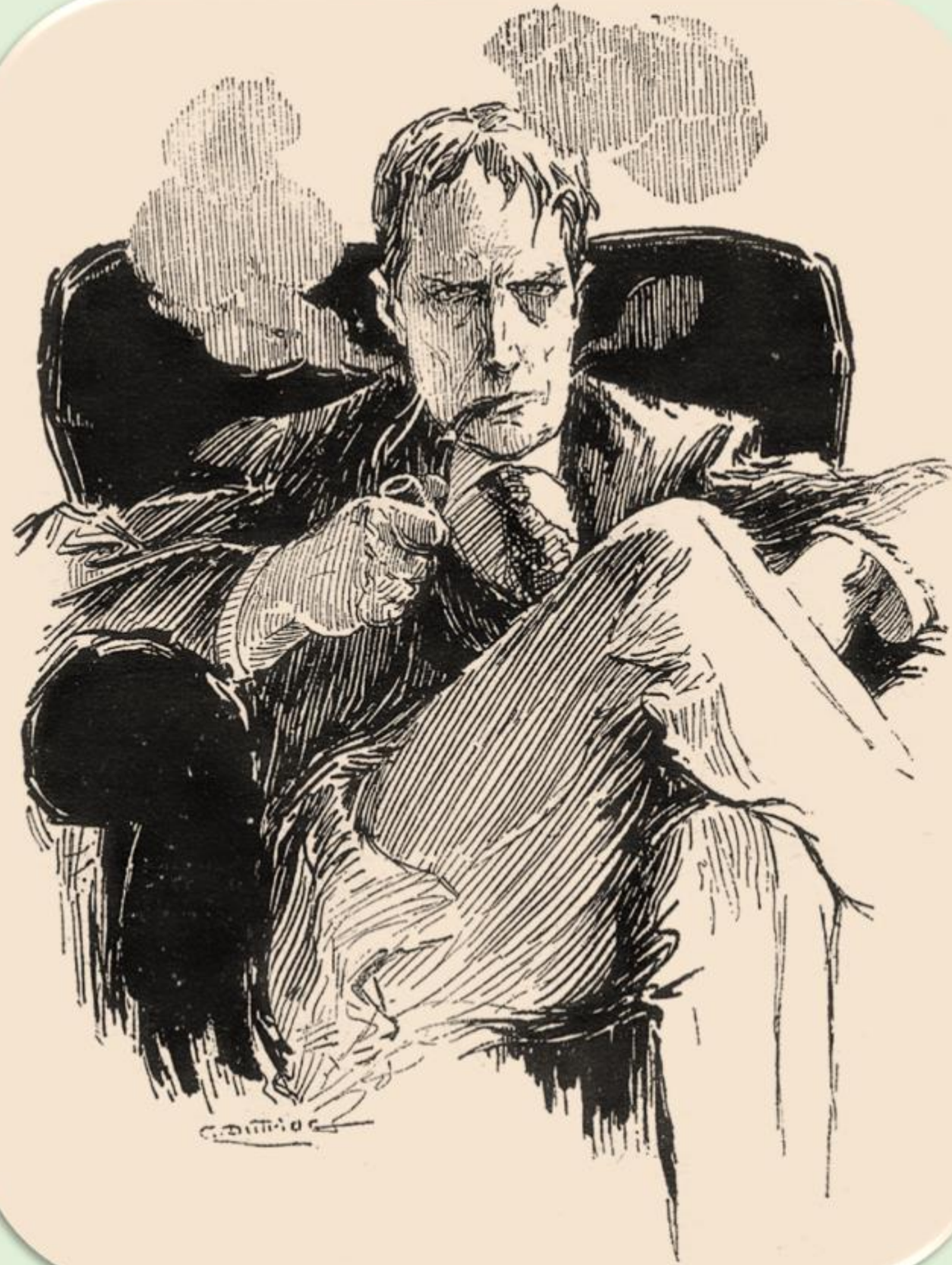
The Devil's Foot