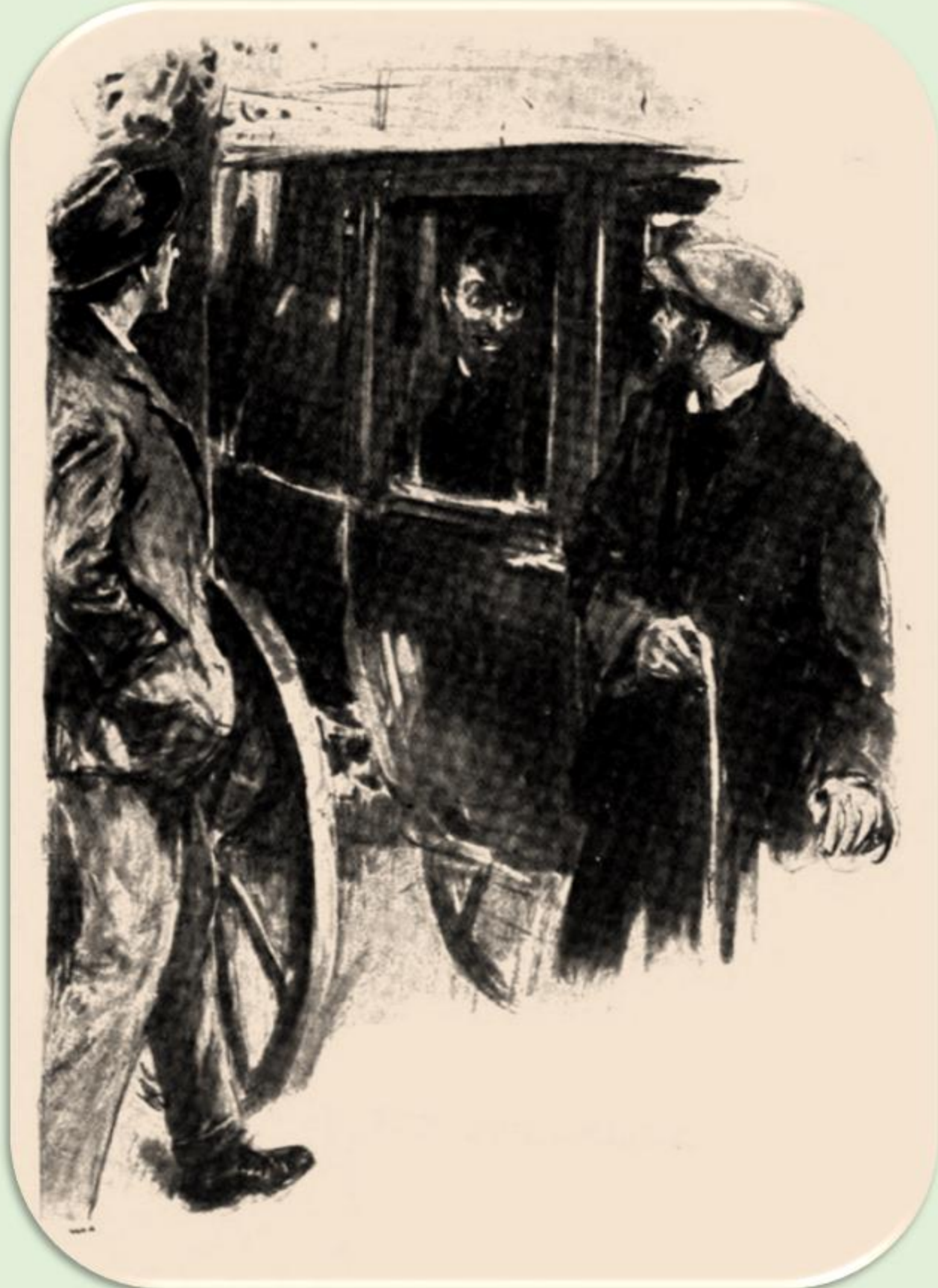
The Devil's Foot