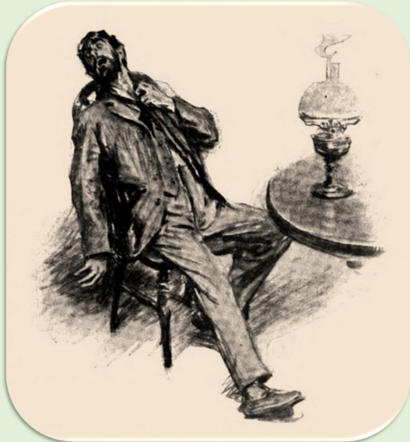
The Devil's Foot