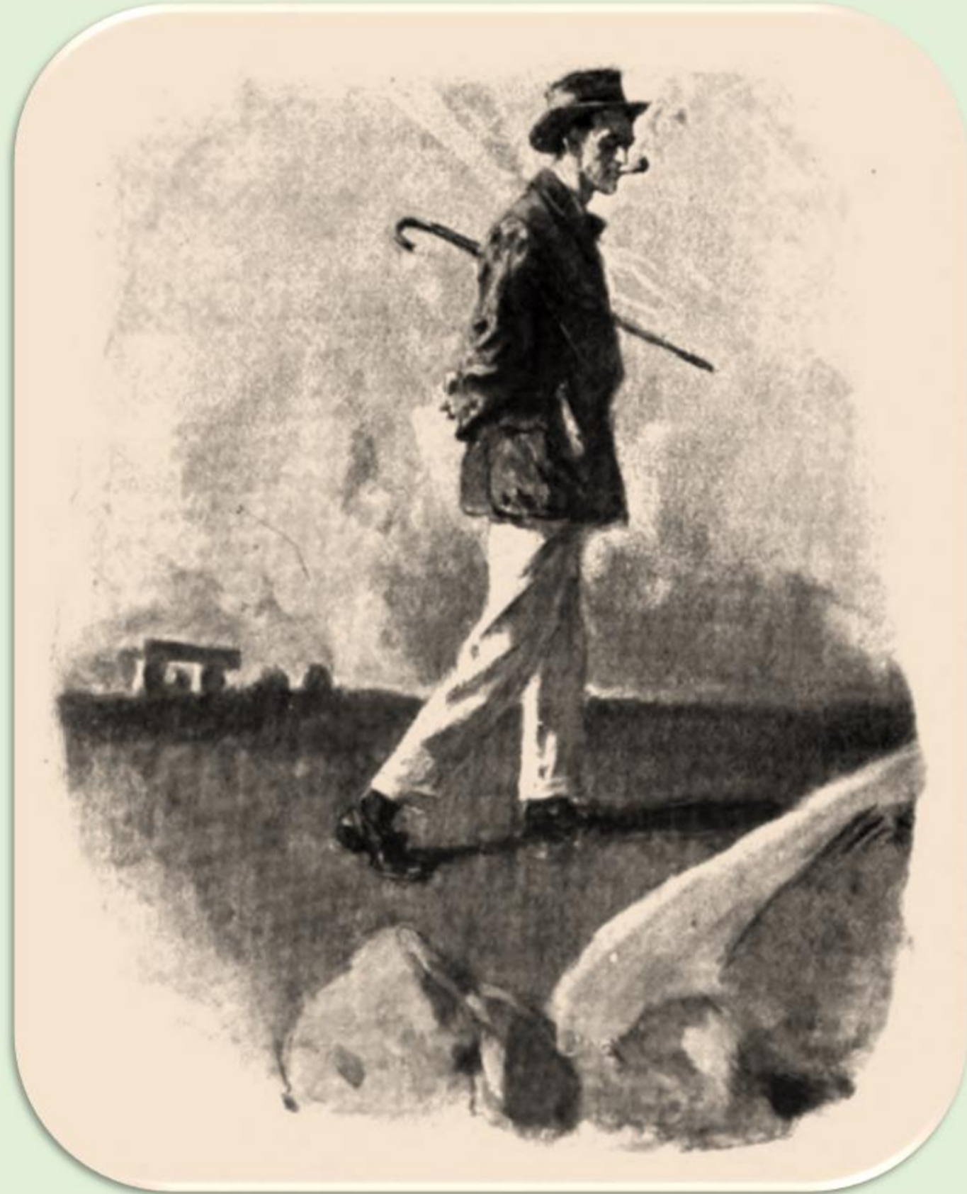
The Devil's Foot