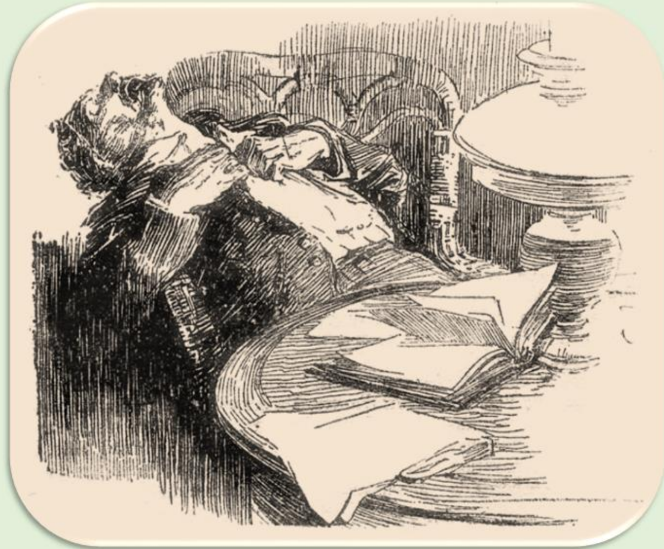
The Devil's Foot