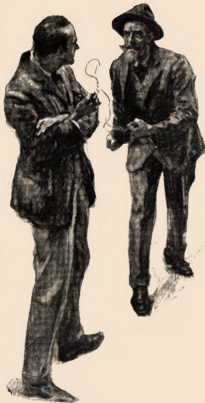
The Devil's Foot