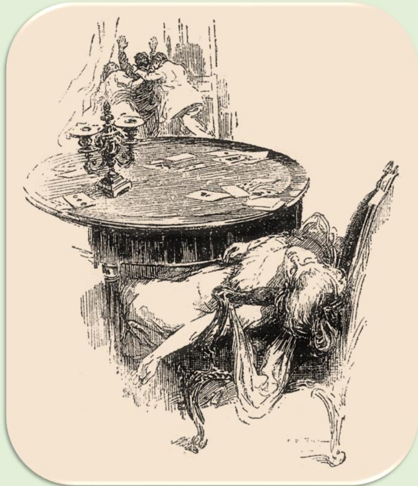
The Devil's Foot