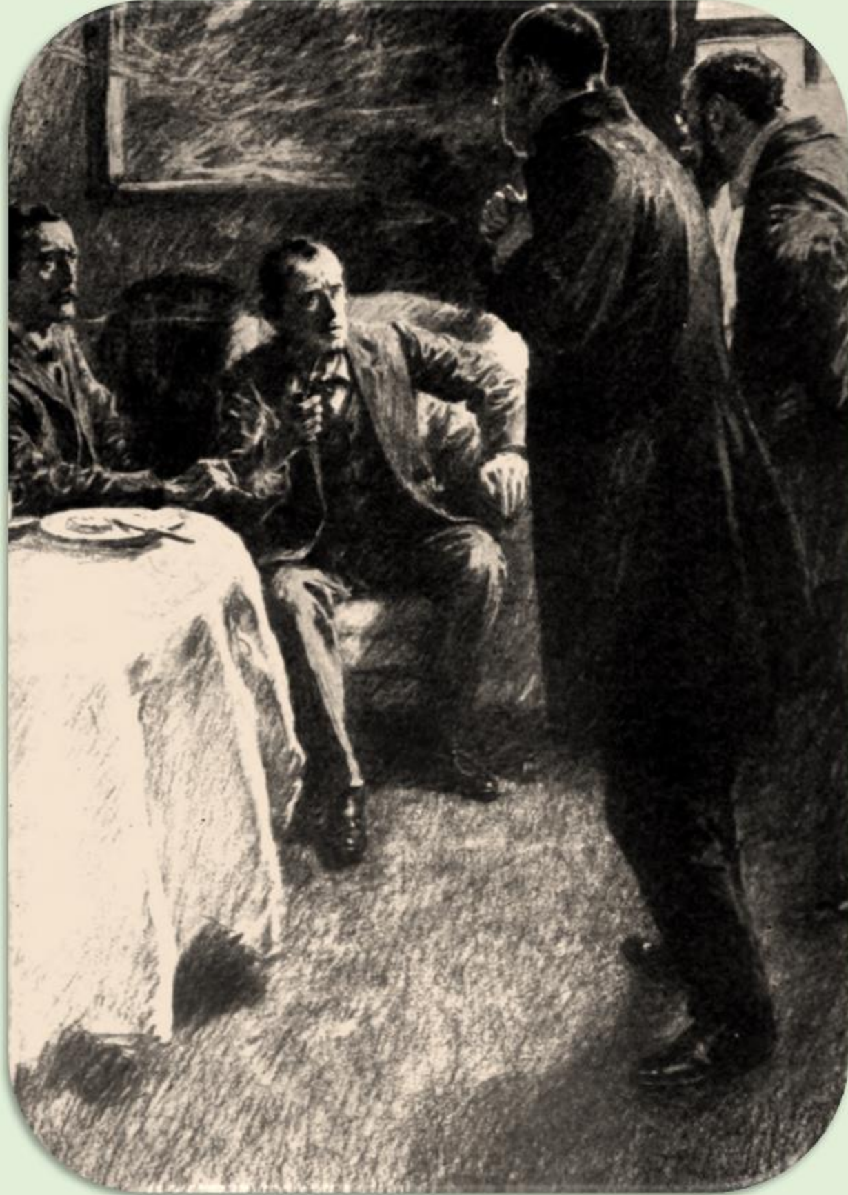
The Devil's Foot