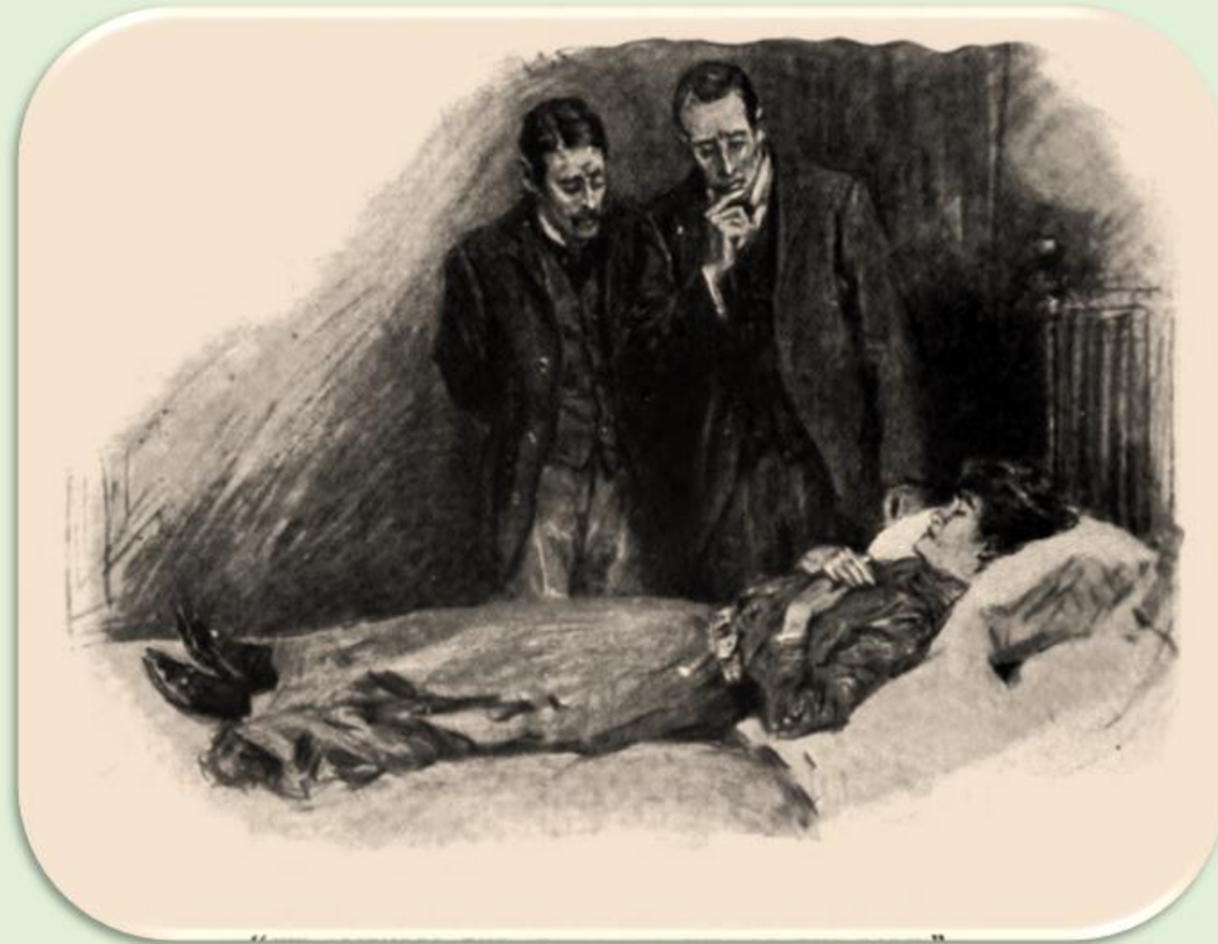
The Devil's Foot