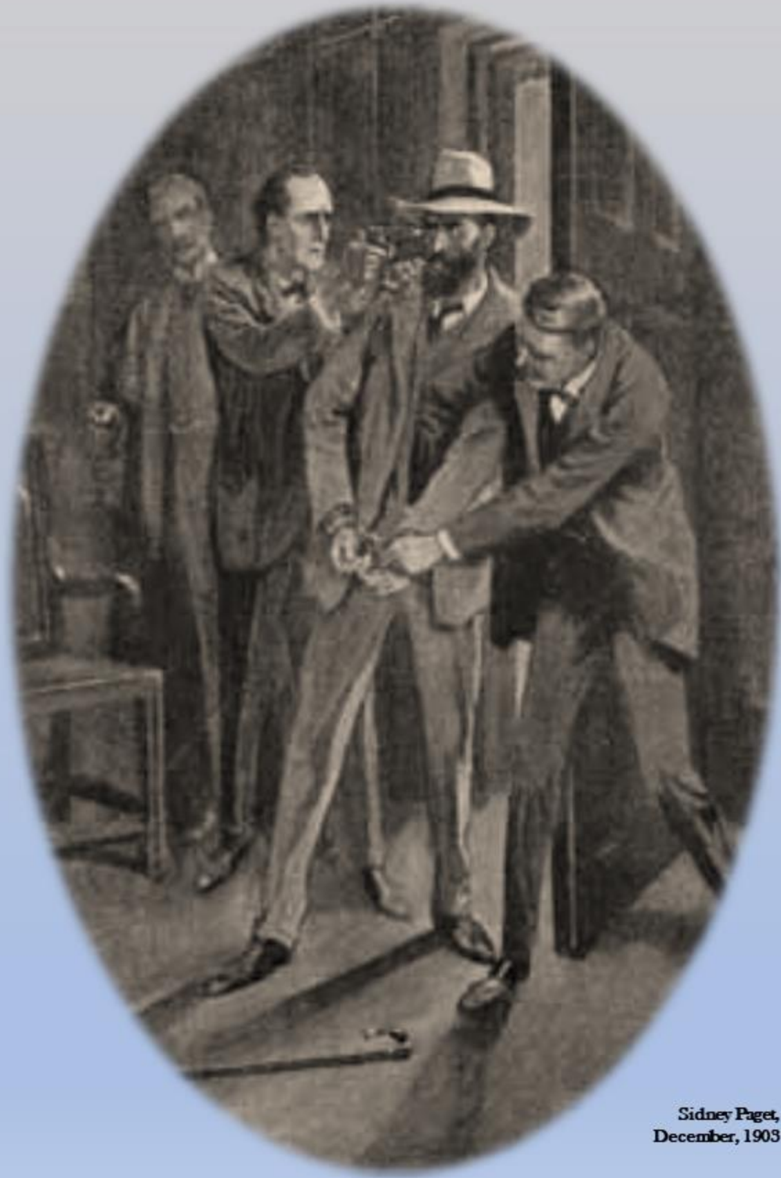
Sidney Paget, December, 1903