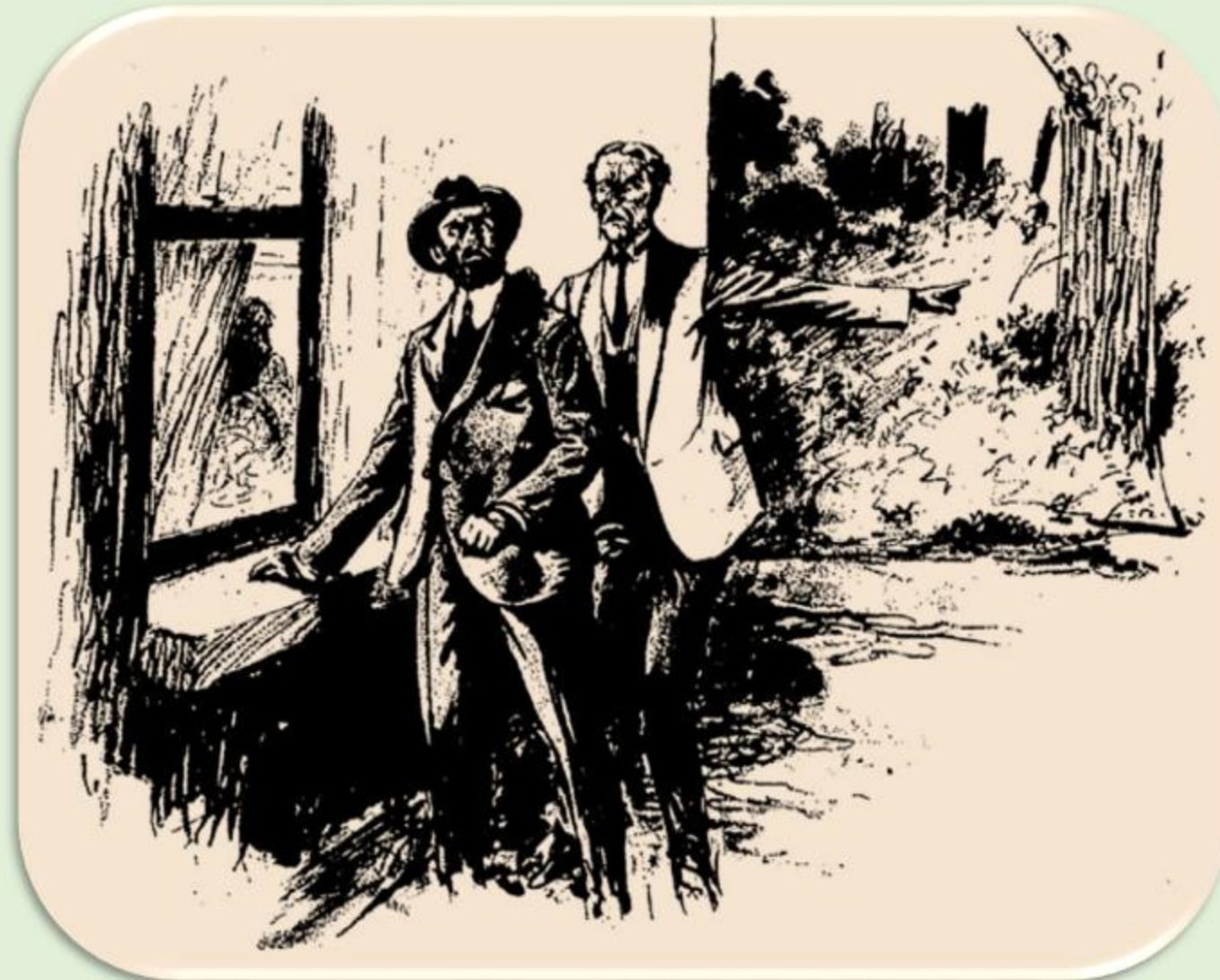
The Blanched Solider