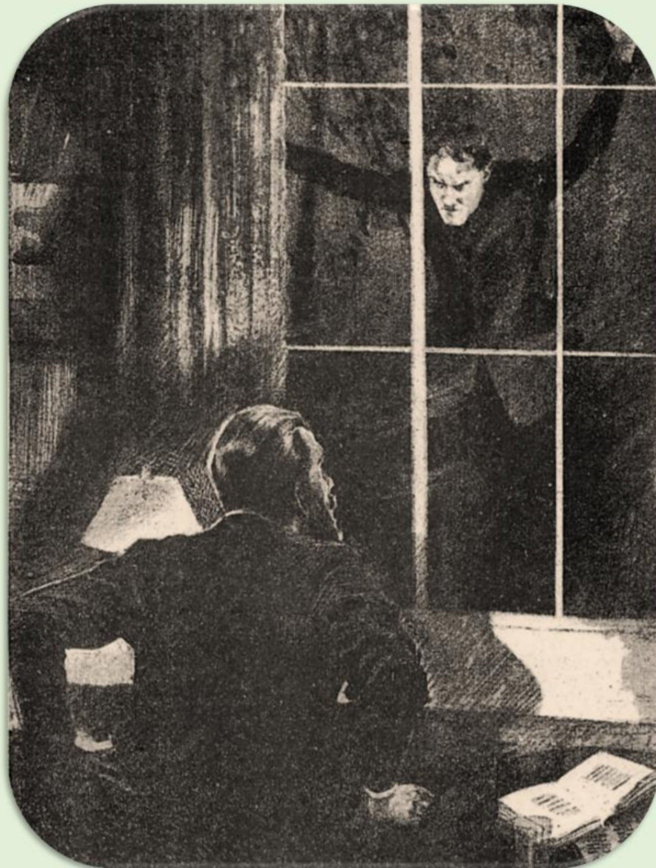
The Blanched Solider