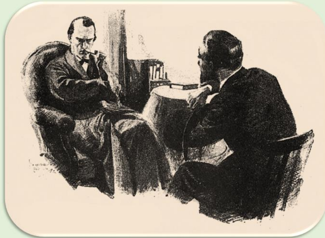
The Blanched Solider