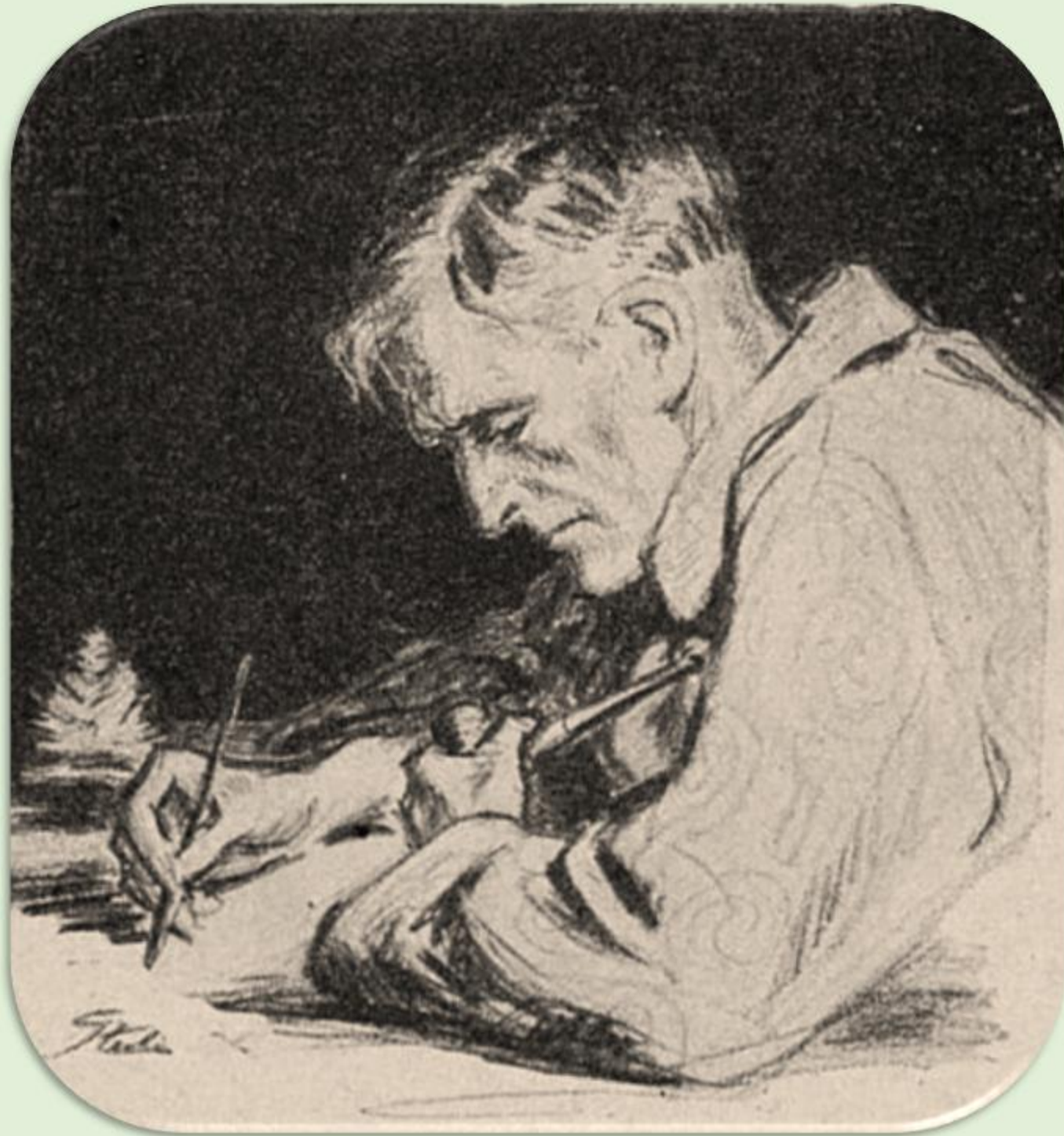
The Blanched Solider