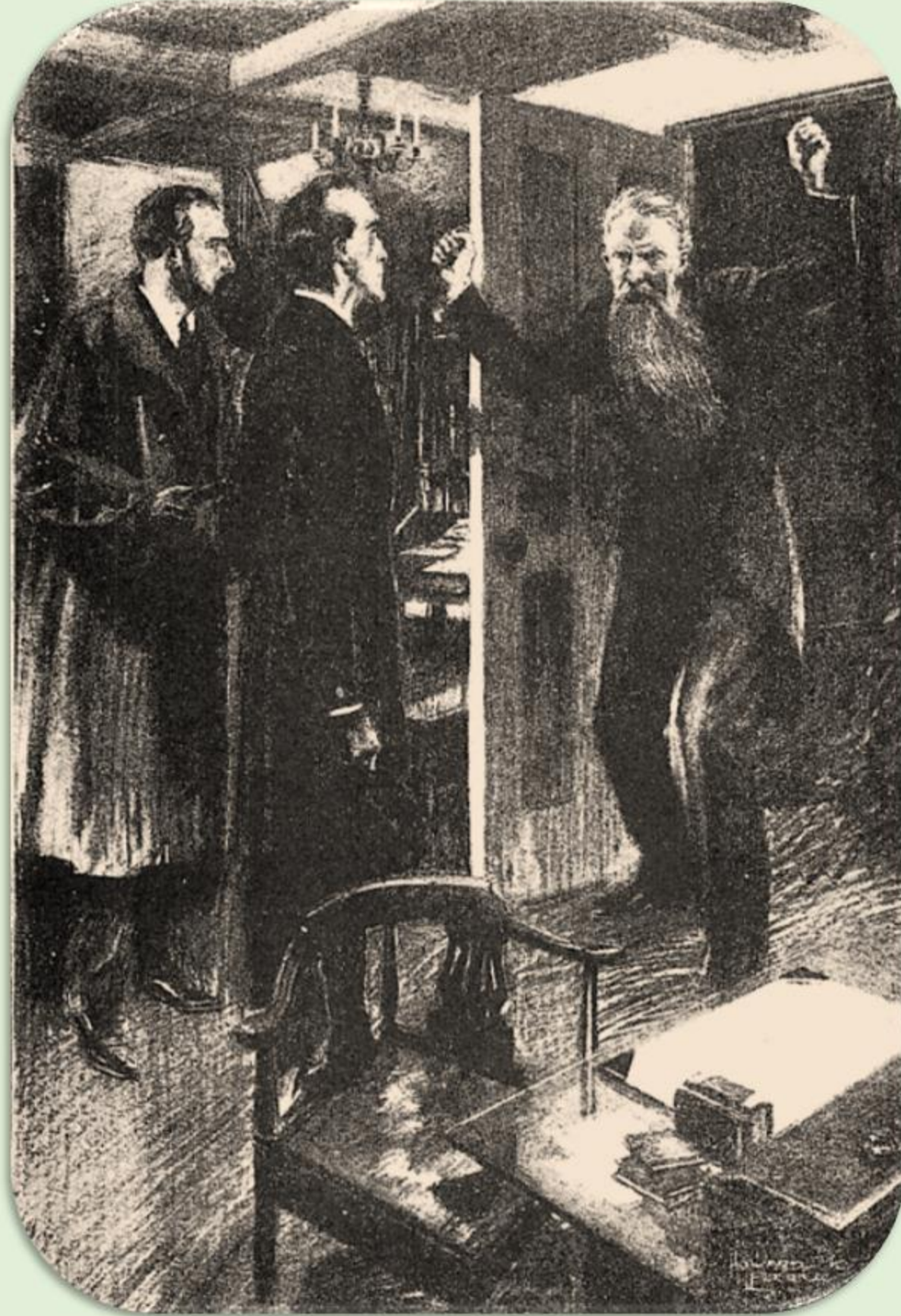
The Blanched Solider