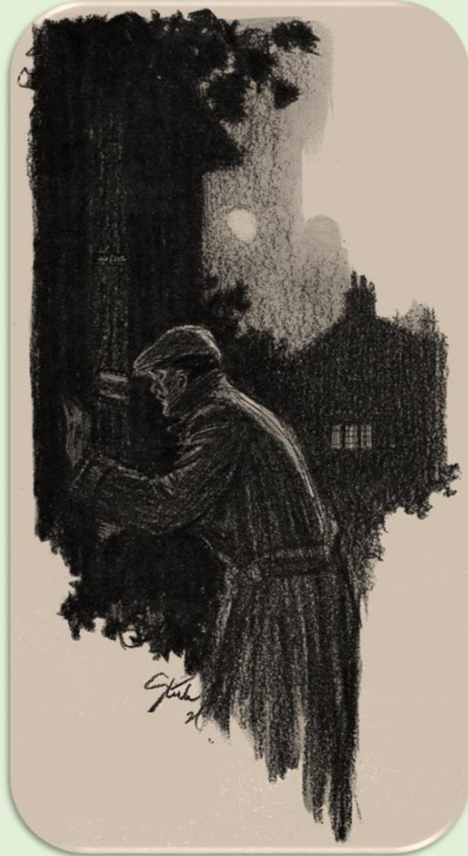
The Blanched Solider