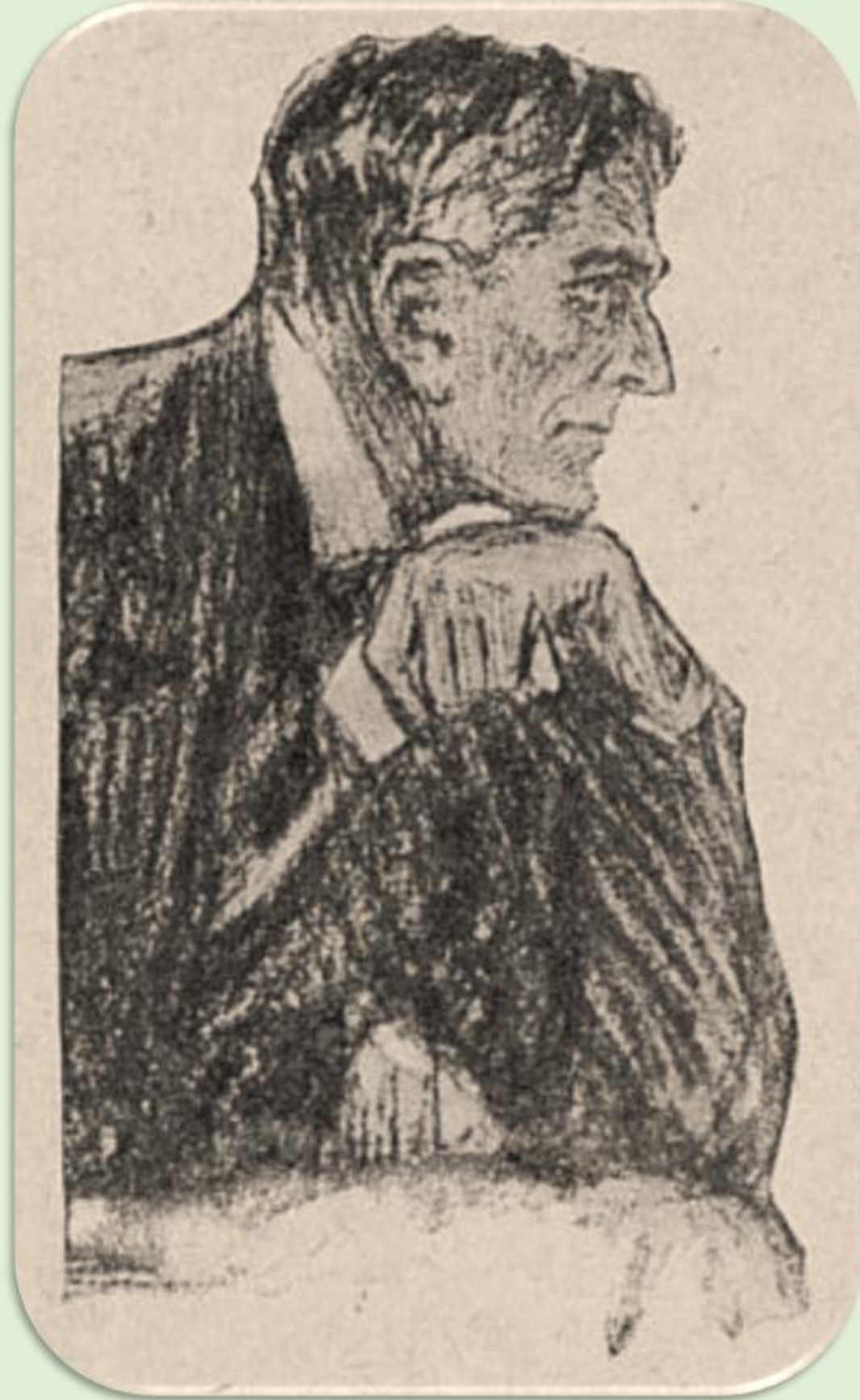
The Blanched Solider