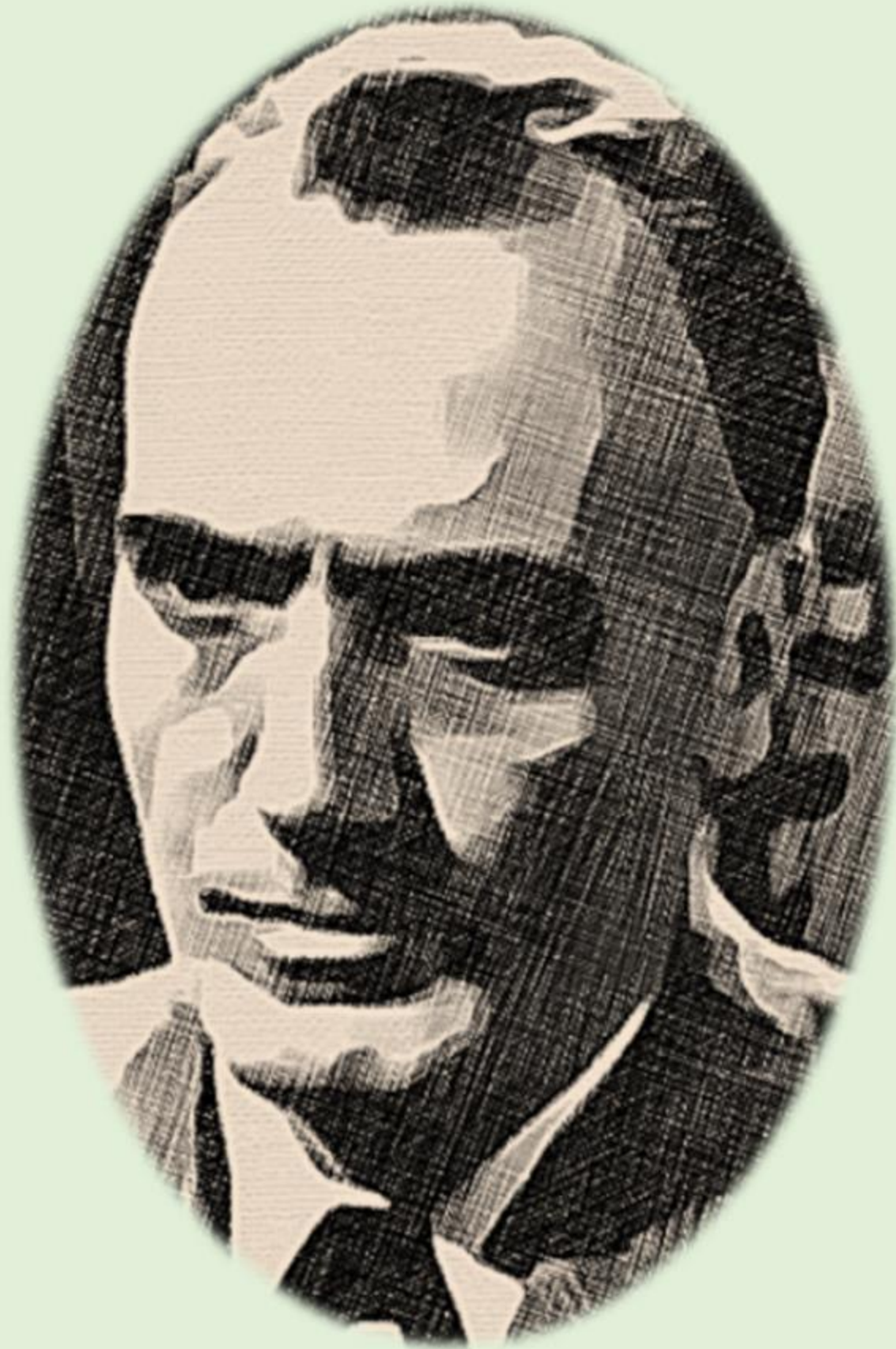
The Blanched Solider