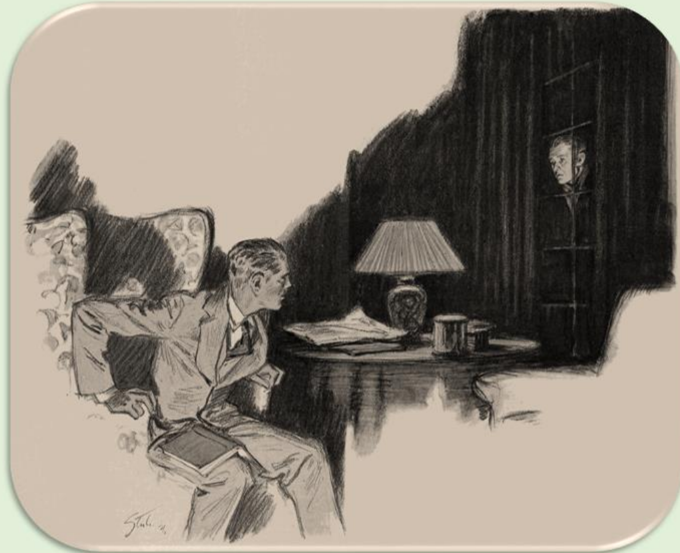
The Blanched Solider