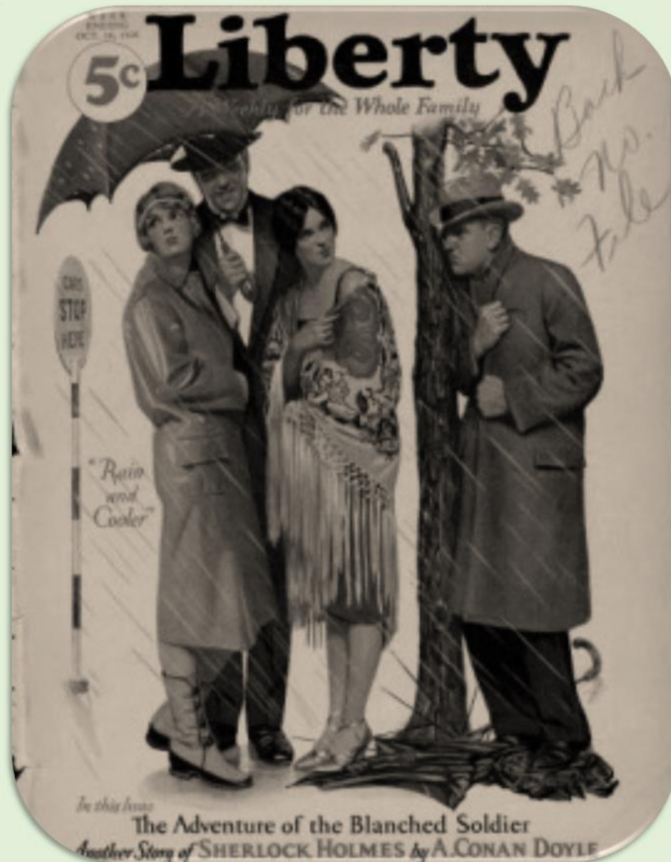
The Blanched Solider