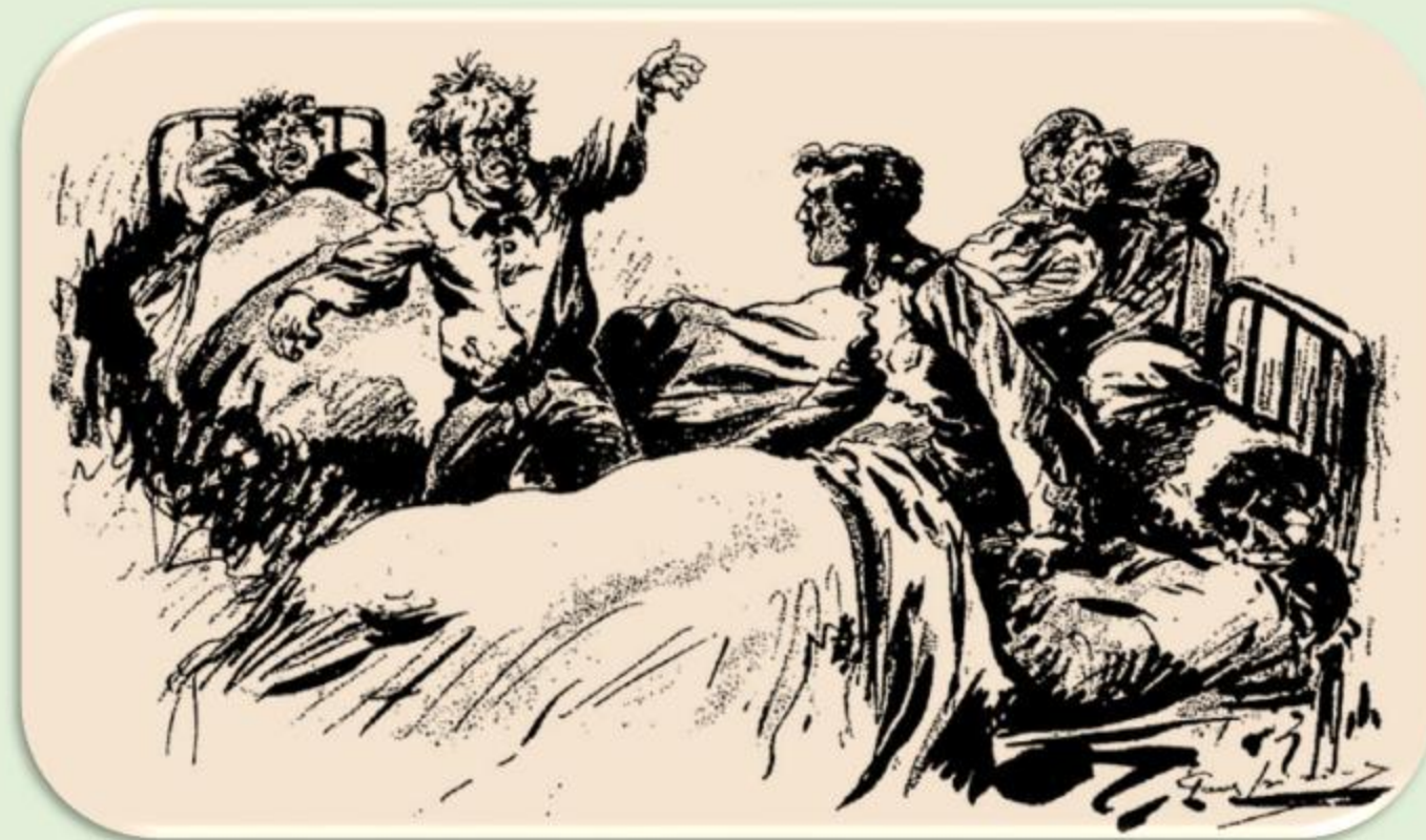
The Blanched Solider