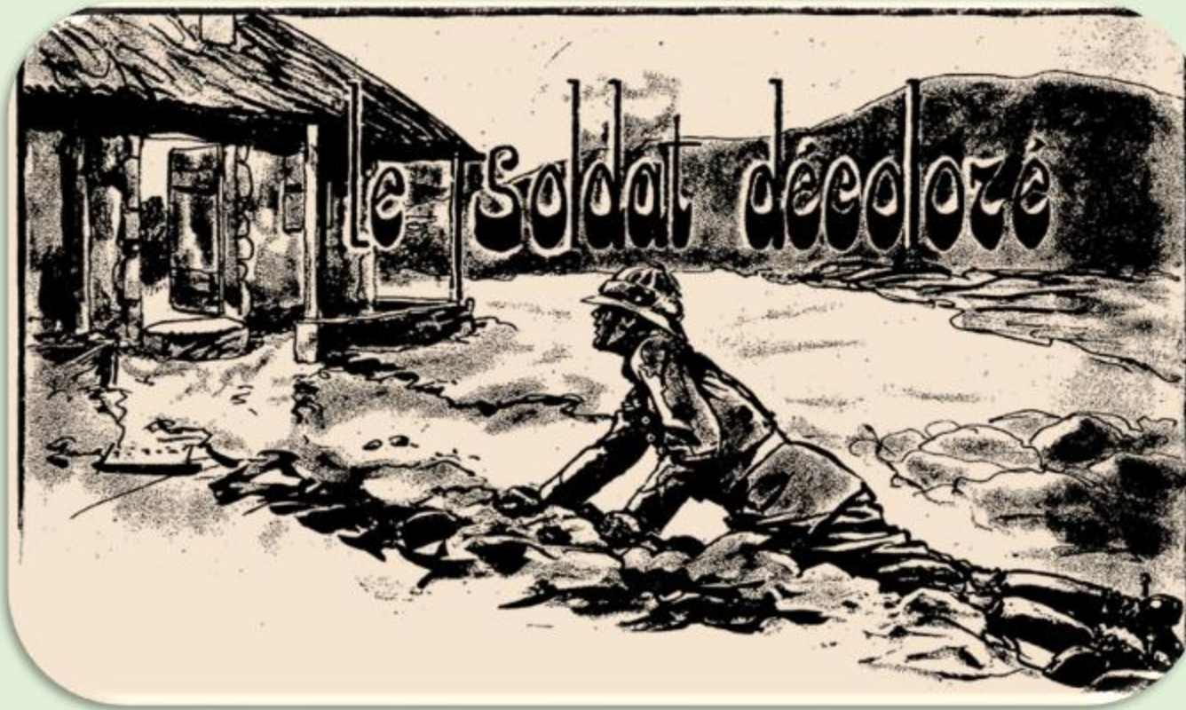
The Blanched Solider