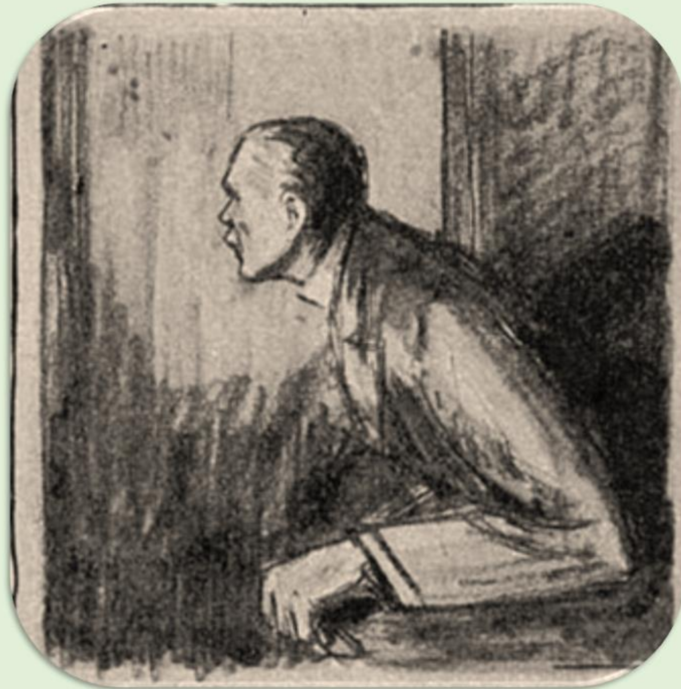
The Blanched Solider