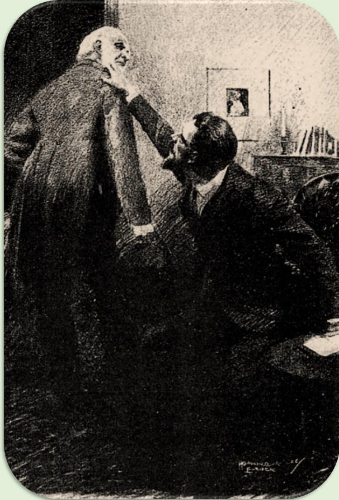
The Blanched Solider