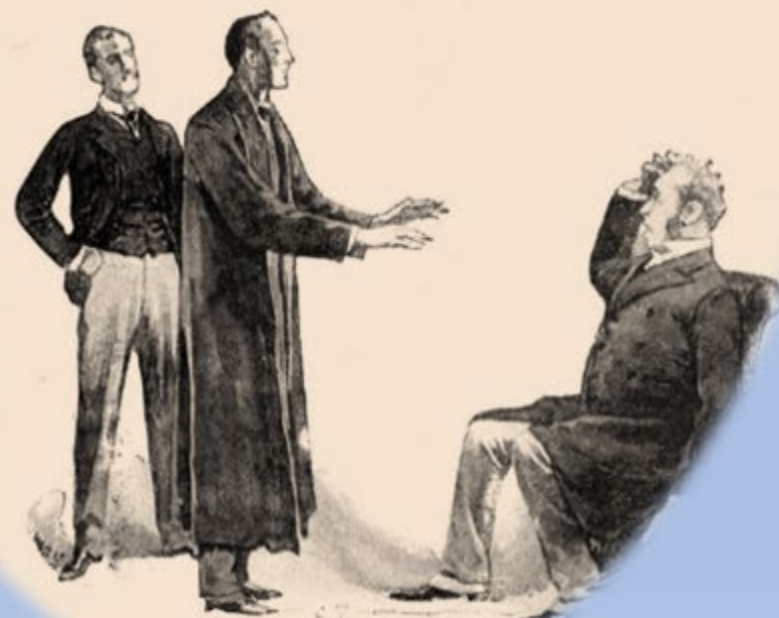
"WITH A LOOK OF GRIEF AND DESPAIR"

A few moments later he was in our room, still puffing, still gesticulating, but with so fixed a look of grief and despair in his eyes that our smiles were turned in an instant to horror and pity. For a while he could not get his words out, but swayed his body and plucked at his hair like one who has been driven to the extreme limits of his reason. Then, suddenly springing