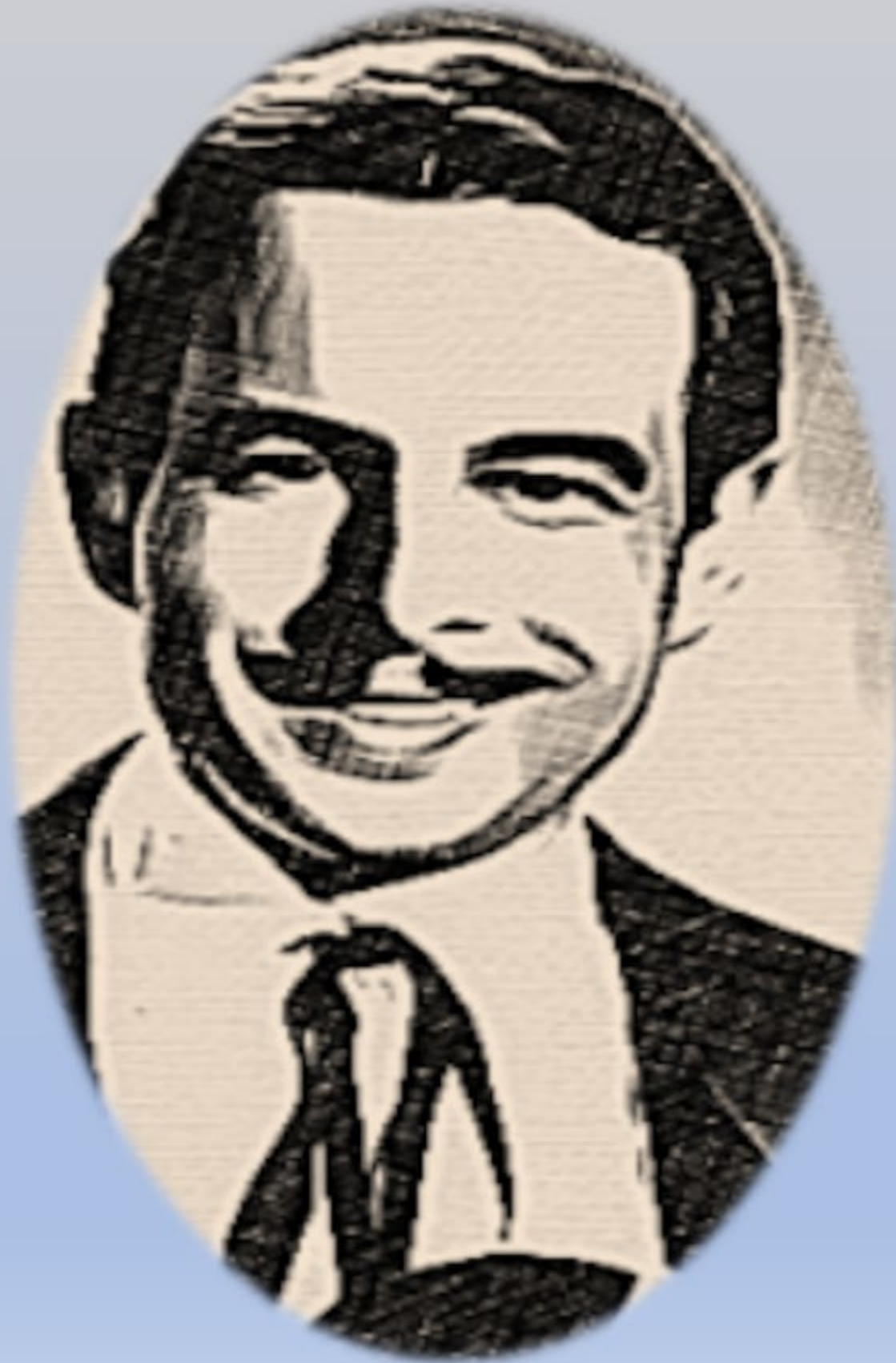
Sir George Burnwell