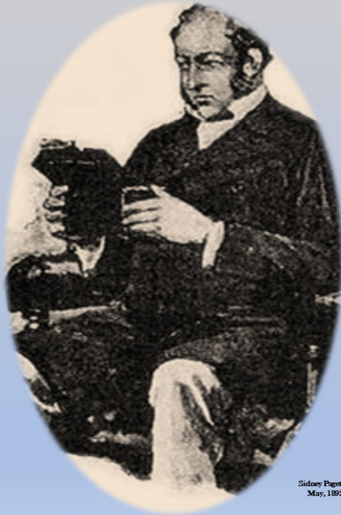
Sidney Paget, May, 1892