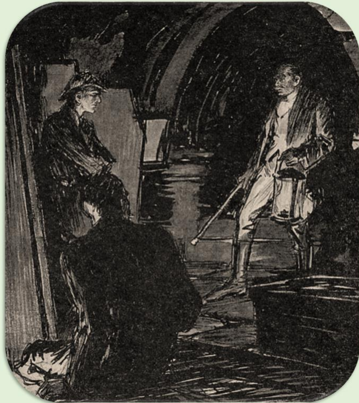
Shoscombe Old Place