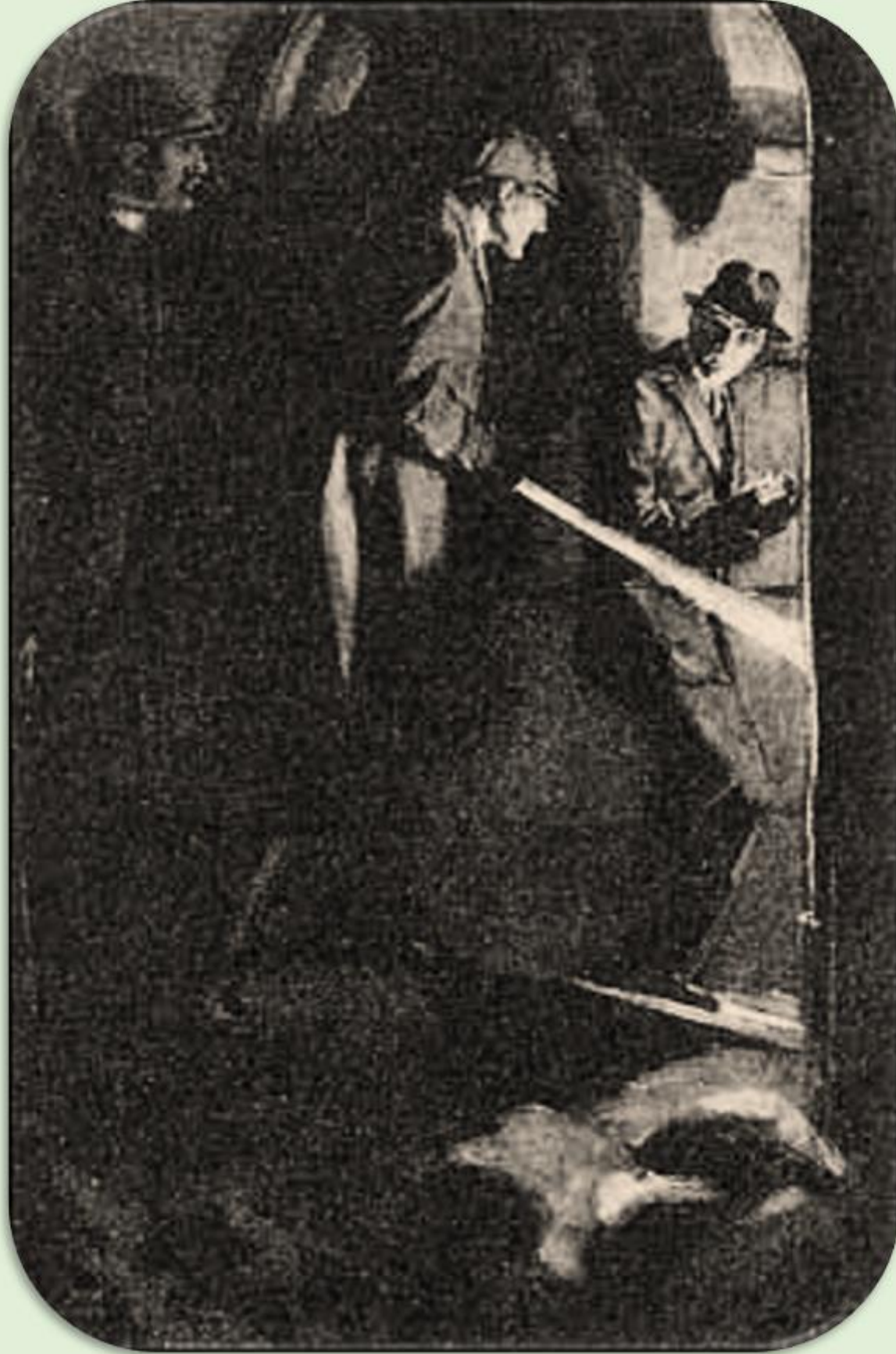
Shoscombe Old Place