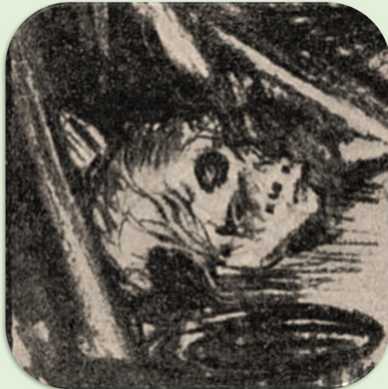
Shoscombe Old Place