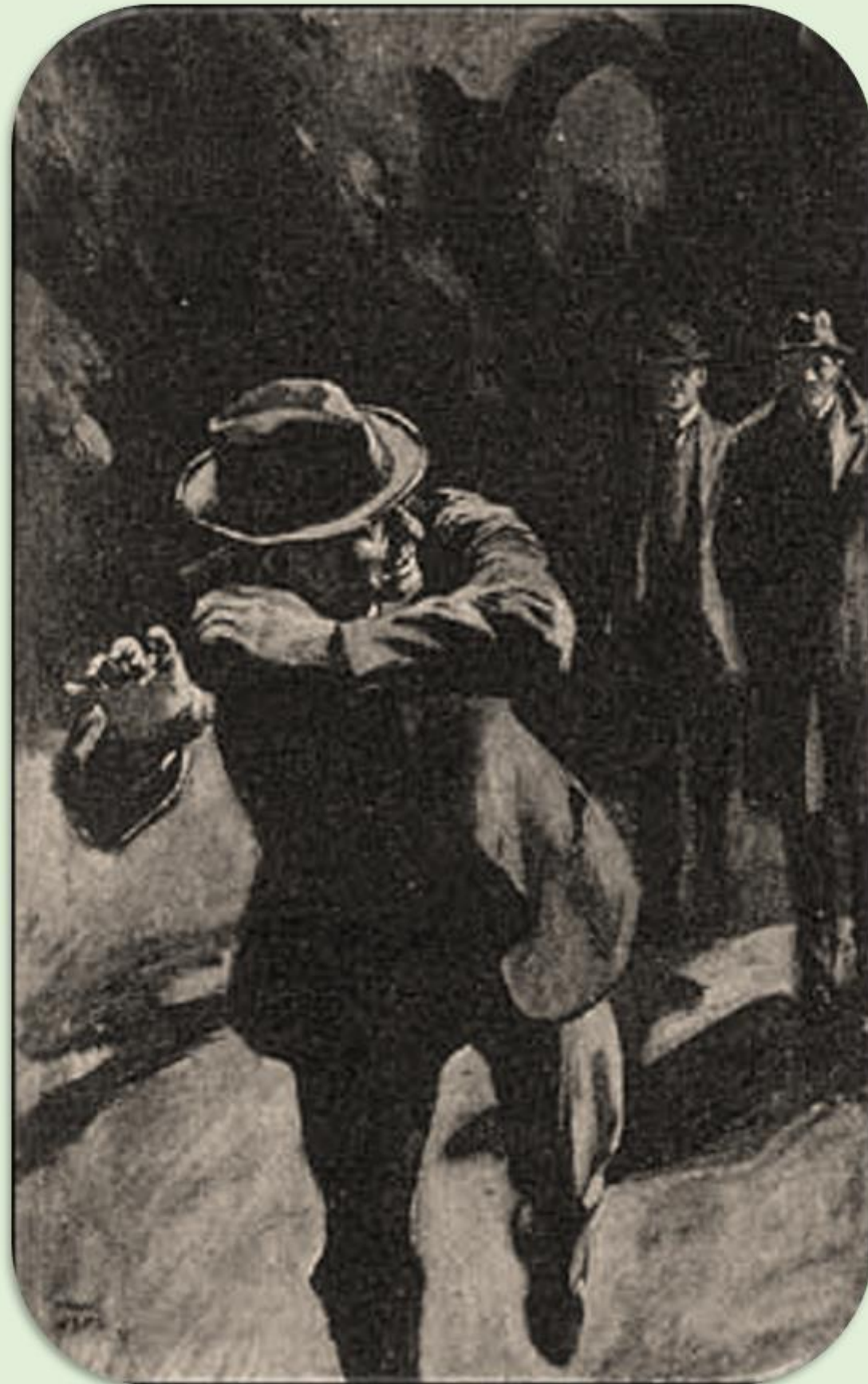
Shoscombe Old Place