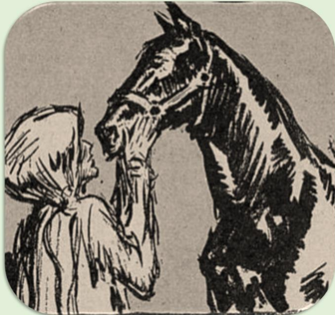
Shoscombe Old Place