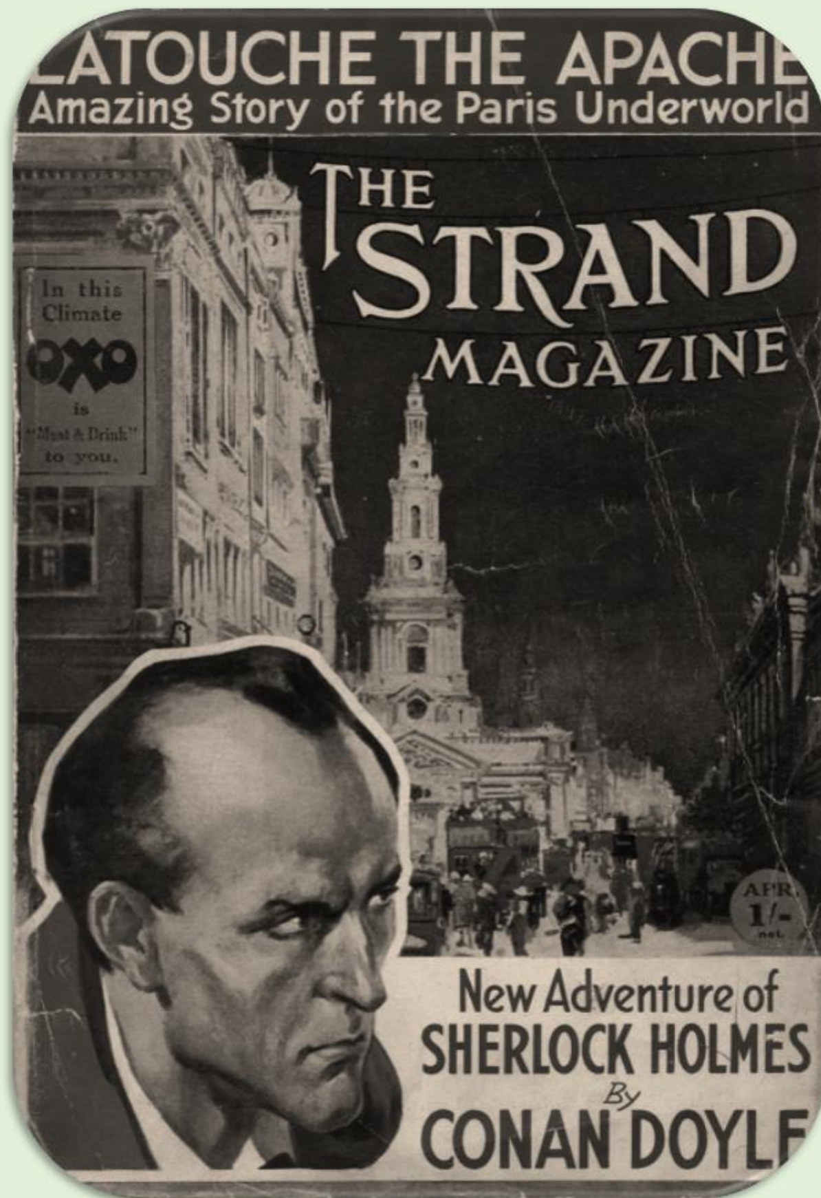
Shoscombe Old Place