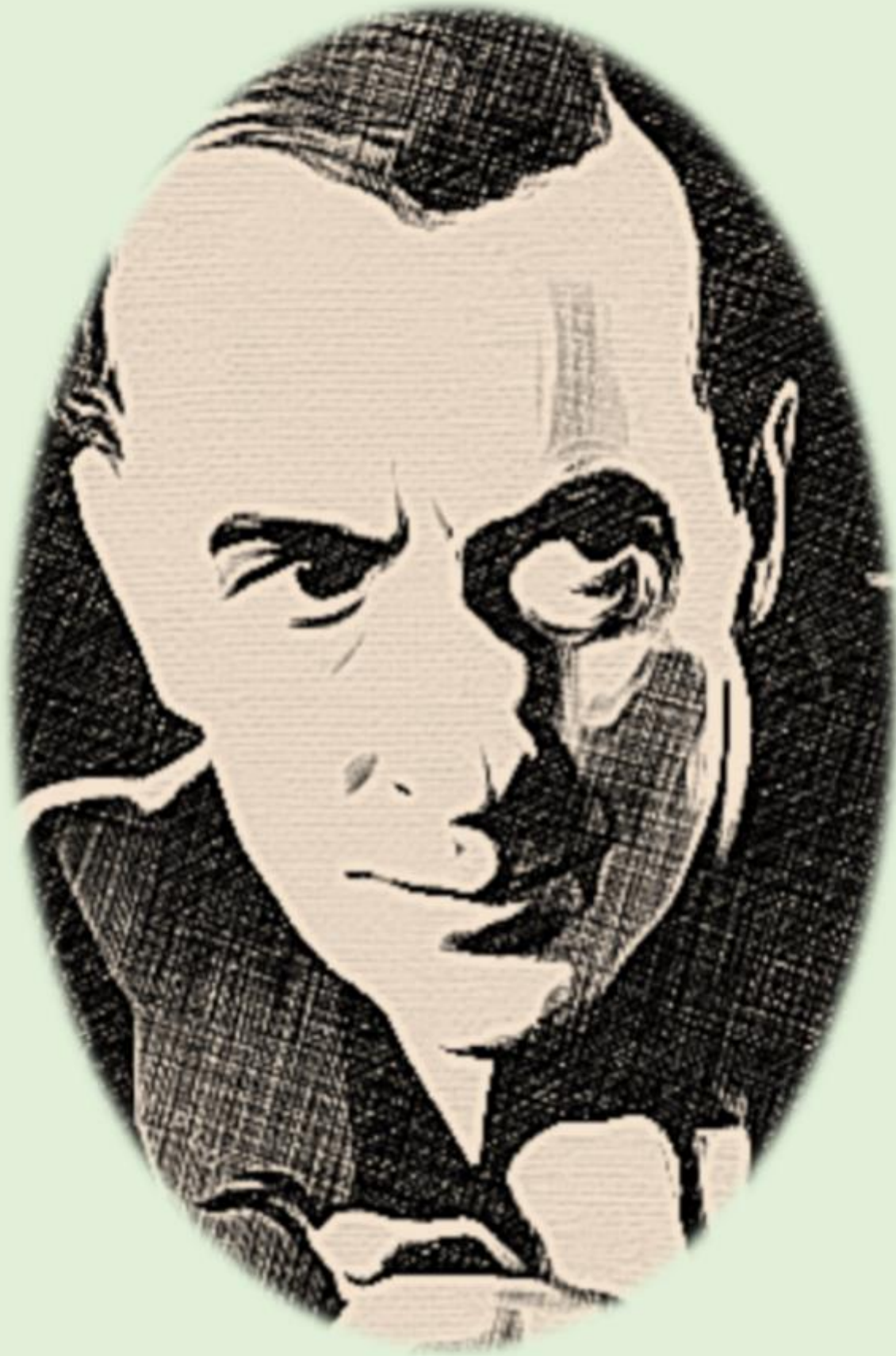
Shoscombe Old Place