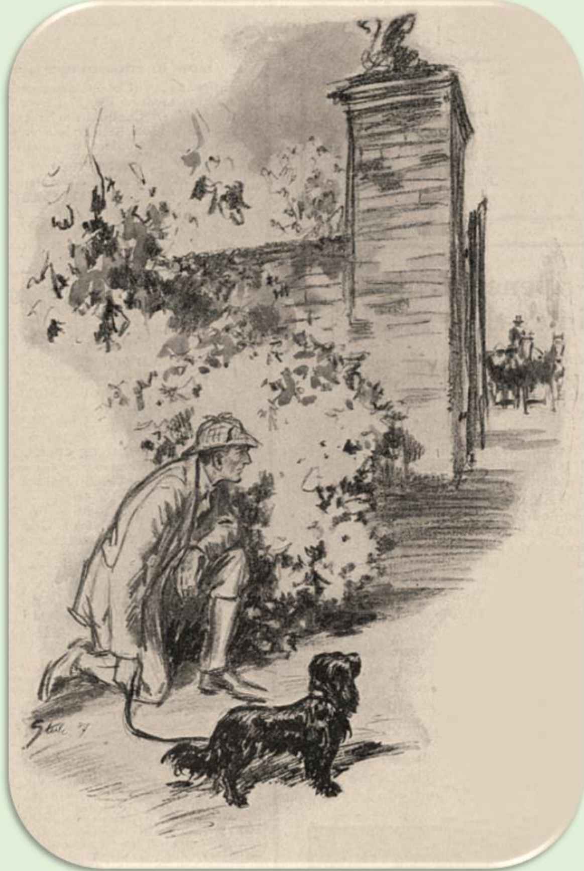
Shoscombe Old Place