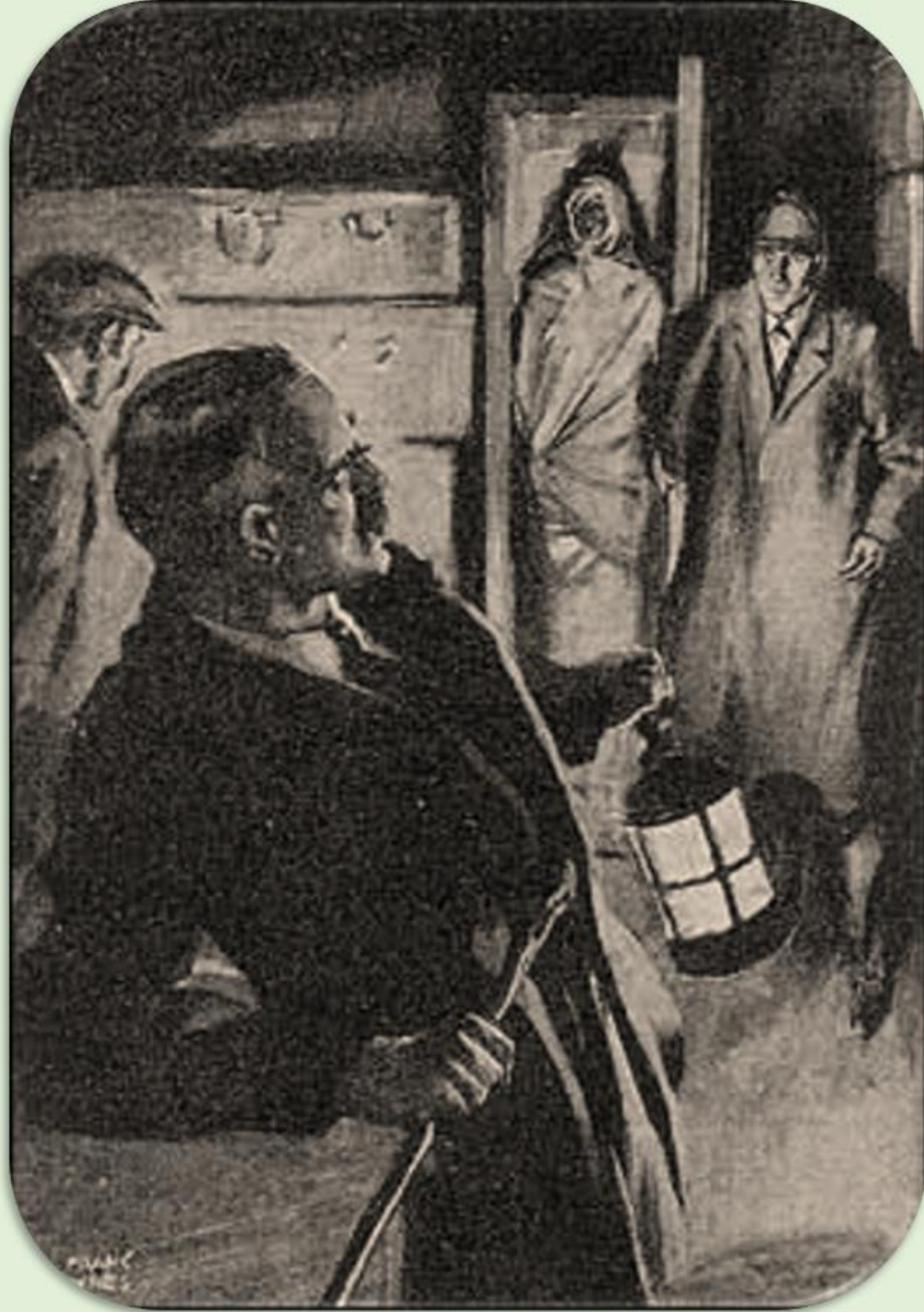
Shoscombe Old Place