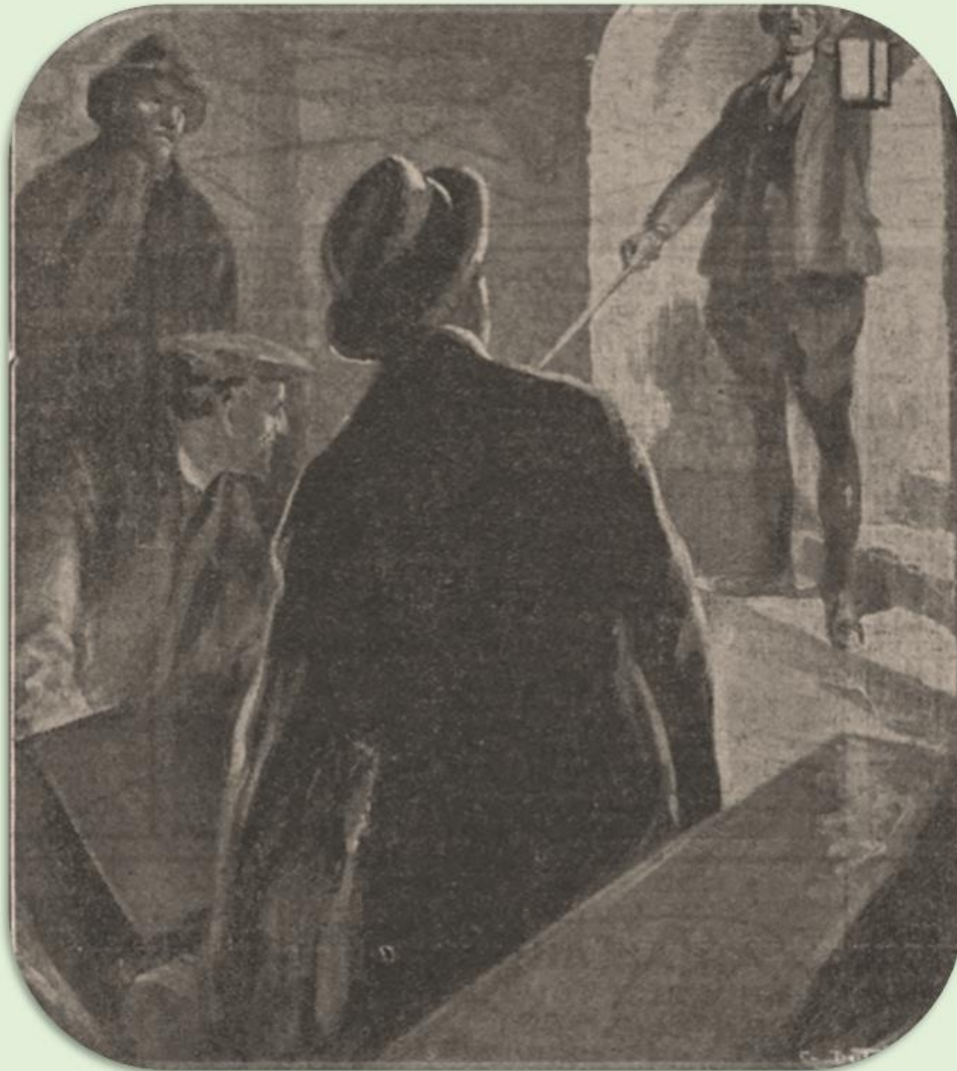
Shoscombe Old Place