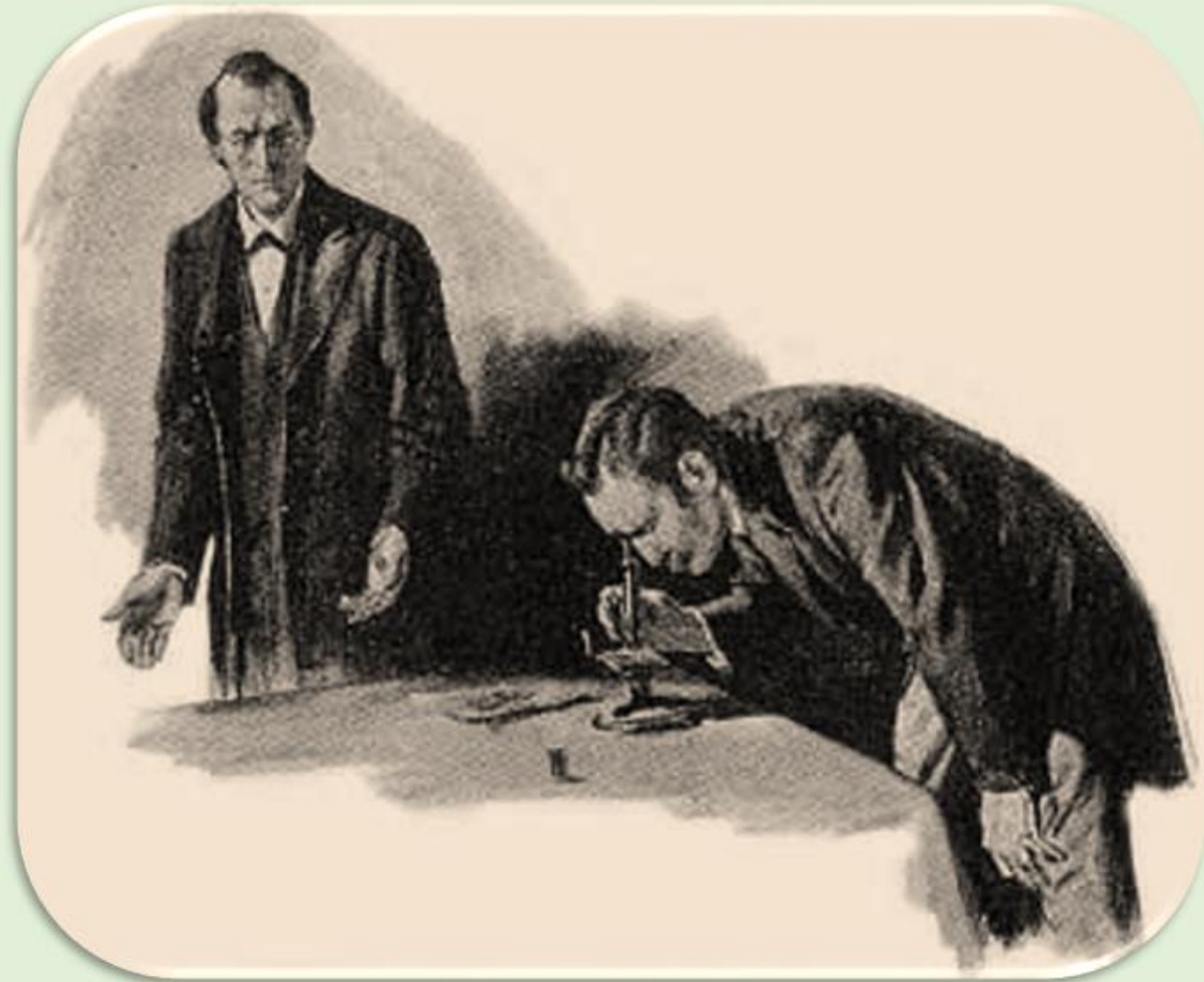
Shoscombe Old Place