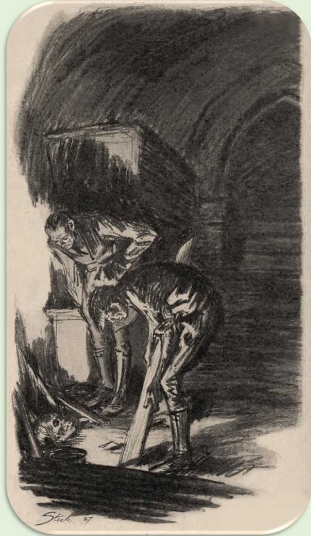
Shoscombe Old Place