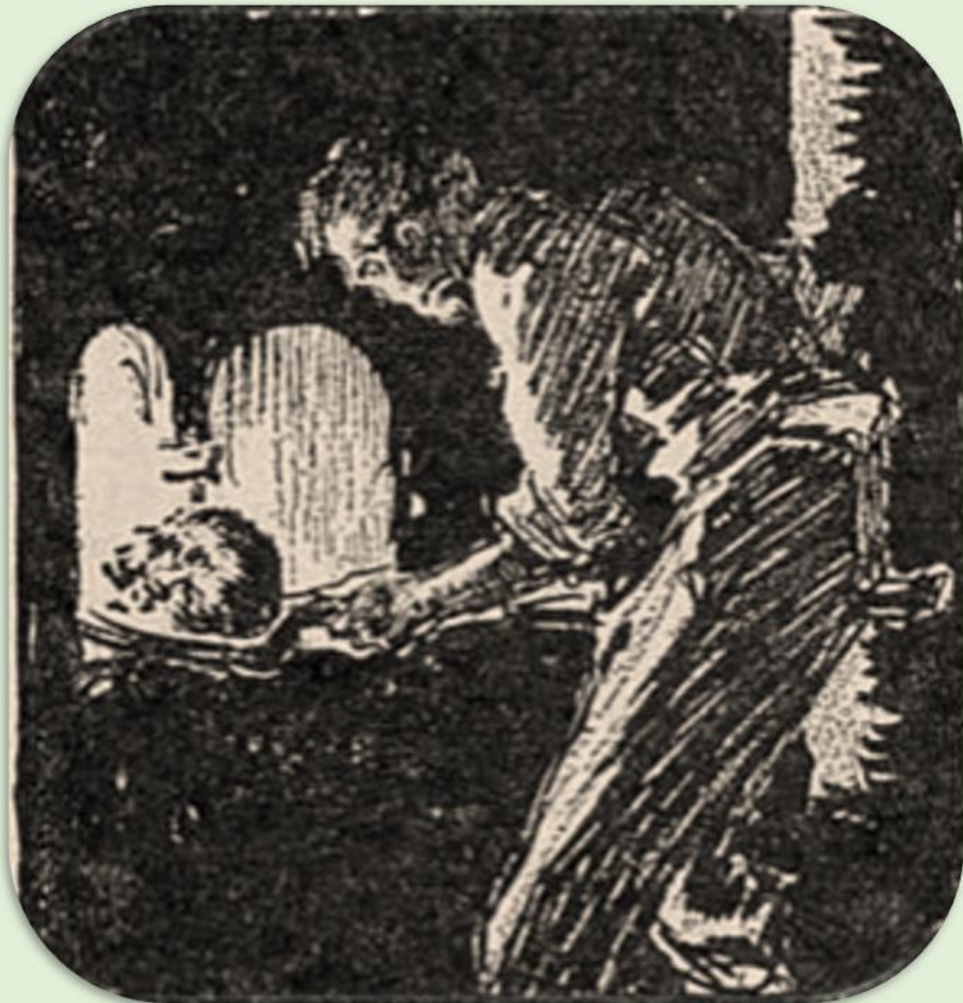
Shoscombe Old Place