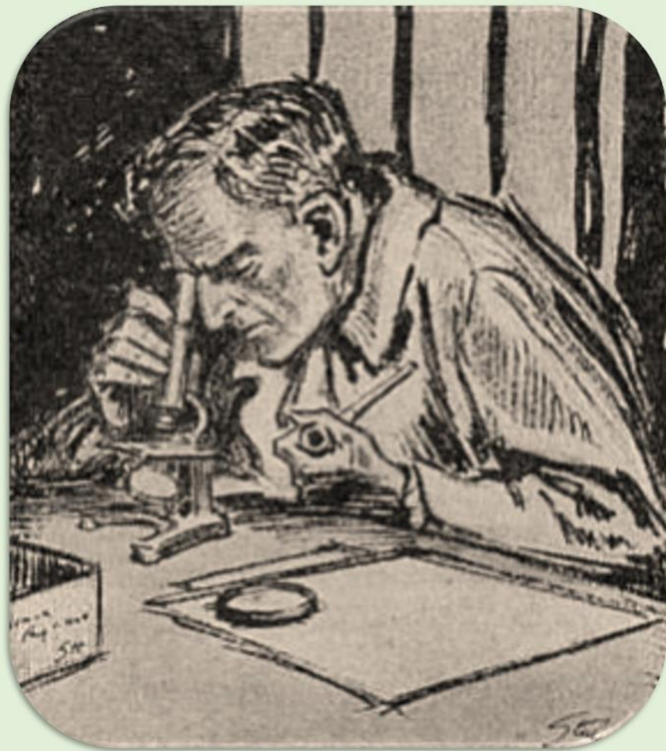
Shoscombe Old Place