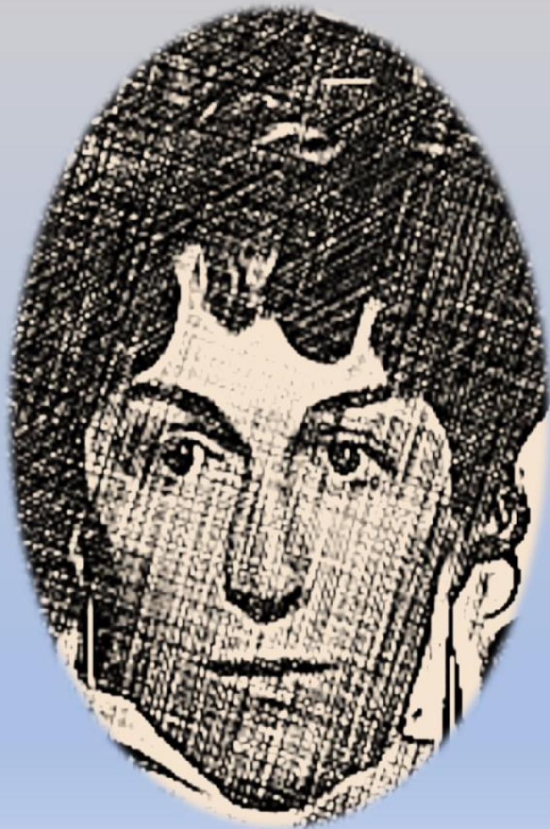
Lady Frances Carfax