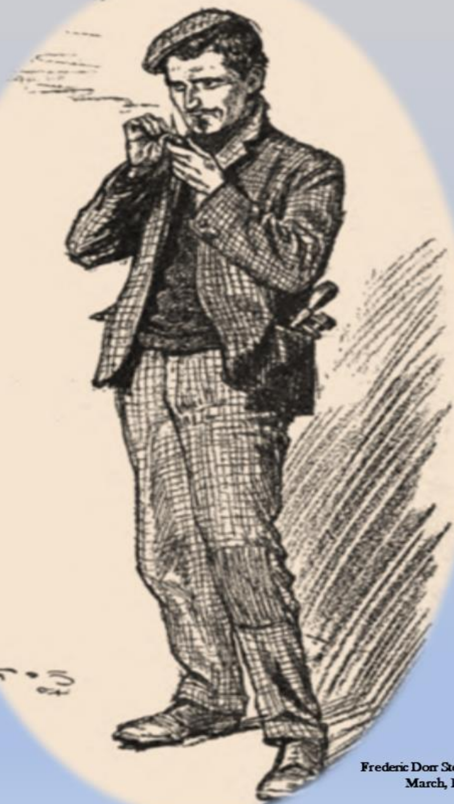
Frederic Dorr Steele, March, 1904