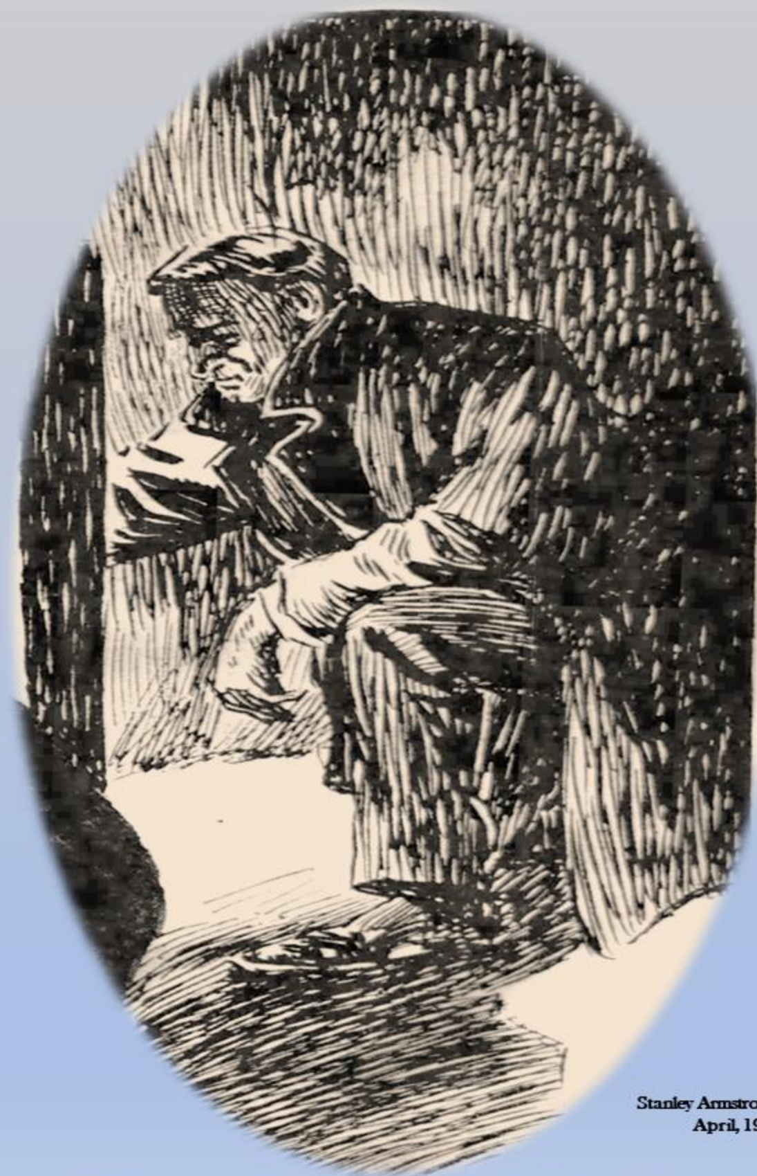
Stanley Armstrong, April, 1905