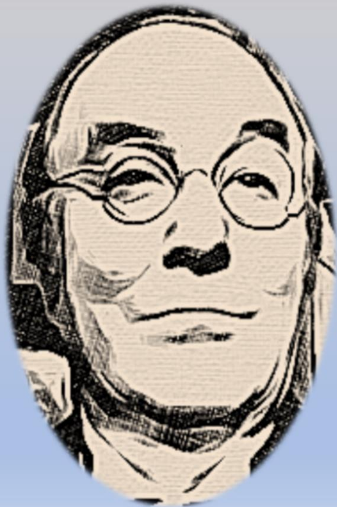
Charles Augustus Milverton