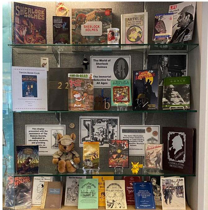
Panorama City California Branch Library, courtesy of the Curious Collectors of Baker Street