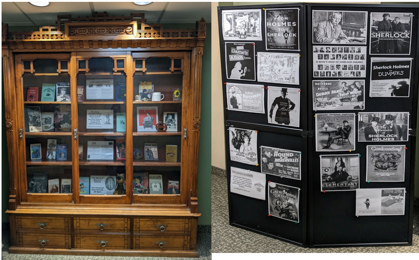
Stillwater Minnesota Public Library