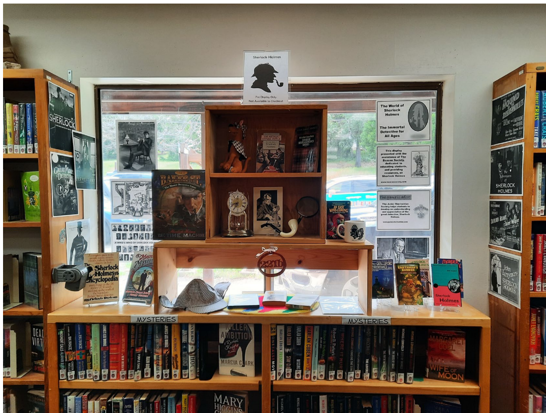
Georgetown California Public Library