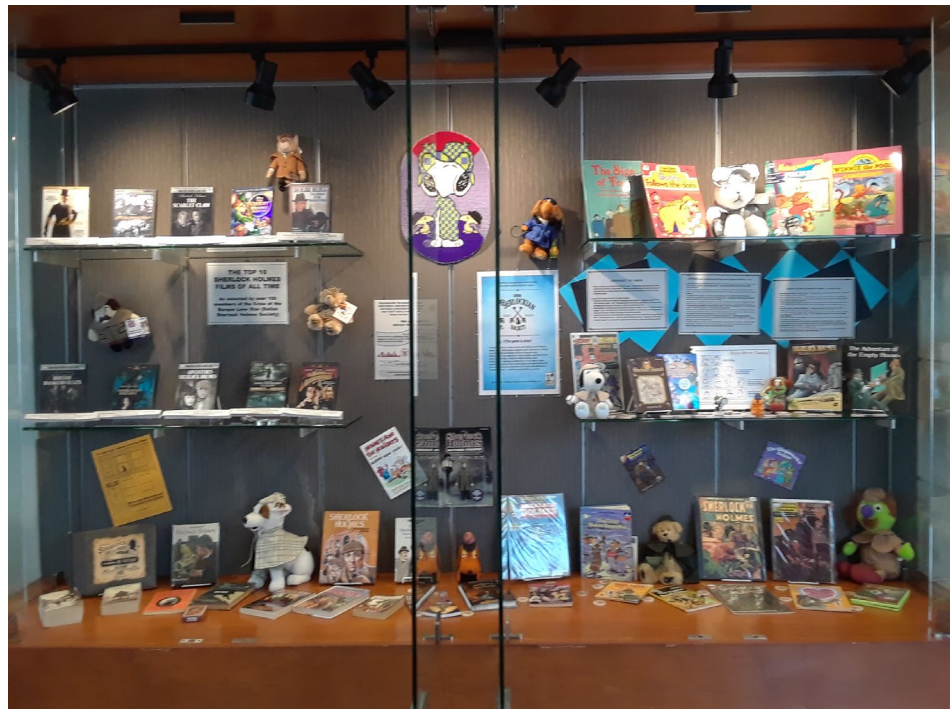
Allen Texas Public Library display

You can find out more about this project here [ https://www.beaconsociety.com/library-display-project.html ].