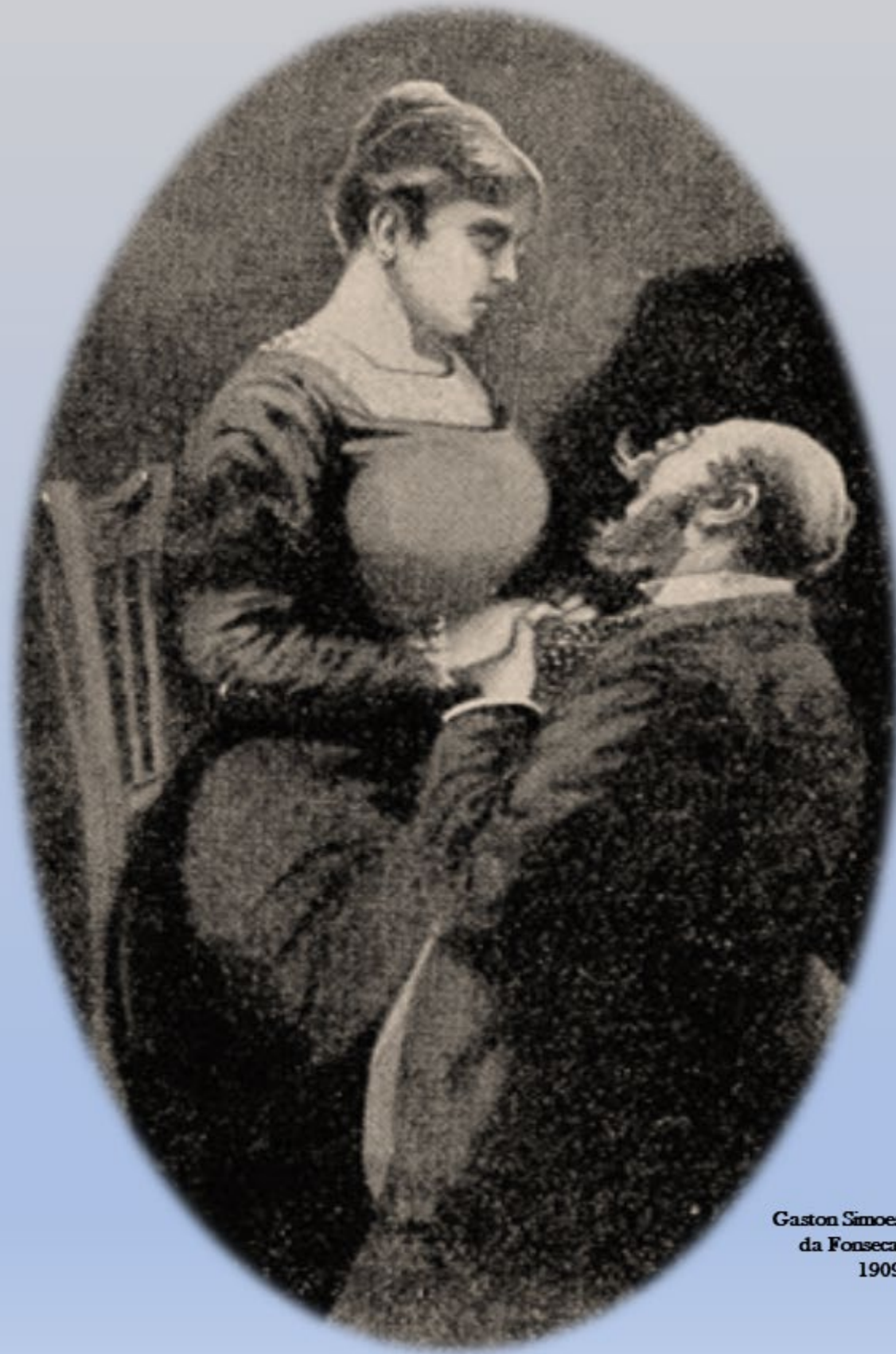
Gaston Simoes da Fonseca, 1909