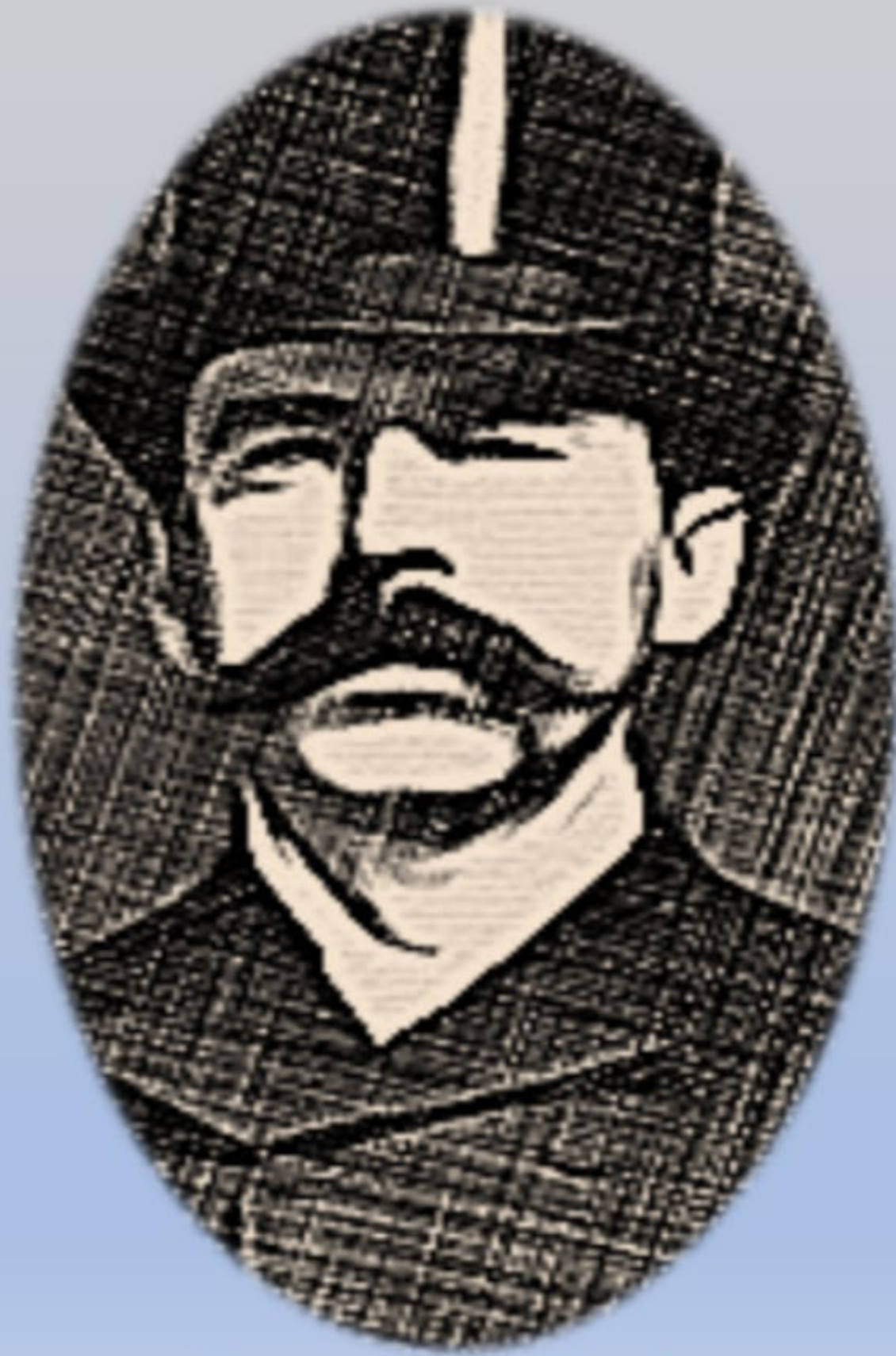
James Windibank (aka Hosmer Angel)