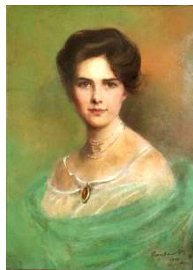
Princess Victoria Alexandra Olga Mary.

When Queen Alexandra died in 1925, Princess Victoria withdrew to a house she had at Coppins, Iver, in Buckinghamshire, and devoted herself to the village's life, becoming the honorary president of the local horticultural society.