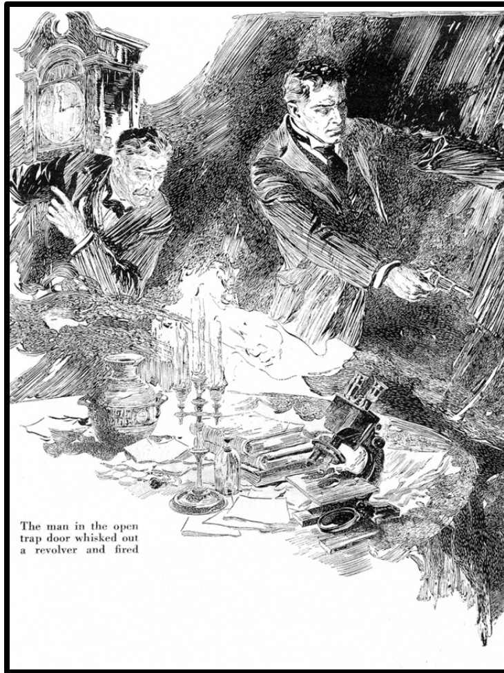
The man in the open trap door whisked out a revolver and fired