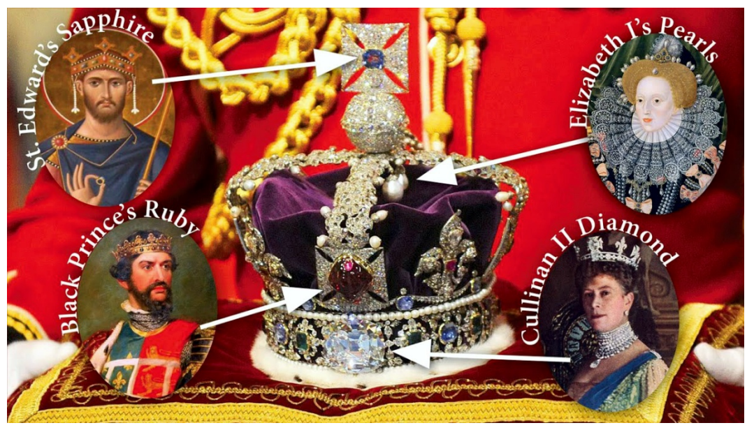
As can be seen, it is not solely the intrinsic value of its jewels and workmanship that make the British crown valuable, but also the history and tradition it represents. This is true of the rest of the crown jewels.

The actual Crown Jewels inside the Tower of London have been estimated to be worth $5 to $8 billion—quite a price