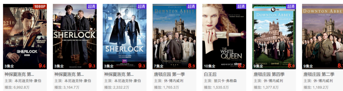
Figure 2 Top watched British TV series on Youku (accessed 22nd July, 2014)

BBC’s Sherlock is the most popular British TV series online in Mainland China as to date. On the British TV channel of China’s largest online video website, Youku, BBC Sherlock’s three seasons are listed top three in most-played videos - the third season getting over 70 million views on Youku only (Youku, July 2014). Compared to second-popular British TV series Downton abbey, the hits for the third season is more than three times the amount of views for Downton Abbey’s season one.