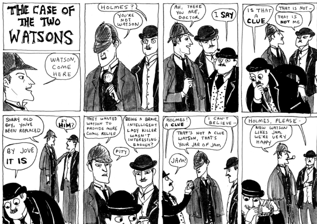
Figure 9 - from the comic Hark, A Vagrant by Kate Beaton

The Adventures of Sherlock Holmes, 1939. Film produced by 20th Century Fox. Starring Basil Rathbone as Holmes and Nigel Bruce as Watson.