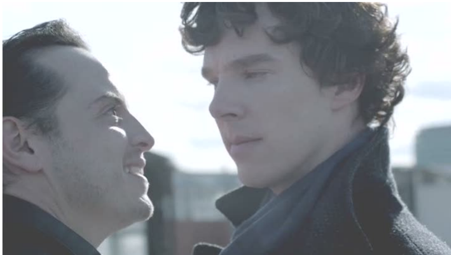
Figure 19 - Cumberbatch's Holmes and Scott's Moriarty face off

Throughout, Moriarty explicitly insists that this is the case: "We're just alike, you and I", he says, "Except you're boring. You're on the side of the angels." In their final confrontation on a rooftop, Moriarty despairs that Sherlock has not turned out to be a worthy adversary. "I'm disappointed in you, ordinary Sherlock," he says. He tells Sherlock that three gunmen are in place to kill Watson, Mrs. Hudson and Detective Inspector Lestrade. They will only be called off if Sherlock commits suicide and completes Moriarty's tale of the fictitious detective; the