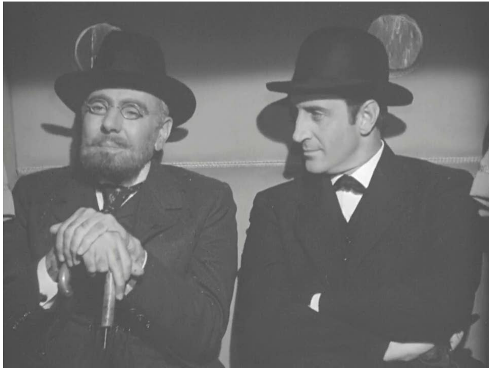
Figure 2 - Holmes & Moriarty chat in The Adventures of Sherlock Holmes

The film opens with a courtroom where Moriarty (George Zucco) is being tried for murder and is found not guilty. Holmes rushes in with new evidence to convict but he is too late; Moriarty is a free man and cannot be brought to trial again on the same charge. Holmes and Moriarty then share a horse-drawn cab in the rainy streets and banter about their rivalry;