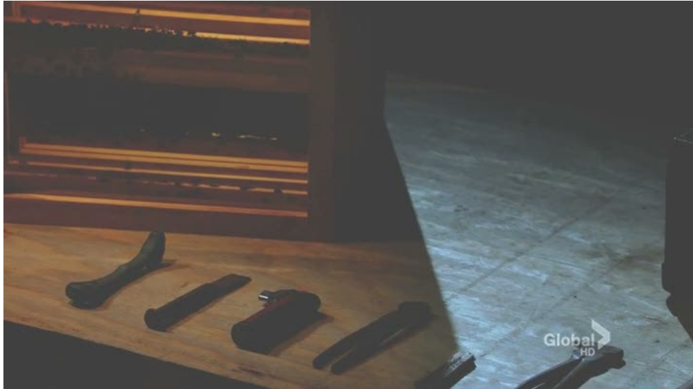
Figure 21 - Holmes' tools for his interrogation of "M"

extremely masculine - a tall, strapping man with a strong New York accent, with great authority in the precinct, who is respected by his subordinate detectives and by Holmes. He makes it clear that to be an effective professional means putting one's feelings aside and controlling any violent impulses. Holmes' desire for vengeance may be understandable but it is the hallmark of a boy rather than a man, an adolescent having a tantrum rather than a man doing a man's work. That he eventually allows M to live (albeit with a carefully non-lethal stab wound) is evidence of emotional progress, but it is also partly due to M's convincing him someone else was responsible for killing Irene. Violence is constructed as part and parcel of the impulsivity that led to Holmes' addiction, as something that he needs to work to outgrow in order to achieve the more mature masculinity displayed by Captain Gregson.