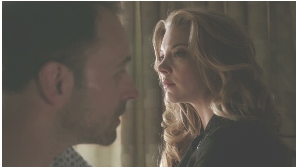
Figure 20 - Dormer's Moriarty as Miller's Holmes springs the trap

be a mind that rivaled my own, something too complicated and too beautiful to destroy at least without further analysis. So I devised a way to study you in your own environment. . . . Imagine my surprise when I realized how much we had in common." To which Sherlock replies, "I have about as much in common with you as I do a dung beetle." But Moriarty insists that they are the same, saying, "I see everything you do. I feel it. Makes the world quite dull, no? Looking at a man and knowing all his secrets." Where Cumberbatch's Sherlock never objects to the notion that he and James Moriarty are the same, even argues in favor of the idea in their final confrontation,