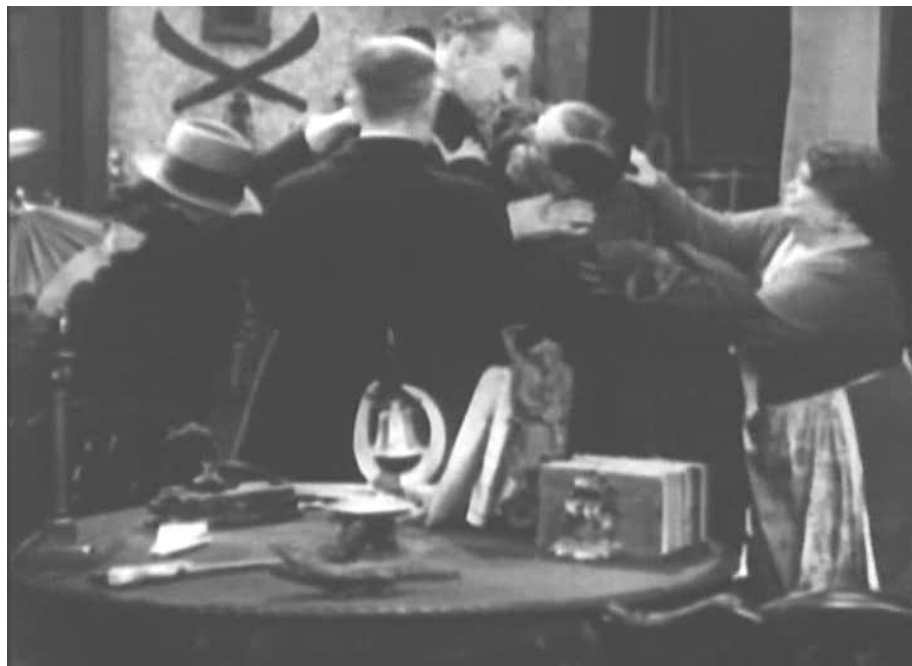
Figure 17 - The inelegant Professor Moriarty

professor, Moriarty seems most unlike Holmes and most animalistic when he is most himself. At the final reveal, when his disguise is ripped off by Inspector Lestrade's officers and all pretense is discarded, Moriarty attempts to strangle Holmes with his bare hands and shouts that he will destroy him. He seems overcome by emotion and completely irrational, just another low-life criminal that will go to the docks, and perhaps the gallows, due to the "great mentality" of Sherlock Holmes.