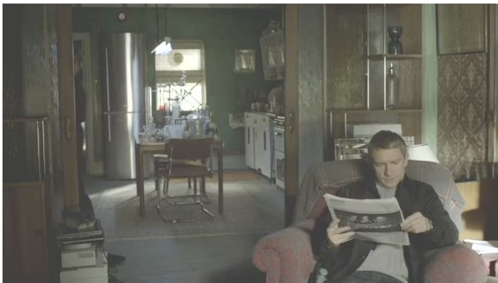
Figure 7 - Martin Freeman in 221B, complete with science experiments

When he meets John through a mutual acquaintance, he immediately shows off his detective talents and assumes that John is a prospective flatmate. John is left puzzled and amused but he can no longer say, as he did to his therapist in the opening that "nothing ever happens" to him. When he goes to see the flat in question, the fabled 221B, he says that it could be quite nice it were tidied up a bit. Unfortunately, the mess is Sherlock's things, which he has already moved into the flat. This disorder will be the continuing state of the flat, a jumble