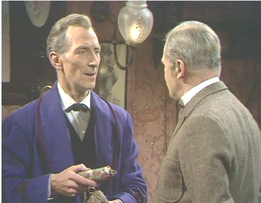
Figure 11 - Cushing's Holmes receives a Christmas present

Watson gives Holmes a Christmas present of tobacco, which pleases and flusters Holmes, who has no present in return. He replies, "My dear old friend! This is so very kind of you. . . my dear Watson, I am at a loss." Watson answers that it is not like him to be at a loss for words and they both chuckle. Watson insists it's merely a token, to which Holmes responds, "Yes, but I -- I regret that the exchanging of presents at