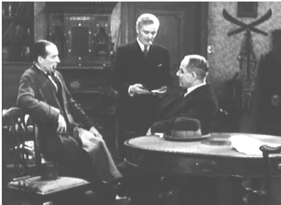
Figure 1 - 221B Baker S. in The Sleeping Cardinal , with a friendly Lestrade