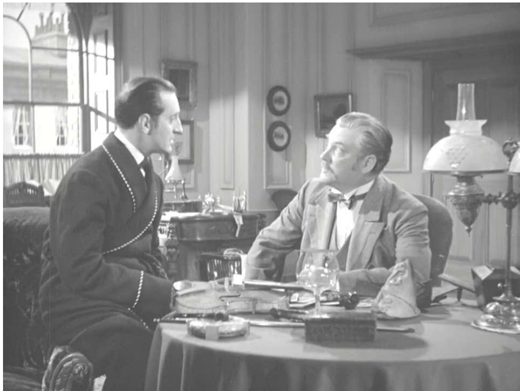
Figure 3 - Basil Rathbone and Nigel Bruce in their cheery 221B