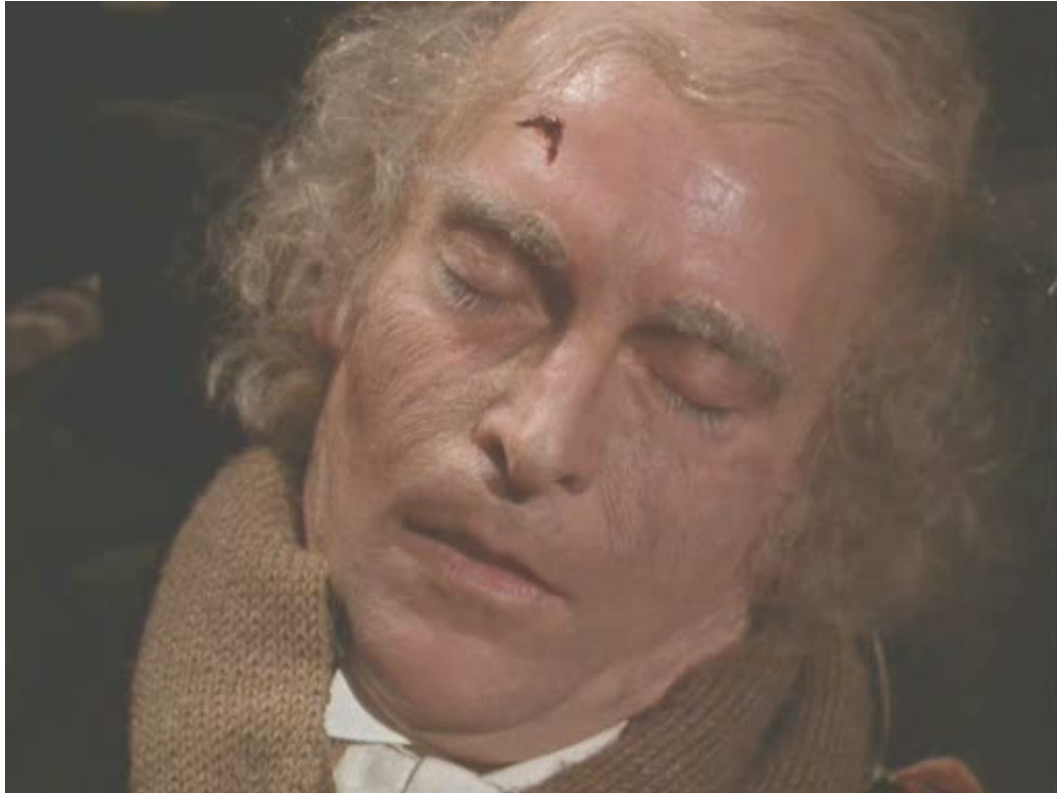
Figure 6 - Jeremy Brett's Holmes disguised as a preacher

Holmes' penchant for disguise also mirrors Adler's; she disguises herself as a boy and is convincing enough to fool