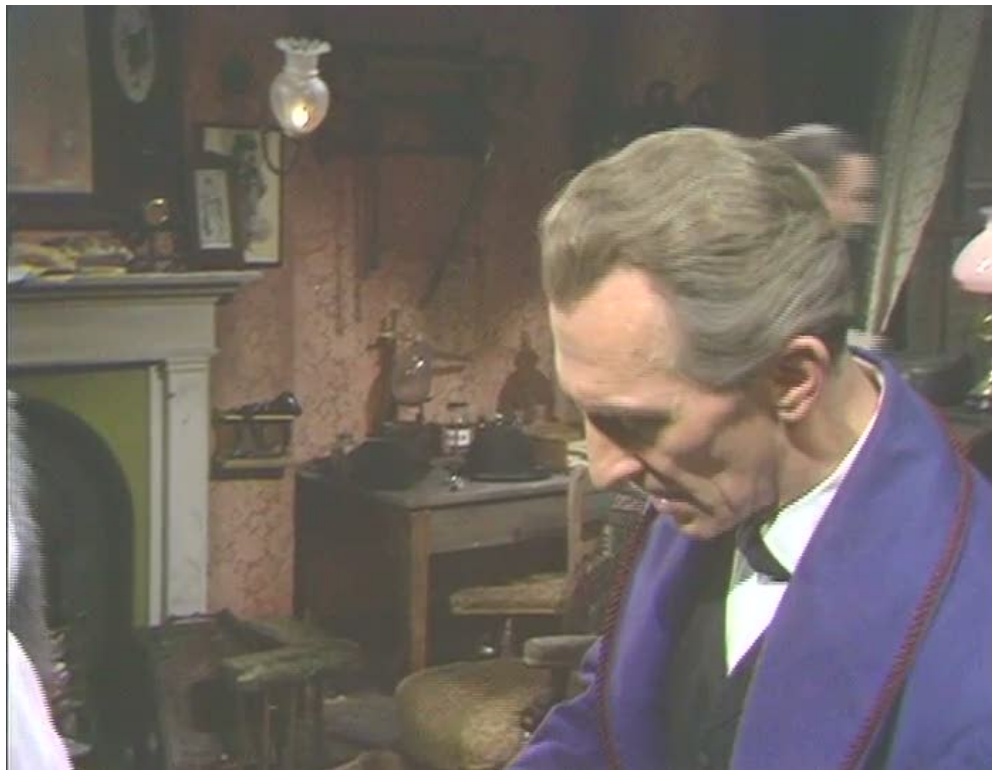
Figure 4 - Peter Cushing in an overstuffed 221B

Likewise, this Holmes is more bohemian than in earlier adaptations. 221B Baker Street is more the overstuffed, genteel-but-shabby bachelor's quarters described in Doyle's stories than the clean, cheery rooms we have seen to this point. While not unkempt or dirty in any way, the furniture and set dressings are all a bit worn and faded, shelves are crowded with books and the upholsteries are suitably Victorian and visually busy. Holmes also seems both more emotional and more emotionally needy. The fact