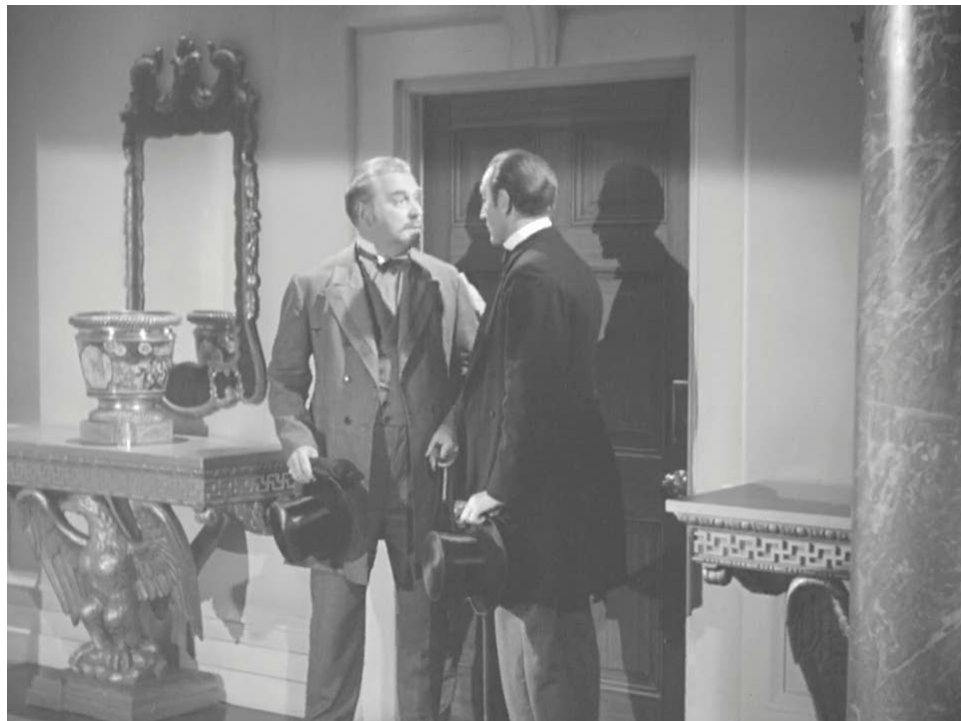
Figure 10 - Rathbone's Holmes teases Bruce's Watson

However, there is also a sense in which Holmes and Watson's competitiveness is also embedded in rough, somewhat juvenile joking that proves their affection for one