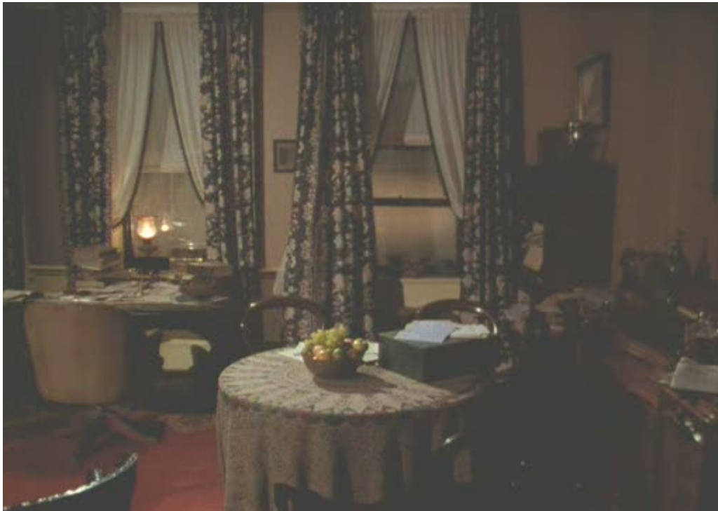
Figure 5 - Jeremy Brett's study in 221B

The set design of 221B subtly indicates this before any of the characters speak.