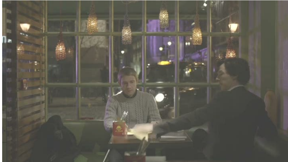
Figure 15 - Holmes and Watson on their first date