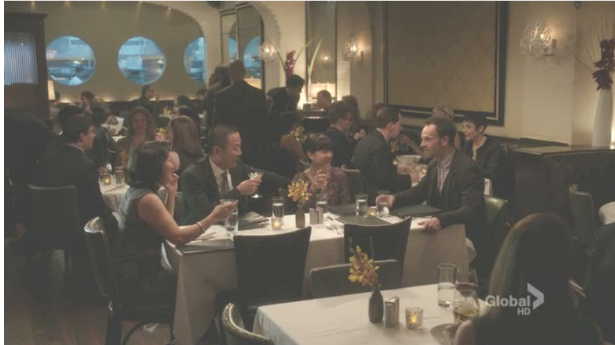
Figure 16 - Jonny Lee Miller's Holmes at the Watson family dinner

his consulting work, including the case from episode four, calling Watson "instrumental" to solving it. He tells them that she saved his life during that case and calls her "quite a promising detective in her own right." Regarding her work as a sober companion, he says, "She practices quite a unique specialty, your daughter. She rebuilds lives from the ground up. You can measure her success in careers restored. In my case, criminals caught and in lives saved." Her family is impressed by this. Afterwards, Watson thanks him for helping her family to understand her work and he answers, "I know my audience. I simply told them what they wanted to hear. They're nice people, your family, but they are, at their core, conventional. You make an effort to appear conventional, but I know, Watson, you share my love of all that is bizarre and outside the humdrum routine of ordinary life. Your family will never understand this, so I gave them some words that they would understand." Although Sherlock will not admit that his compliments were sincere, his actions are proof of his feelings for Joan, and he trades his previous compliments for a new one, more meaningful to him – that, like him, she is extraordinary. This is a contrast to the 1968 adaptation, in which Holmes can express his